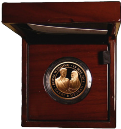
420) Five Pound Crown 2018 Prince of Wales 70th Birthday Gold Proof S.L56 FDC in the Royal Mint box of issue with certificate (£1,700 - £2,000)