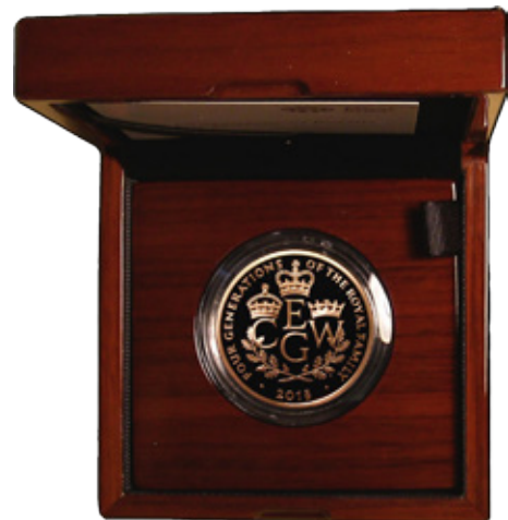
419) Five Pound Crown 2018 Prince Harry and Ms Meghan Markle Gold Proof S.L65 FDC in the Royal Mint box of issue with certificate, only 100 pieces minted with only 850 pieces issued in this format (£1,700 - £2,000)