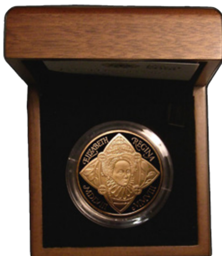
408) Five Pound Crown 2009 Henry VIII 500th Anniversary of his Accession Gold Proof S.L20 FDC in the Royal Mint box of issue with certificate (£1,600 - £2,000)