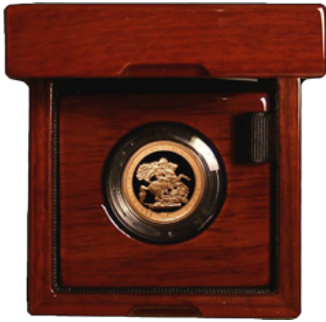
542) Sovereign 2017 Proof, Milled edge S.SC12 nFDC in the Royal Mint box of issue with certificate ( £700 - £800 )