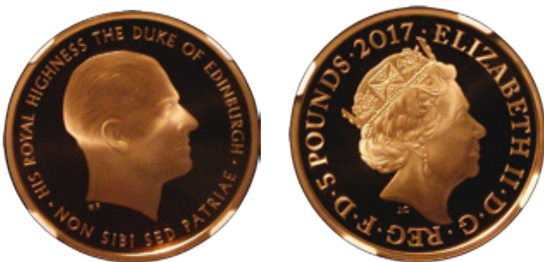
416) Five Pound Crown 2017 Queen Elizabeth II and Prince Philip 70th Wedding Anniversary Gold Proof S.L57 FDC in the Royal Mint box of issue with certificate (£1,700 - £2,000)