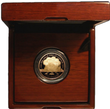
620) Two Pounds 2017 Jane Austen Gold Proof S.K45 FDC in the Royal Mint box of issue with certificate ( €600 - €700 )