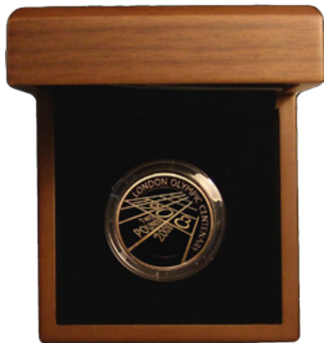
613) Two Pounds 2008 Olympic Games Handover to London Gold Proof S.4952 Gold Proof FDC in the Royal Mint box of issue with certificate (£600 - £650)