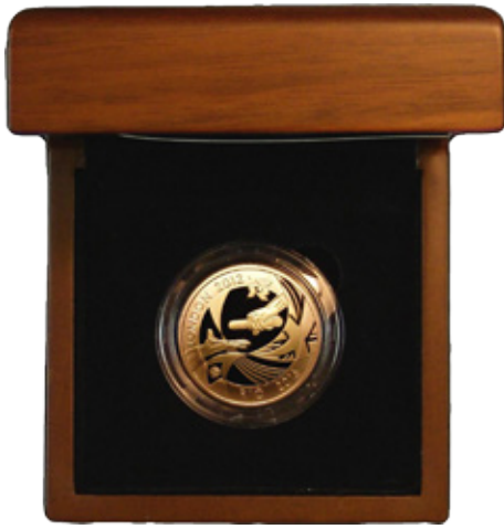
617) Two Pounds 2014 Outbreak of World War I 100th Anniversary - Lord Kitchener Gold Proof S.K34 FDC in the Royal Mint box of issue with certificate, only 734 issued ( €600 - €700 )