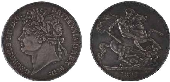
1141) Crown 1821 SECUNDO ESC 246, Bull 2310 NEF with some scratches and hairlines in the fields (£100 - £200)