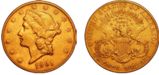
891) USA Twenty Dollars Gold 1908 Short Rays, Breen 7364 A/UNC and lustrous (£1,100 - £1,600)