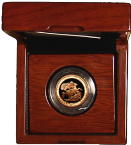
543) Sovereign 2017 Queen Elizabeth II and Prince Philip 70th Wedding Anniversary, struck on the Day 20 November 2017, S.SC10 BU in the white box of issue with certificate, issue limited to 750 pieces in this presentation format ( £250 - £500 )