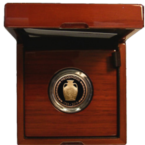
624) Two Pounds 2019 350th Anniversary of Samuel Pepys Last Diary Entry Gold Proof FDC in the Royal Mint box of issue with certificate, only 350 pieces issued, with just 225 in this format ( €700 - €800 )