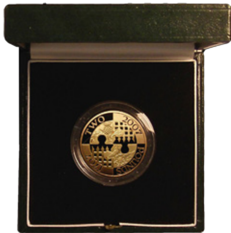
612) Two Pounds 2008 100th Anniversary of the 1908 London Olympics Gold Proof S.4951 nFDC to FDC the obverse with a slight hint of toning, in the Royal Mint box of issue with certificate (£600 - £650)