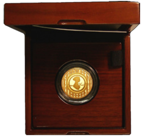
621) Two Pounds 2017 Queen's Beasts - The Unicorn of Scotland (5) each One Ounce of silver, FDC in the Royal Mint boxes of issue with certificates ( €200 - €250 )