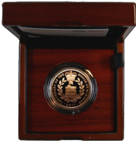
415) Five Pound Crown 2017 Prince Philip - A Lifetime of Service Gold Proof S.L56 in an NGC holder and graded PF70 Ultra Cameo, in the Royal Mint box of issue with certificate number 38. Only 350 pieces minted, with only 50 in this presentation format (£1,700 - £2,000)