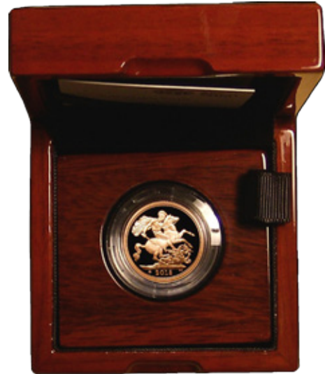
548) Sovereign 2018 65th Anniversary of the Coronation Proof with 65 in Crown Privy mark S.SC13 nFDC to FDC the obverse with small touches of red tone, in the Royal Mint box of issue with certificate ( £300 - £600 )