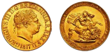
1517) Sovereign 1817 Marsh 1 in an NGC holder and graded MS62 (£3,200 - £4,500)