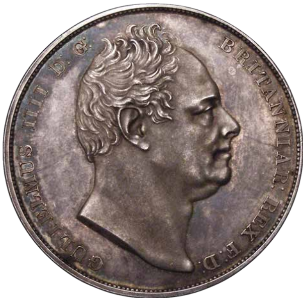
1142) Crown 1831 WW incuse on truncation Plain edge Proof, ESC 271, Bull 2462, die axis inverted, 27.34 grammes, nFDC with rich original gold and blue/green tone, a very rare and desirable type forming part of the Proof set of the year. All William IV Crowns are highly prized and this type is missing from many advanced Crown collections (£12,000 - £20,000)