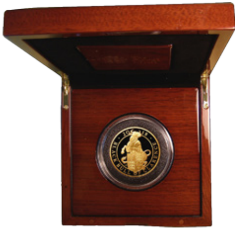
396) Five Hundred Pounds 2018 Queen's Beasts - The Red Dragon of Wales 5oz. Gold Proof S.QCH3 FDC in the Royal Mint box of issue with certificate and booklet, only 90 pieces minted with just 75 in this presentation format (£7,000 - £8,000)