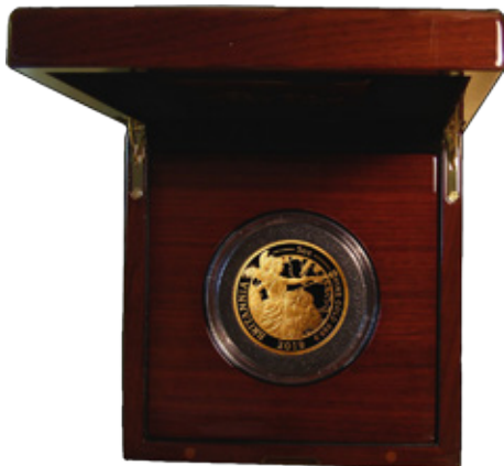
398) Five Hundred Pounds 2019 Chinese Lunar Year of the Pig - Shengxiao Collection, 5oz. Gold Proof FDC in the Royal Mint box of issue with certificate number 31 of just 38 pieces minted (£7,000 - £8,000)