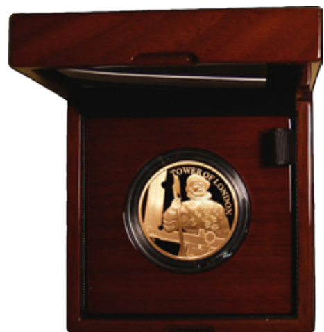
425) Five Pound Crown in Gold (2) a two-coin set 2005 Nelson and Trafalgar Gold Proofs FDC cased as issued with certificate (£2,000 - £3,000)