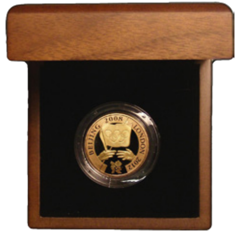
614) Two Pounds 2009 250th Anniversary of the Birth of Robert Burns Gold Proof S.K24 FDC in the Royal Mint box of issue with certificate (£600 - £650)