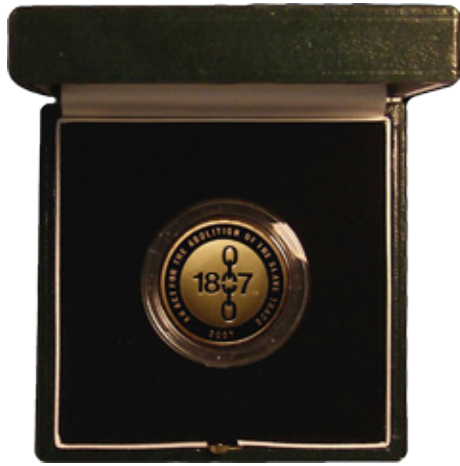
611) Two Pounds 2007 300th Anniversary of the Act of Union Gold Proof S.K22 FDC in the Royal Mint box of issue, only 750 issued (£550 - £650)