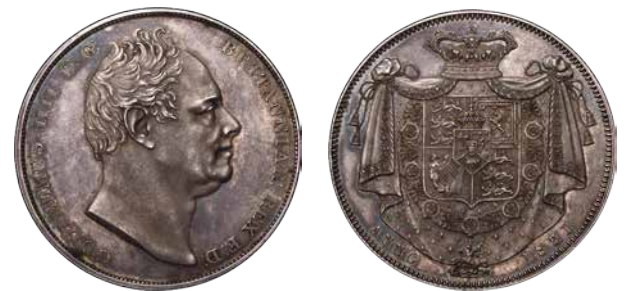
1143) Crown 1845 Cinquefoil stops on edge ESC 282, Bull 2564 NVF (£180 - £200)