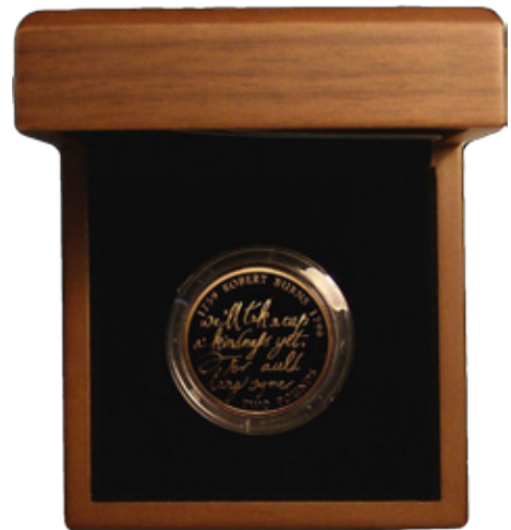
615) Two Pounds 2011 500th Anniversary of the Mary Rose Gold Proof S.KK27 FDC in the Royal Mint box of issue, only 692 issued (£600 - £650)