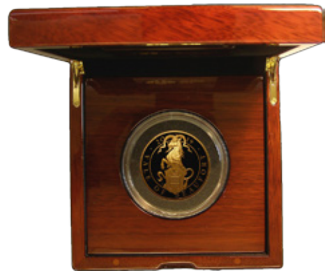
400) Five Hundred Pounds 2020 Queen's Beasts - The White Lion of Mortimer 5oz. Gold Proof FDC in the Royal Mint box of issue with certificate and booklet. Only 70 minted with just 55 in this format (£8,000 - £10,000)