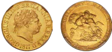
1518) Sovereign 1817 Marsh 1 in an NGC holder and graded MS62 a prooflike, choice example (£3,200 - £4,500)