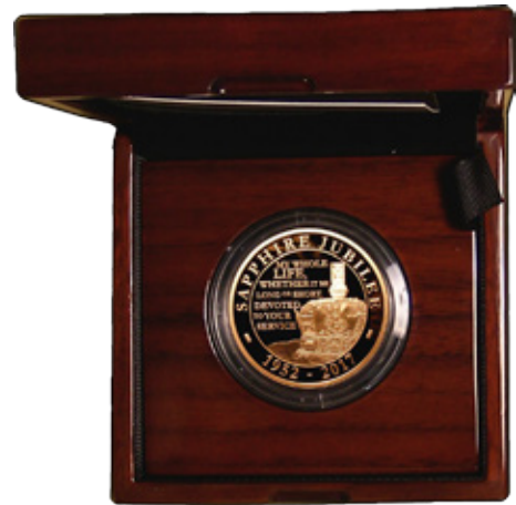
418) Five Pound Crown 2018 Four Generations of Royalty Gold Proof S.L70 FDC in the Royal Mint box of issue with certificate, only 500 minted (£1,700 - £2,000)