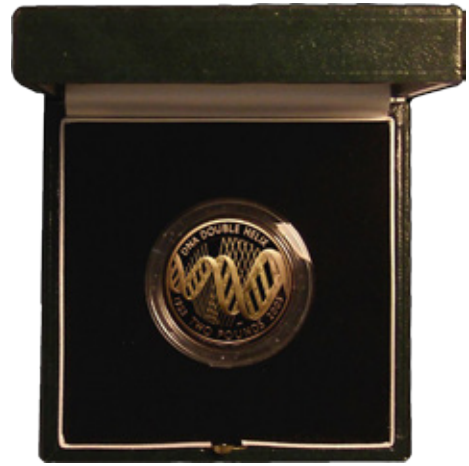
608) Two Pounds 2004 200th Anniversary of Trevithick's Locomotive Gold Proof S.K17 with some small nicks in the obverse field, nFDC/ FDC in the Royal Mint box of issue with certificate (£550 - £650)