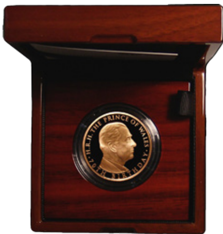
421) Five Pound Crown 2019 200th Anniversary of the Birth of Queen Victoria, Reverse an intricate and well-executed design showing portrait of Queen Victoria, plus other inventions of the Victorian Era, the Steam Train, Paddle Steamer, Penny Farthing Bicycle, and telephone, each within a series of cogwheels, edge inscription WORKSHOP OF THE WORLD, by John Bergdahl Gold Proof FDC as yet unlisted in the Spink catalogue, only 725 minted with just 450 in this format (£1,800 - £2,200)