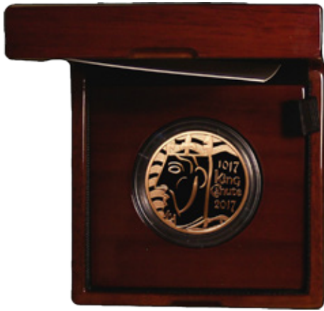
414) Five Pound Crown 2017 Centenary of the House of Windsor Gold Proof S.L49 FDC/nFDC the reverse with some tiny surface nicks, retaining mint original mint brilliance, in the Royal Mint box of issue with certificate (£1,800 - £2,200)