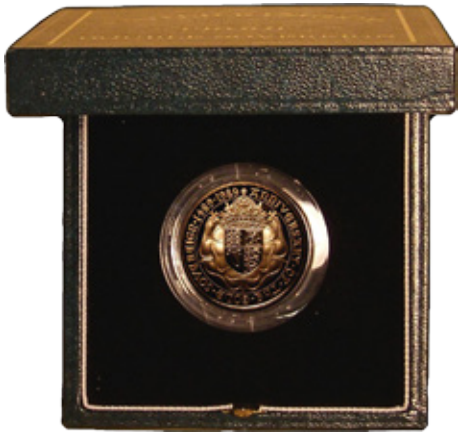
606) Two Pounds 2001 Marconi bridges the Atlantic 100th Anniversary, Gold Proof S.K11 FDC in the Royal Mint box of issue with certificate (£550 - £650)