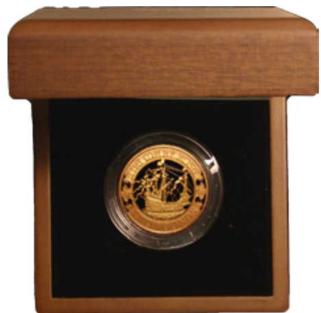
616) Two Pounds 2012 Olympic Games Handover to Rio Gold Proof S.4953 FDC in the Royal Mint box of issue with certificate, only 771 issued (£600 - £700)