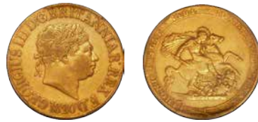
1522) Sovereign 1820 Large date, Open 2 with a gold mount attached (£250 - £350)