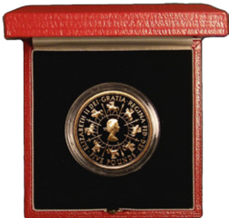
402) Five Pound Crown 1999 Diana Memorial Gold Proof S.L6 FDC in the Royal Mint box of issue with certificate (£1,800 - £2,400)