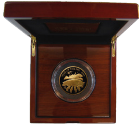
399) Five Hundred Pounds 2019 Queen's Beasts - The Yale of Beaufort 5oz. Gold Proof FDC, in the Royal Mint box of issue with certificate. only 70 minted with just 55 in this presentation format (£7,000 - £8,000)