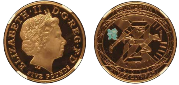
1208) Five Pound Crown 2011 London Olympics 1-Year Countdown Gold Proof S.4922 in an NGC holder with Royal Mint label. Graded NGC PF70 Ultra Cameo (£1,600 - £1,800)