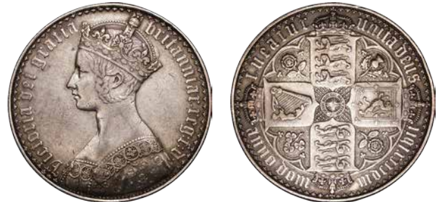
1145) Crown 1847 Gothic UNDECIMO ESC 288, Bull 2571 GVF/NEF (£1,000 - £1,800)