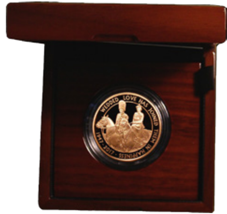
417) Five Pound Crown 2017 Queen Elizabeth II Sapphire Jubilee Gold Proof S.L51 FDC in the Royal Mint box of issue with certificate, only 750 pieces minted with just 650 in this format (£1,700 - £2,000)