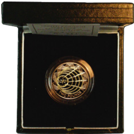
607) Two Pounds 2003 50th Anniversary of the DNA Discovery, Gold Proof S.K16 FDC in the Royal Mint box of issue with certificate (£550 - £650)