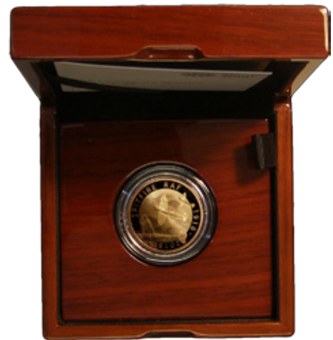
622) Two Pounds 2018 100th Anniversary of the RAF - Spitfire S.K52 Gold Proof FDC in the Royal Mint box of issue with certificate ( €600 - €700 )