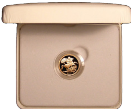
544) Sovereign 2017 Sapphire Jubilee of Queen Elizabeth II - Struck on the Day 6th February 2017 BU in the white box of issue with certificate number 007 of 750 minted ( £500 - £600 )