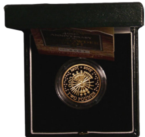
610) Two Pounds 2007 200th Anniversary of the Slave Trade Gold Proof S.K23 a few very minor nicks, otherwise FDC, in the Royal Mint box of issue with certificate (£550 - £650)