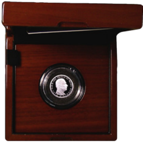
605) Two Pounds 1989 500th Anniversary of the First Gold Sovereign Proof FDC in the green Royal Mint presentation box with certificate (£500 - £750)