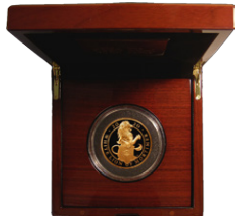
401) Five Pound Crown 1993 Coronation 40th Anniversary Gold Proof FDC in the box of issue without certificate (£1,100 - £1,700)