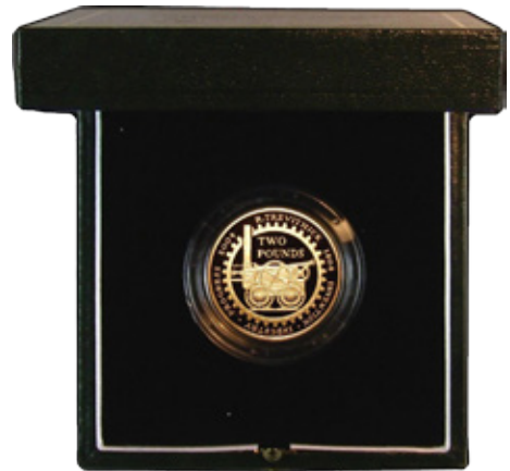
609) Two Pounds 2005 400th Anniversary of the Gunpowder Plot Gold Proof S.K18 FDC/nFDC the reverse with a few specks of red tone, in the Royal Mint box of issue with certificate number 0001 (£600 - £750)