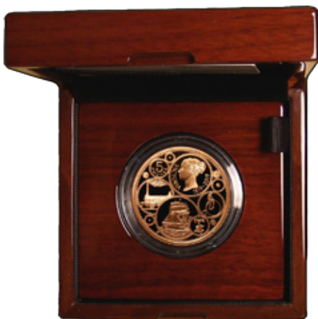
422) Five Pound Crown 2019 The Tower of London - The Ceremony of the Keys Gold Proof FDC in the Royal Mint box of issue with certificate and booklet, only 385 pieces minted with just 325 in this presentation format (£1,700 - £2,000)