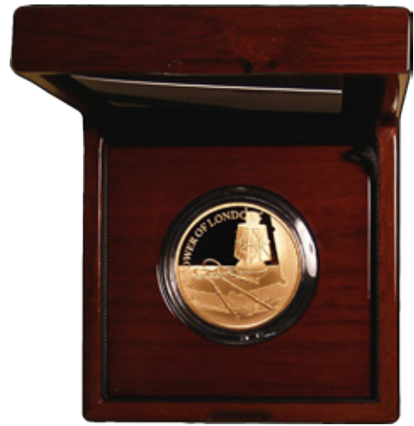
423) Five Pound Crown 2019 The Tower of London - The Crown Jewels Gold Proof FDC in the Royal mint box of issue with certificate and booklet, only 385 pieces minted with just 325 in this presentation format (£1,700 - £2,000)