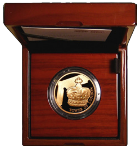
424) Five Pound Crown 2019 The Tower of London - The Yeoman Warders Gold Proof FDC in the Royal Mint box of issue with certificate, only 385 pieces minted, with just 325 in this presentation format (£1,700 - £2,000)