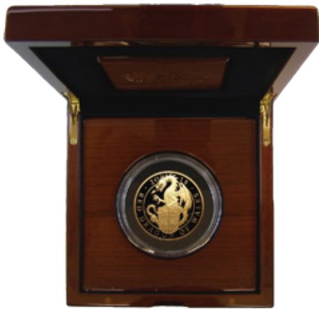
397) Five Hundred Pounds 2019 Britannia 5oz. Gold Proof, FDC in the Royal Mint box of issue with certificate, only 70 pieces minted with just 57 in this presentation format (£7,000 - £8,000)