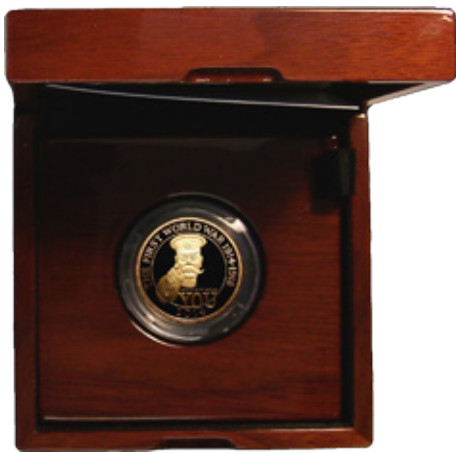
618) Two Pounds 2014 Year of the Horse a 2-coin set S.5100A and 2014 Year of the Horse Error mule with the toothed border obverse used for the €2 Britannia S.5100B both Lustrous UNC in the Coin Portfolio Management box with certificate ( €50 - €70 )