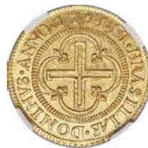
31087 Jose I gold "Josephus" 4000 Reis 1751-(L) MS62 NGC, Lisbon mint, KM171.2, LMB-310. Displaying well-balanced eye appeal with sunny golden luster abounding in the fields. From the Santa Cruz Collection Starting Bid: $450