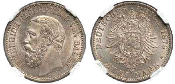
33830 Baden. Friedrich I 2 Mark 1876-G MS64 NGC, Stuttgart mint, KM265. A lightly toned example with subdued yet splendid luster throughout. Starting Bid: $250