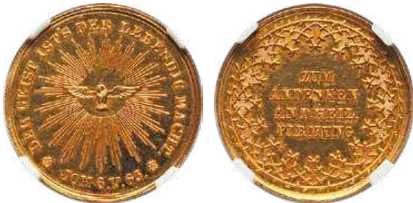
33827 Augsburg. Free City gold "Healing" Souvenir Medallion ND (c. 1830) MS65 Prooflike NGC, KM-Unl., Fr-Unl. 22mm. 2.82gm. Obv. Spirit dove in ray gloriole. Rev. Four lines of font in ornamentation. A scarce souvenir/token issue, the first of its kind we have seen. Starting Bid: $200