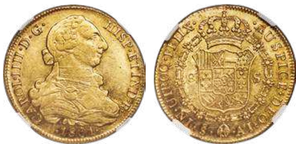
31268 Charles IV gold 8 Escudos 1801 So-AJXF45 NGC , Santiago mint, KM54. Subtle apricot tones hidden in the protected recesses, a few barely significant planchet flaws within the garter on the reverse. Starting Bid: $700