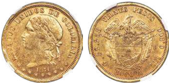
31330 Estados Unidos gold 20 Pesos 1871-BOGOTA AU58 NGC , Bogota mint, KM142.1, Restrepo-M336.7. Gleaming golden luster pervades in the fields of this high-quality example, which pushes the boundary toward uncirculated condition. A scarce type in this preservation, and notably the only offering of this date that we have seen from the Bogota mint. Ex. Dr. Frank Sedwick Collection Starting Bid: $1,000