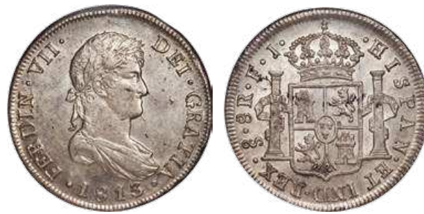
31270 Ferdinand VII 8 Reales 1813 So-FJ MS61 NGC , Santiago mint, KM80. Bold features and plenty of luster. One of only two Mint State examples graded by NGC. Starting Bid: $500