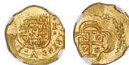
31930 Philip V gold Cob Escudo ND (1703-1713) MS66 NGC , Mexico City mint, KM51.1. 3.41gm. Of stunning technical caliber for the type, which usually becomes highly contested even into the lower echelons of Mint State. Exceedingly sharp in the shield, cross, and legends, with textured surfaces that become multi-faceted at the edge. It would be quite difficult to find a superior example, if even possible. Starting Bid: $1,000