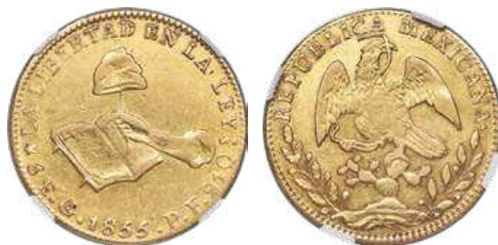
31980 Republic gold 8 Escudos 1855/4 Go-PF XF45 NGC , Guanajuato mint, KM383.7. Lightly circulated for the grade, the fields exhibiting gentle luster and with a somewhat matte appearance. Starting Bid: $400