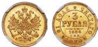
32158 Alexander III gold 3 Roubles 1884 СПБ-АГ MS63+ NGC, St. Petersburg mint, KM-Y26, Bit-13 (R). Obv. Crowned Imperial eagle with orb and scepter. Rev. Date and value in beaded circle. Full mint brilliance with a sharp strike. A few light marks are noted, but the overall eye-appeal is superb. Starting Bid: $1,750