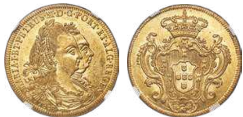
31097 Maria I & Pedro III gold 6400 Reis 1780-B MS61 NGC , Bahia mint, KM199.1, LMB-485. Fully Mint State, and benefitting from a well-centered strike that leaves a satisfying uniformity to the devices and bordering rims. Bright and lightly handled for the grade. From the Santa Cruz Collection Starting Bid: $400