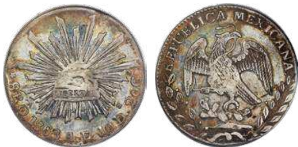
31976 Republic 8 Reales 1863 Oa-AE VF25 PCGS , Oaxaca mint, KM377.11, DP-Oa11. Variety with the “A” above “O” in the mintmark. An alluring representative of this difficult date and mint combination unveiling boldly-outlined design motifs protecting areas of mint luster. Unique tone lends further appeal, taking the form of olive-tinged metallic color outlined by oranges at the peripheries. Starting Bid: $350