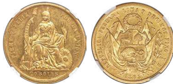
32086 Republic gold 20 Soles 1863 LIMA-YB MS61 NGC , Lima mint, KM194. Lustrous, and well struck, with the slightest hint of rubbing on the high points. A scarce one-year type. Starting Bid: $700