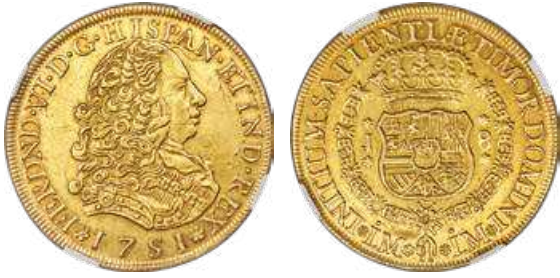
32066 Ferdinand VI gold 8 Escudos 1751 LM-J AU55 NGC , Lima mint, KM50. A light rose-gold tone can be seen along the peripheries within and around the legends, the fields beneath having a soft mirror finish. The central devices are boldly struck and exhibit minimal wear, confined mostly to the highest points, while the surrounding fields show a few minor contact marks. Reserve: $3,000