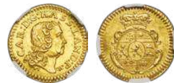
31502 Hesse-Cassel. Karl gold Ducat ND (1724-1725) UNC Details (Cleaned) NGC, KM392, Fr-1277. The obverse of this scarce Ducat type takes on a superb and nearly glowing satiny complexion, a pervasive gleaming frost surrounding Karl's bust. A fine example of the issue, struck to nearly full detail, with any evidence of cleaning seemingly confined to the reverse. Starting Bid: $400