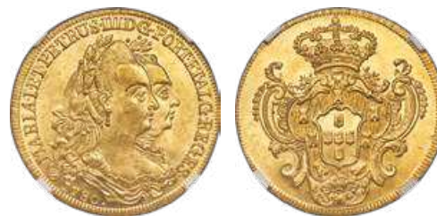
31095 Maria I & Pedro III gold 6400 Reis 1780-R MS64 NGC , Rio de Janeiro mint, KM199.2, LMB-462, Gomes-30.09. Superbly preserved for the type, the planchet a warm butter gold and revealing great care in preservation. None grade finer across either PCGS or NGC. From the Santa Cruz Collection Starting Bid: $750