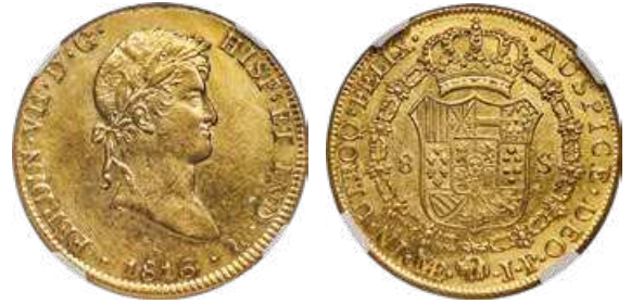
32078 Ferdinand VII gold 8 Escudos 1816 LM-JP AU Details (Cleaned) NGC , Lima mint, KM129.1. The light hairlines referred to by the grade designation are few and thus do not significantly detract from the overall appeal of this boldly struck example. Starting Bid: $400