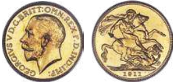
31699 George V gold Proof Sovereign 1911 PR63+ PCGS, KM820, S-3996. A sharply mirrored specimen displaying no heavier hits or signs of contact. A worthy representative for the discerning collector. Reserve: $1,000