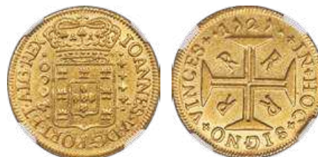
31072 João V gold 4000 Reis 1727/6-R AU Details (Harshly Cleaned) NGC , Rio de Janeiro mint, KM102, Fr-27, LMB-179. The first example of this scarcer overdate that we have offered, showing a clear outline of the digit "6" underneath the "7" in the date. From the Santa Cruz Collection Starting Bid: $500