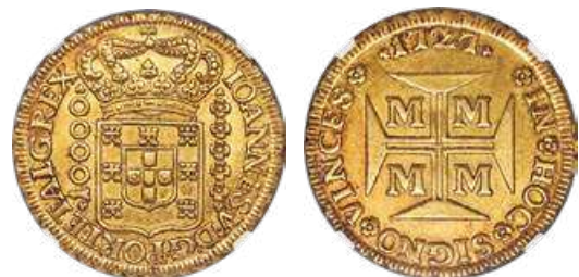
31081 João V gold 10000 Reis 1727-M AU58 NGC , Minas Gerais mint, KM116. A lightly toned example with vibrant luster and a hint of mirroring in the peripheral fields. Strongly struck and a desirable selection of the type. From the Dresden Collection Starting Bid: $1,750