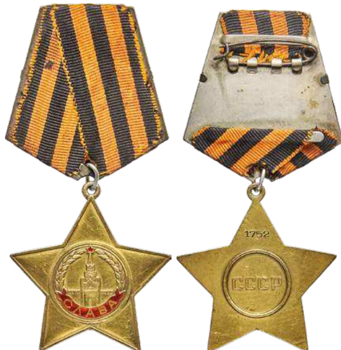
32186 USSR gold Order of Glory First Class Breast Star ND (Instituted 1943) XF (surface hairlines), Barac-1026, M&S-pg. 194 (R3). Type 1. Serial #1752 stamped at top of reverse. Awarded to the rank and file of the Army who had shown great feats of courage in battle. A suspension, and ribbon, are attached to the top point of the five-pointed star. Obv. The Kremlin's Spassky Tower is pictured in a circular central medallion of the five-pointed star with the Russian word for GLORY below the tower. Rev. A central circle containing the Cyrillic word for USSR, "СССР." In the upper point of the star is the serial number. Starting Bid: $2,500