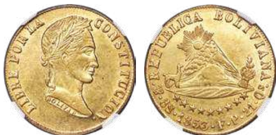
31053 Republic gold 8 Scudos 1853 PTS-FP AU58 NGC , Potosi mint, KM116. An exceptional example with well-struck details and full mint brilliance, and none of the usual flan flaws which plague this series. Rare in this splendid quality and especially desirable with the Norweb pedigree. Ex. Norweb Collection Reserve: $3,300