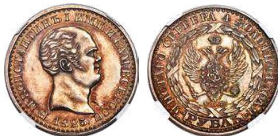
32130 Constantine I silver "Antiquarian Forgery" Rouble 1825 MS61 NGC , Bit-C6 (R4). The so-called "Antiquarian Forgeries" are copies of the original pattern Rouble probably produced in the mid-1800's. The piece we offer here has a near-flawless strike with reflective fields, gold and russet patina covers surfaces with only light evidence of handling. Starting Bid: $750