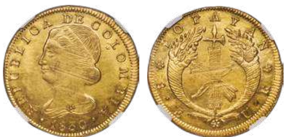
31323 Republic gold 8 Escudos 1830 POPAYAN-UR MS61 NGC , Popayan mint, KM82.2. A lustrous, Mint State example with light adjustment marks in the centers and numerous die polishing marks in the fields. Starting Bid: $750