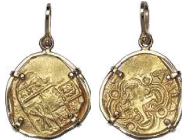
32230 Philip V gold Shipwreck Cob 2 Escudos ND XF , KM14.2, Fr-8, Cal-Type 89. 8.52gm (with mount), 6.65gm (unmounted). Ex. 1715 Plate Fleet. Recovered from the 1715 Plate Fleet, this coin is sold with accompanying Cobb Coin Company, Inc. certificate. The coin is mounted in a loop with ring attachment for jewelry wear and represents a true "treasure coin" of the Spanish colonial era. Starting Bid: $400