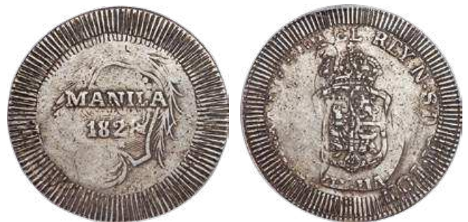
32096 Spanish Colony. Ferdinand VII Mint Error - Double-Struck "Manila" Counterstamped 8 Reales 1828 XF40 PCGS , Manila mint, KM24. An exceptional rarity, the sole known example to have been double-struck (noted as such by PCGS) and bearing a full, bold fluted border to both sides. Struck over a Peru Lima 8 Reales, dark graphite toning resides within the border areas surrounding central fields of argent, details of the undertype clearly visible on both obverse and reverse. An always-popular counter-marked issue featuring MANILA and the date of issue, 1828. Starting Bid: $1,500