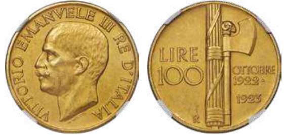
31908 Vittorio Emanuele III gold 100 Lire 1923-R MS61 Matte NGC, Rome mint, KM65, Fr-32. A boldly struck Mint State example with a lovely orange-gold patina and a matte finish. An attractive example of this desirable medallic type. From the Allen Moretti Swiss Collection Starting Bid: $750