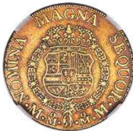
31955 Charles III gold 8 Escudos 1761 Mo-MM VF35 NGC , Mexico City mint, KM154. Order of the Golden Fleece on chest variety. A very rare subtype endowed with old-time toning and minimal handling in the fields, no adjustment marks or serious flan flaws present to wit. Reserve: $5,000