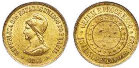
31139 Republic gold 20000 Reis 1896 MS61 NGC , Rio de Janeiro mint, KM497. Mintage: 7,043. Strong mint luster remains along with typical surface abrasions. Starting Bid: $500