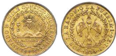
31283 Republic gold 4 Escudos 1834 So-IJ XF45 PCGS , Santiago mint, KM87. An attractive example with light signs of circulation and minimal contact marks. Starting Bid: $700