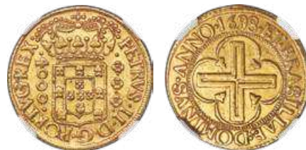
31055 Pedro II gold 4000 Reis 1698/7-(B) XF45 NGC , Bahia mint, KM89, LMB-26. Evenly worn and still quite detailed due to an admirable strike, the planchet toned to a subtle and alluring crimson gold. A lesser-seen earlier type in the Brazilian series. From the Santa Cruz Collection Starting Bid: $750