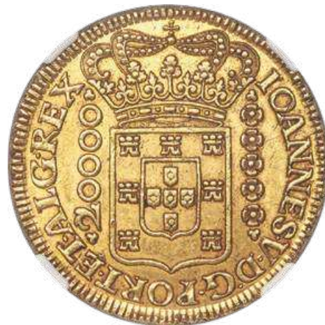
31084 João V gold 20000 Reis 1726-M MS62 NGC , Minas Gerais mint, KM117. A lovely piece with a satisfying heft when held, an impressive strike, strong underlying luster, and hints of coppery tones within the protected areas. From the Dresden Collection Starting Bid: $3,000