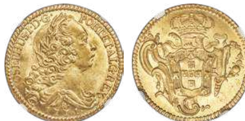
31094 Jose I gold 6400 Reis 1771-R MS62+ NGC , Rio de Janeiro mint, KM172.2, LMB-439, Gomes-55.25. Velveteen, with freshly lustrous surfaces that lend a charming appeal to this near-choice offering. From the Santa Cruz Collection Starting Bid: $450