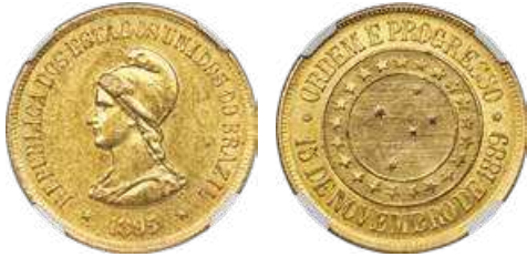
31138 Republic gold 20000 Reis 1895 MS61 NGC , Rio de Janeiro mint, KM497. Mintage: 4,811. A bright, lemon-gold patina with radiating mint luster and light surface abrasions. From the Dresden Collection Starting Bid: $450