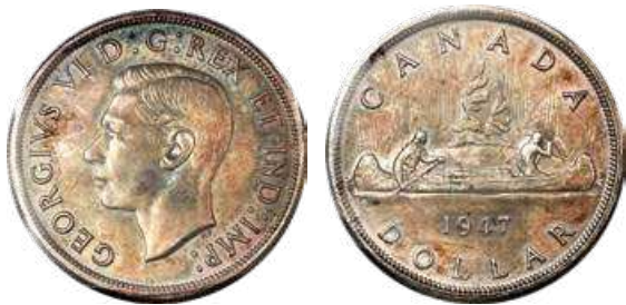
31195 George VI "Pointed 7 - Quadrupled HP" Dollar 1947 MS64 ICCS, Royal Canadian mint, KM37. Pointed 7, Quadrupled HP variety. Deeply toned in multicolored shades, with only a few ticks on George's bust preventing full gem certification. Starting Bid: $2,000