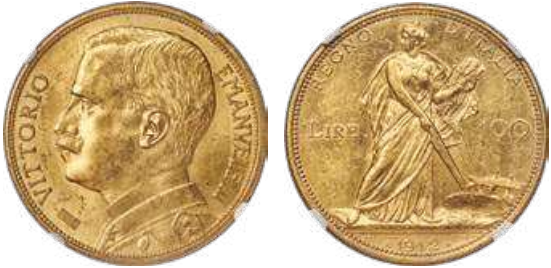
31906 Vittorio Emanuele III gold 100 Lire 1912-R MS61 NGC, Rome mint, KM50, Fr-26. Mintage: 4,946. A scarcer type owing to a mintage of under 5,000. The Mint State preservation of this offering is immediately felt in hand, bright golden luster abounding over the surfaces and a great clarity of detail made apparent by the sharpness of the strike. Starting Bid: $1,500