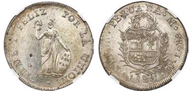
32079 Republic 8 Reales 1825 LM-JM MS62 NGC , Lima mint, KM142.1. Except for moderate softness of strike in the reverse legend at REPUB, the strike is bold for the issue. The surfaces exhibit moderate marks with full argent-gray mint luster. Starting Bid: $500