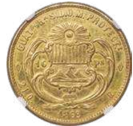
31746 Republic gold 16 Pesos 1869-R AU Details (Removed From Jewelry) NGC , KM188. A bright coin with an orange-gold tone, light edge bruising from where the mount had been and minor rub on the high points from contact wear. Starting Bid: $750