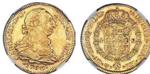
31954 Charles III gold 4 Escudos 1775 Mo-FM AU55 NGC , Mexico City mint, KM142.2. Sun-gold with a scintillating brilliance about the legends and surrounding the struck features. The bust of Charles remains expressive, showing only light highpoint rub, and is complemented by a sharp reverse showing virtually no wear to the devices themselves. Starting Bid: $1,000