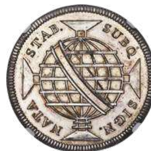
31106 João Prince Regent silver Proof Pattern 960 Reis 1809-R PR62 NGC , Rio de Janeiro mint, KM-Pn8, Bentes-E2.01, LMB-E012. With the transfer of the Portuguese Crown to Brazil in 1808, an act was passed to enable a monetary authority in the states of Rio de Janeiro, Minas Gerais and Bahia to buy Hispanic 8 Reales and other foreign crowns of similar size and strike 960 Reis. Seven Patterns were made, with slight variations of metal and design. The piece presented here, the smooth rim silver Pattern, remains the most elusive of all. The offering exhibits needle-sharp detail and reflective mirror surfaces unveiling hints of iridescence. This is only the second example of the type we have offered, the last uncertified and selling in 2013 (Auction 3021, Lot 20155) for $30,550 including Buyer's Premium. From the Dresden Collection Starting Bid: $4,000