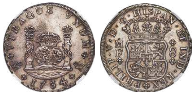
31927 Philip V 8 Reales 1734/3 Mo-MF AU Details (Environmental Damage) NGC , Mexico City mint, KM103. Sharply detailed with the ivory-toned surfaces taking on a slightly satiny character from the noted cleaning. Despite this feature the example remains a desirable early date in the series. Starting Bid: $400