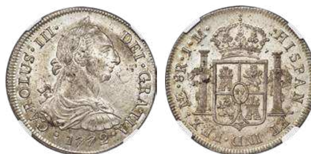
32072 Charles III 8 Reales 1772 LM-JM MS63 NGC , Lima mint, KM78. Flashy mint luster bursts from the fields of this choice piece, all nicely toned with a light gunmetal gray patina. Reserve: $3,000