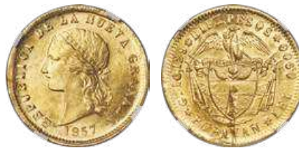
31325 Nueva Granada Mint Error - Reverse Lamination gold "Diez Pesos" 10 Pesos 1857-POPAYAN MS64 NGC , Popayan mint, KM122.1, Fr-85. An enchanting error specimen showing deep honeyed, lustrous fields with surprisingly few instances of handling for the grade. The only obvious occurrence of activity, of course, is the lamination error reaching from roughly 6 o'clock on the obverse directly toward the center. While quite noticeable, this error does not obscure any important features. The example thereby strikes an admirable balance between the academic intrigue of the mint error itself and the still-strong eye appeal of the coin's intended design. Starting Bid: $700