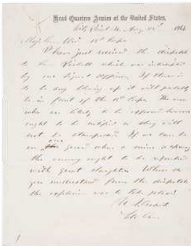
Ulysses S. Grant Autograph Letter Signed written from City Point on Aug. 25, 1864.