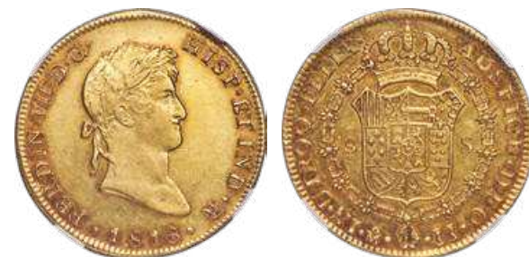
31966 Ferdinand VII gold 8 Escudos 1816 Mo-JJ AU53 NGC , Mexico City mint, KM161. An attractive example with a good strike, only light wear for the grade, underlying mint luster and coppery tones around the peripheries. Starting Bid: $400