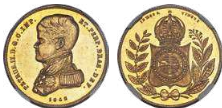
31124 Pedro II gold 10000 Reis 1842 MS62 NGC , Rio de Janeiro mint, KM457, LMB-623. With only one example certified finer than this by either NGC or PCGS, this selection approaches the pinnacle of technical quality for issue and represents a considerable conditional rarity thus. Often referred to as the “Admiral” series, this selection features the impeccably-styled bust of Pedro II in his naval uniform. This portrait has been superbly rendered here giving significant depth of detail, the fields behind semi-proof-like, a ring of rich amber toning at the peripheries. A particularly rare date within an already elusive issue, an excellent opportunity for the advanced collector. From the Santa Cruz Collection Starting Bid: $2,000