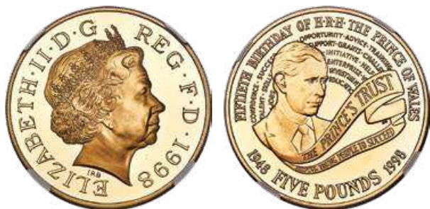
31722 Elizabeth II gold Proof “Birth of Prince Charles” 5 Dollars 1998 PR69 Ultra Cameo NGC, KM995b. Issued in celebration of Prince Charles’ 50th birthday. Mintage: 773. AGW 1.1771 oz. From the George Hans Cook Collection Starting Bid: $750