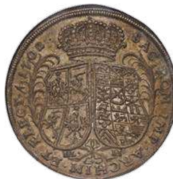
31534 Saxony. Friedrich August I Taler 1702 IL-H MS61 NGC, Dresden mint, KM707, Dav-2647. A lovely Mint State example with an attractive light espresso patina and an underlying lustrous sheen, a handsome, crisp strike and very few contact marks. Starting Bid: $500