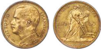
31905 Vittorio Emanuele III gold 50 Lire 1912-R MS63+ PCGS, Rome mint, KM49, Fr-27. Satiny devices sheathed in unmistakable mint brilliance make for an eye-appealing example of this popular type. Starting Bid: $450