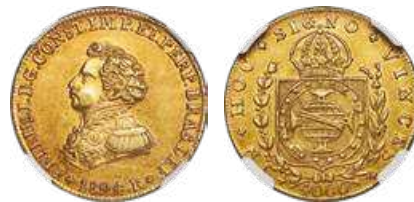
31114 Pedro I gold 4000 Reis 1824/3-R AU55 NGC , Rio de Janeiro mint, cf. KM369.1 (unlisted overdate), LMB-594var. (same). A handsomely toned example with hues of apricot and peach over orange-gold surfaces, with satiny mint luster hiding beneath. The portrait of Pedro is bold and well-struck with minimal wear on the high points of the design. From the Dresden Collection Starting Bid: $500