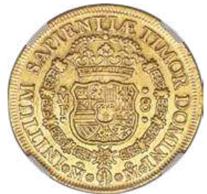
31938 Philip V gold 8 Escudos 1734 Mo-MF XF45 NGC , Mexico City mint, KM148, Fr-8. Softly struck in the central areas, with both sides exhibiting bright golden mint luster and noticeable reflectivity around the peripheries. An appealing example of this early issue, with surfaces displaying only a few small marks. Reserve: $5,000