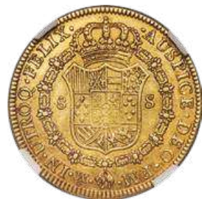
31958 Charles III gold 8 Escudos 1788 Mo-FM AU50 NGC , Mexico City mint, KM156.2a, Onza-788. Scarcer variety with inverted mintmark and assayer. Bordered by uniform rims from a well-placed strike, with considerable gleaming luster remaining across the surfaces. Starting Bid: $450