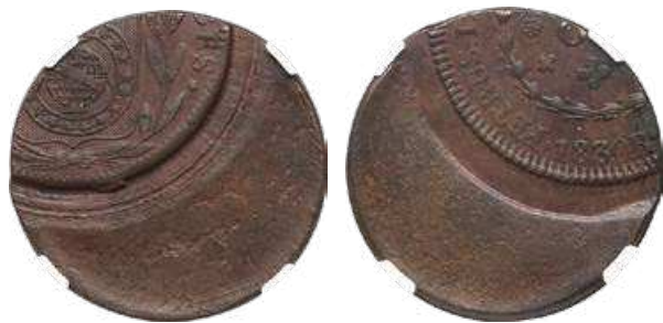
33415 Pedro I Mint Error - Struck 60% Off-Center 80 Reis 1830-R AU55 Brown NGC , Rio de Janeiro mint, KM366.1. An imposing offering struck drastically off-center. Such errors are few and far between, presenting a scarce opportunity for collectors of the series or of error coins in general. From the Dresden Collection No Minimum Bid