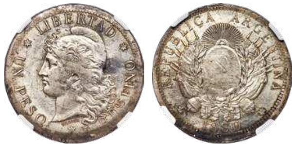
31009 Republic silver Unofficial Restrike Pattern Peso 1880 MS63 NGC, KM-Pn20, Janson-31. A toned example exhibiting strong die-polishing. A later strike as, according to Carlos Janson, no originals are known. Starting Bid: $350