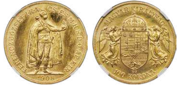
31761 Franz Joseph I gold Restrike 100 Korona 1908-KB MS67 NGC , Kremnitz mint, KM491. A gem strike with milky prooflike fields. AGW 0.9802 oz. Starting Bid: $600