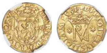
32196 Mary, Queen of Scots (1542-1567) gold 22 Shillings 1553 XF45 NGC, Fr-31, S-5396, Burns-pg. 289, 3. 2.38gm. Variety with pellet above crown. Struck prior to Mary's marriage to Francis in 1558 (1st Period, 1542-1558). A handsome type with light toning around the devices, and even wear. Good clarity of the legends and devices along with a nice flan lacking any flaws should see that this piece receives spirited bidding. Starting Bid: $2,500