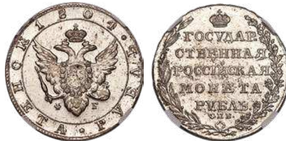
32128 Alexander I Rouble 1804 СПБ-ФГ AU58 NGC , St. Petersburg mint, KM-C125, Bit-38. Bordering exceptionally close to Mint State, this lustrous specimen offers scintillating argent fields complemented by devices lacking all but the most insignificant wear. Starting Bid: $450