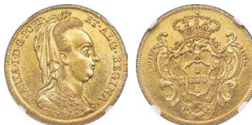
31101 Maria I gold 6400 Reis 1787-R AU55 NGC , KM218.1. Veiled bust type. Lightly toned with virtually no wear to speak of. From the Santa Cruz Collection Starting Bid: $400