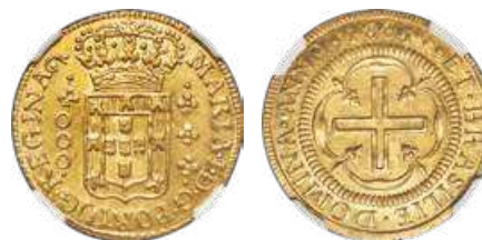
31100 Maria I gold 4000 Reis 1801/791-(B) MS62+ NGC Bahia mint, KM225.2, LMB-499. Sumptuous golden fields and a distinctive soft golden glow lend strong appeal to this clearly overdated type, with three out of the four digits showing earlier dating underneath. From the Santa Cruz Collection Starting Bid: $500