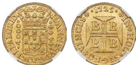
31069 João V gold 4000 Reis 1725-B AU58 NGC , Bahia mint, KM106, Fr-30, Gomes-103.12. Brassy gold color is exhibited across the entirety of the planchet, with only light circulation leaving abundant residual luster in the fields. From the Santa Cruz Collection Starting Bid: $400