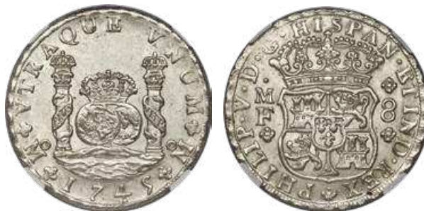
31929 Philip V 8 Reales 1745 Mo-MF MS63 NGC , Mexico City mint, KM103. Exceptionally bold in the centers with a bottle-cap like effect to the rims that creates an imposing border for the surfaces within, which for their own part unveil silky luster and a full bloom of icy frost. Starting Bid: $1,000