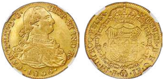
31318 Charles IV gold 8 Escudos 1806 P-JF AU Details (Cleaned) NGC, Popayan mint, KM62.2, Fr-52. Despite the noted cleaning, clear traces of watery brilliance persist in the outer registers, lending charm to what remains a desirable offering of the type, issued late in the reign of Charles IV. Reserve: $1,000