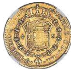
31959 Charles IV gold 4 Escudos 1807 Mo-TH AU55 NGC , Mexico City mint, KM144. Struck on the softer side, though displaying a well-outlined bust of the King nonetheless, along with fields retaining a strong degree of their original mint luster. Starting Bid: $500