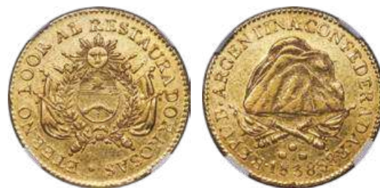
31013 La Rioja. Provincial gold 8 Escudos 1838-R XF Details (Mount Removed) NGC, La Rioja mint, KM9. An attractive example of this rare type, an old mount mark noted on the top of the rim, though the surfaces remain quite visually pleasing. Ex. Benito Collection Starting Bid: $1,000