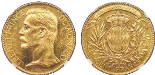
32008 Albert I gold 100 Francs 1896-A MS62 NGC , Paris mint, KM105. A bright, lustrous example with a bold strike and lightly prooflike surfaces. AGW 0.9334 oz. Starting Bid: $600