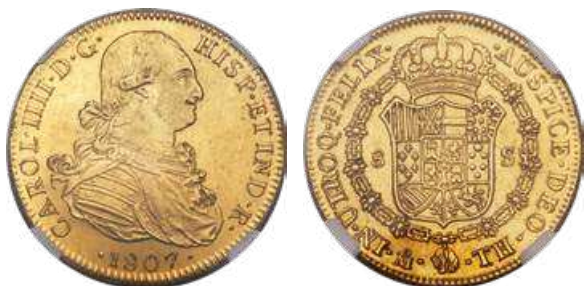
31962 Charles IV gold 8 Escudos 1807 Mo-TH AU Details (Scratches) NGC , Mexico City mint, KM159, Onza-1044. A well-detailed example of this popular gold denomination, with significant luster remaining in the fields. Quite attractive for the designation considering the mild nature of the marks noted. Starting Bid: $500