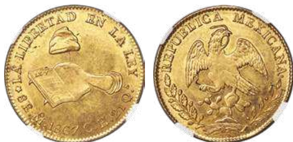
31992 Republic gold 8 Escudos 1867 Mo-CH MS62 NGC , Mexico City mint, KM383.9. This gleaming selection offers bright golden surfaces which retain a slightly watery character, alongside generally strong preservation for the type that places it near the edge of choice preservation. Worthy of a strong bid. Starting Bid: $1,000