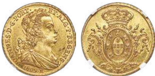
31112 João Prince Regent gold 6400 Reis 1809-R MS61 NGC , Rio de Janeiro mint, KM236.1. A handsome strike with considerable mint luster remaining, a saffron-gold patina and very light overall toning. From the Dresden Collection Starting Bid: $400