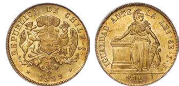
31287 Republic gold 8 Escudos 1839 So-IJ MS62 PCGS , Santiago mint, KM104.1. The first year of this popular and elusive Liberty type, displaying vibrant luster beneath light toning, and having virtually none of the flan flaws normally encountered with this issue. Starting Bid: $700