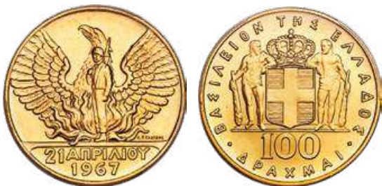
31739 Constantine II gold “1967 Revolution” 100 Drachmai ND (1970) MS66 PCGS, KM95. Mintage: 10,000. Struck to commemorate the April 21, 1967 revolution. Starting Bid: $600