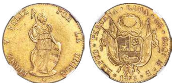
32084 Republic gold 8 Escudos 1855 LIMA-MB AU55 NGC , Lima mint, KM148.5. Variety with REPUB. A desirable selection with bold design features and surfaces remarkably free of lamination flaws, a common feature resulting from generally poorly produced planchets at the mint. The fields are imbued with a mild luster and a warm golden patina. Starting Bid: $500