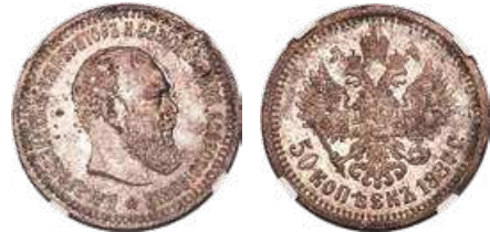
32155 Alexander III 50 Kopecks 1887-АГ MS63 NGC, St. Petersburg mint, KM-Y45, Bit-80 (R). Obv. Head of Alexander III right. Rev. Crowned Imperial eagle with date and value below. Mottled gray and argent-gray patina with full underlying mint luster and well-executed features. Starting Bid: $600