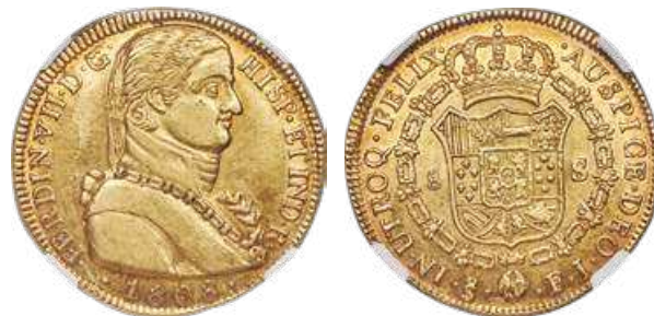
31271 Ferdinand VII gold 8 Escudos 1808 So-FJ AU55 NGC , Santiago mint, KM72. A lovely example with a bold strike and well-featured design of the king, light wear exists on the high points but is light and non-distracting. Overall a very handsome piece, exhibiting a honey-gold hue with light rose toning around the peripheries and devices. Starting Bid: $500