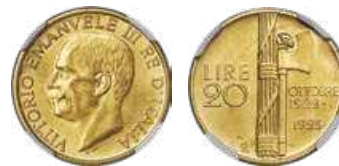
31901 Vittorio Emanuele III gold 20 Lire 1923-R MS61 NGC, Rome mint, KM64. Commemorating the one-year anniversary of the Fascist regime in Italy, this handsome coin features a bold strike and an attractive satiny-golden luster. From the Allen Moretti Swiss Collection Starting Bid: $500