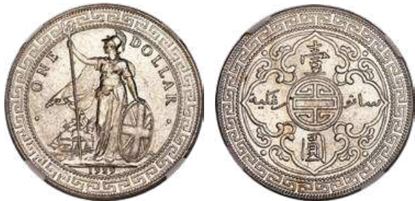
31704 George V Trade Dollar 1929/1-B MS64 NGC, Bombay mint, KM-T5. A classic overdate type displaying a clear outline of the digit “1”, most visible at the base of the last 9 in the date. Scarce and highly collectible in this condition, with brilliant white surfaces displaying prominent cartwheel luster. Starting Bid: $400