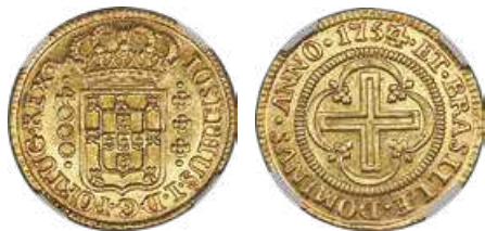
31088 Jose I gold 4000 Reis 1754/3-(L) MS62 NGC , Lisbon mint, KM171.1, LMB-295. Semi-prooflike and wholly attractive for both the grade and type, the luminous nature of the fields matched in quality by nearly fully rendered detail. From the Santa Cruz Collection Starting Bid: $450