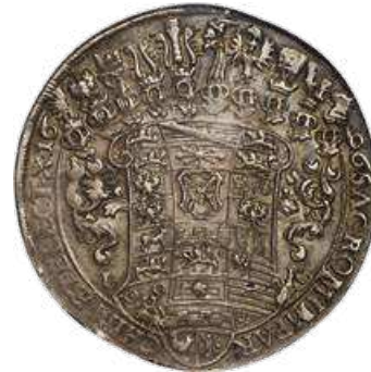
31533 Saxony. Friedrich August I Taler 1696-IK AU50 NGC, KM669, Dav-7652. Beautifully toned and well struck for this type, exhibiting subtly interwoven metallic tones over argent fields. Friedrich August was also king of Poland and known there as Augustus II. Starting Bid: $500