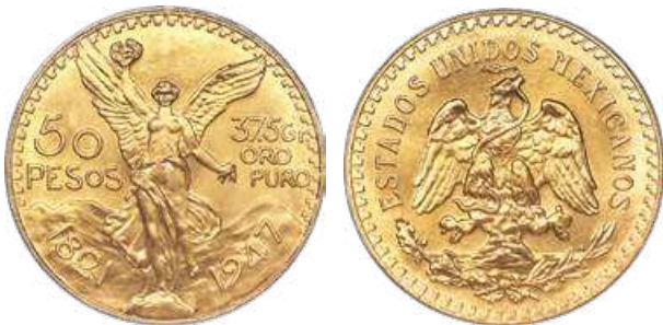
32006 Estados Unidos gold Matte Restrike 50 Pesos 1947 MS68 PCGS , Mexico City mint, KM481. The Matte pieces were made in small quantities in 1996. Bright, flawless, golden luster. The surfaces have a fantastic matte sheen unique among the 50 Pesos. Starting Bid: $900