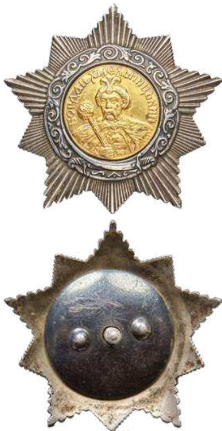
32185 USSR gold & silver Order of Bogdan Khmelnytsky Second Class Breast Star ND (Instituted 1943) AU (scratches), Barac-1023, M&S-pg. 118 (R3). Type 4, Screwback. This order was established by decree of the Supreme Soviet in 1943. It was given to members of the armed forces who demonstrated outstanding courage and patriotism during the liberation of Ukraine in 1943. Obv. Ten-pointed and rayed silver star with a 24mm gold medallion picturing Ukrainian hero Bogdan Khmelnytsky. The Russian words, Bogdan Khmelnytsky , surround his head. Rev. The reverse has a central screwpost with the mintmark "Monetny Dvor" below and engraved serial #1383 near the edge at six o'clock. Starting Bid: $2,000