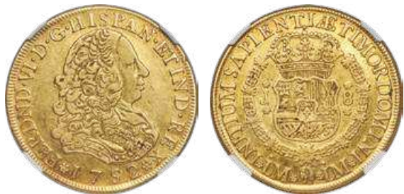
32068 Ferdinand VI gold 8 Escudos 1752 LM-J XF40 NGC , Lima mint, KM50. A bold example exhibiting a slightly lustrous saffron color and even wear. Starting Bid: $1,000