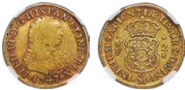
31946 Ferdinand VI gold 2 Escudos 1747 Mo-MF VF25 NGC , Mexico City mint, KM125, Cal-157. A lovely rarity with an attractive old reddish tone, even wear and no distracting contact marks. Similar in quality to both the Norweb and Caballero de las Yndias specimens. Very presentable and quite rare. Starting Bid: $5,000