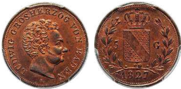
33828 Baden. Ludwig copper Specimen Pattern 5 Gulden 1827 SP66 Red and Brown PCGS, cf. Fr-150 (for type in gold). Apparently unlisted, this stunning Probe features highly lustrous surfaces with much remaining mint red, the high points toned in an appealing shade of bluish-brown. Very rare and the first of this type we have offered. Ex. Ernst Otto Horn Collection Starting Bid: $250