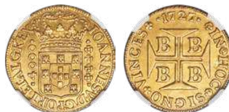
31073 João V gold 4000 Reis 1727-B AU58 NGC , Bahia mint, KM106, Fr-30, LMB-73. Copper-gold with a sound strike yielding ample detail, any handling close to imperceptible. From the Santa Cruz Collection Starting Bid: $600