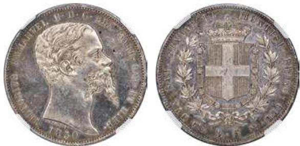
31889 Sardinia. Vittorio Emanuele II 5 Lire 1850 (Anchor)-P AU55 NGC , Genoa mint, KM144.2. A scarce type in this quality, and an appealing example with nearly full mint luster and a pleasing light tone. One of the more affordable dates in the series. Starting Bid: $1,000