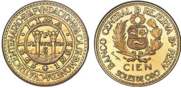
32090 Republic gold 100 Soles 1965 MS65 NGC , Lima mint, KM243. 400th Anniversary of the Lima mint. A gem selection with magnificent luster, the handsome designs of which reside on sun-bright metal with mirrored surfaces. AGW 1.3543 oz. Starting Bid: $750