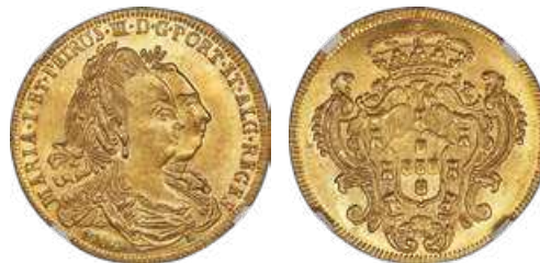
31099 Maria I & Pedro III gold 6400 Reis 1784-B MS63 NGC , Bahia mint, KM199.1, LMB-489. Struck with dies that vary somewhat in style from other dates that collectors may be accustomed to seeing from this type. Satiny with glowing luster, arguably conservatively graded given a lack of any significant contact or handling. From the Santa Cruz Collection Starting Bid: $750