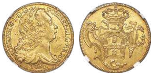
31091 Jose I gold 6400 Reis 1760-R AU58 NGC , Rio de Janeiro mint, KM172.2. A lightly toned example with hardly any noticeable circulation wear and a clean, bold strike. A small die-break and signs of light die-clashing are visible on the obverse, although unobtrusive. From the Dresden Collection Starting Bid: $400