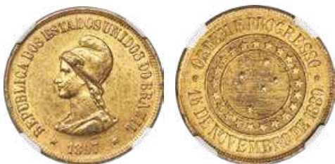
31141 Republic gold 20000 Reis 1897 MS61 NGC , Rio de Janeiro mint, KM497. Typical friction marks for the grade with underlying mint bloom. Starting Bid: $450