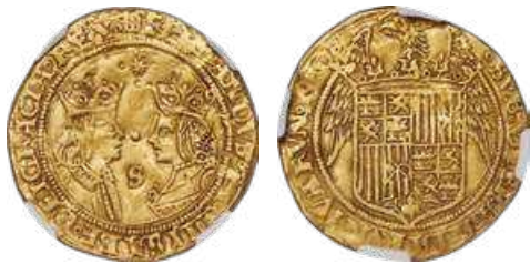
32227 Ferdinand & Isabella (1476-1516) gold 2 Excelentes ND (from 1497)-S XF Details (Damaged) NGC , Seville mint, Fr-129, Cay-2933. 6.79gm. Containing boldly struck details of Ferdinand and Isabella as well as the eagle and shield. Nice toning surrounds the devices and the gold exhibits a light lemony sheen throughout. Starting Bid: $400