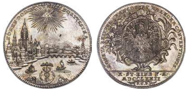
31500 Frankfurt. Free City Taler 1772-PCB MS63 PCGS, KM251, Dav-2226. It is easy to see why City View talers remain popular with collectors, and the example here offered is certainly no exception, displaying a highly detailed view of the old Frankfurt city alongside a vibrant ship-filled river scene. The reverse imagery is no less impressive, the struck details projecting boldly toward the viewer and begging for a closer look. Lightly toned, with a few areas of variegated charcoal coloration visible across the obverse. Starting Bid: $1,000