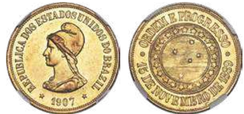
31144 Republic gold 20000 Reis 1907 AU58 NGC , Rio de Janeiro mint, KM497. A very lustrous example with wispy friction marks in the fields and very little circulation wear. From the Dresden Collection Starting Bid: $500