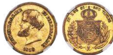
31125 Pedro II gold 10000 Reis 1859 AU55 NGC , Rio de Janeiro mint, KM467, LMB-651. A bright and lustrous coin with the light surface abrasions typically seen on coins in this long-running series. A scarce offering, especially so lightly circulated. Starting Bid: $750