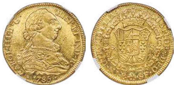
31307 Charles III gold 8 Escudos 1785 P-SF MS61 NGC , Popayan mint, KM50.2a, Restrepo-73.36. Intensely watery in the fields with well-rendered design features across both the obverse and reverse. Tied for finest certified by NGC, and the first Mint State example of this date from the Popayan mint that we have offered. Starting Bid: $500