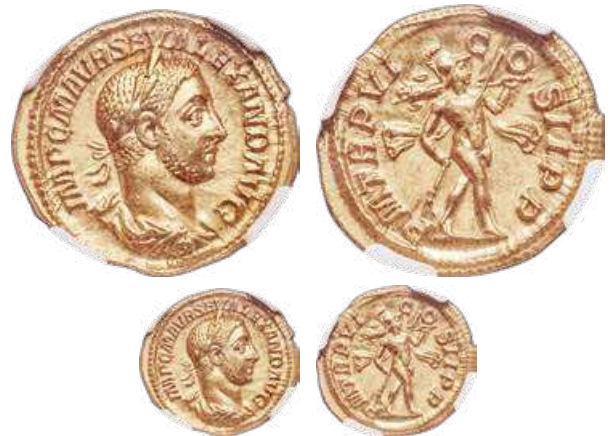
30294 Severus Alexander (AD 222-235). AV aureus (21mm, 6.26 gm, 7h). NGC MS 5/5 - 3/5. Rome, AD 227. IMP C M AVR SEV ALEXAND AVG, laureate, draped and cuirassed bust of Severus Alexander right, seen from behind / P M TR P VI-COS II P P, Mars advancing right, transverse spear in right hand, trophy in left over shoulder. RIC IV.II 60d. Calicó 3112. Starting Bid: $2,500