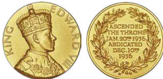
31709 Edward VIII gold Matte Specimen “Abdication” Medal 1936 SP68 PCGS, CM-347d, BHM-4277. By L.E. Pinches. Struck by John Pinches Ltd. 34mm. 36.66gm. Mintage: 100. Struck in a matte finish and preserved in virtually flawless condition, perhaps as the finest-graded example of the type seen by PCGS (the numbers somewhat unclear in this case). No official (Royal Mint) medal was struck, because of the controversy that raged in 1936 over the Prince of Wales, who became King upon his father’s death, but was determined to marry an American woman who had been twice divorced. This was not acceptable in England at that time, on two counts: she was a commoner, and divorced. However, a number of privately made medals were created at the time, by those who supported the Duke and for souvenir sellers. From the George Hans Cook Collection Starting Bid: $2,000