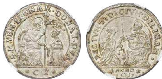
31894 Venice. Leonardo Dona Osella Anno III (1608) AU55 NGC , KM-Unl., Paolucci II, 91 (R), CNI-VIIIa.155. Milky patina resides within the recesses providing an attractive contrast to the lightly rubbed, darker tones of the high points of the designs. Well struck and well centered with hints of blue-gray tone. From the Allen Moretti Swiss Collection Starting Bid: $750