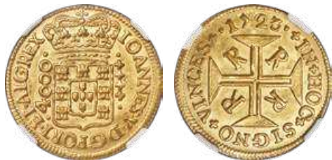
31066 João V gold 4000 Reis 1723-R MS63 NGC , Rio de Janeiro mint, KM102, LMB-175. A luxurious specimen displaying roundedness to the devices, joined by a satiny brilliance in the fields. An offering of undeniable beauty and quality. From the Santa Cruz Collection Starting Bid: $1,000