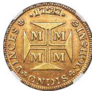
31086 João V gold 20000 Reis 1727-M AU50 NGC, Minas Gerais mint, KM117. A handsome example with minimal wear for the grade and nice rose-gold toning. Starting Bid: $2,000