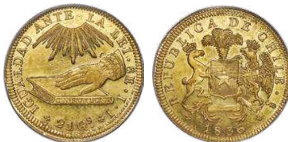
31286 Republic gold 8 Escudos 1836 So-IJ AU58 PCGS , KM93. An appealing coin with bold details and plenty of mint luster present. Overstruck on a Chilean 8 Escudos, KM84. Starting Bid: $600