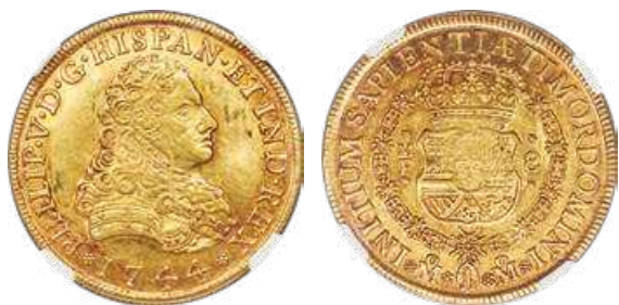
31941 Philip V gold 8 Escudos 1744 Mo-MF AU55 NGC , Mexico City mint, KM148. Gentle rose toning surrounds the devices, which display a mellow amber tone with considerable mint luster shining forth. The strike is decisively bold, although there is a touch of weakness in the very centers as well as some adjustment marks on the portrait of Philip. Reserve: $2,000