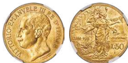
31903 Vittorio Emanuele III gold "Kingdom Anniversary" 50 Lire 1911-R MS61 NGC, Rome mint, KM54. Lustrous with only faint signs of handling, this uncirculated offering represents a pleasing and highly collectible example of the issue. Starting Bid: $400