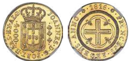
31111 João Prince Regent "Special Series" gold 4000 Reis 1816 UNC Details (Cleaned) NGC , Rio de Janeiro mint, KM312, LMB-578. A scarce and desirable one-year type referring to João by his full title in Latin as 'prince regent' (princeps regens). Bright details and despite cleaning, considerable luster remaining. Starting Bid: $1,500