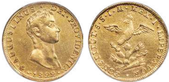
31968 Augustin I Iturbide gold 8 Escudos 1822 Mo-JM XF Details (Ex Jewelry) PCGS, Mexico City mint, KM313.1. A few hairlines can be seen on the reverse beneath each wing, and the coin has perhaps been chemically treated as it has a bright, untoned appearance. Otherwise it exhibits just light wear for the grade. An affordable and still quite collectible example of this desirable issue of Iturbide. Starting Bid: $750