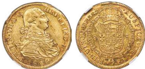
31277 Ferdinand VII gold 8 Escudos 1817/8 So-FJ MS60 NGC , Santiago mint, KM78, Fr-29. A glowing example bathed in warm cascading luster with good eye appeal noted for the grade despite some striking weakness toward 2 o'clock on the obverse and corresponding part of the reverse. Some dies dated 1818 were prepared by the Republicans before they had completed the engraving of the Republican 2-flags type, but those were eventually dismissed as unacceptable (since they would be proof of an Independent Republic issuing Colonial coinage) and repunched with the 1817 date. This fact accounts for the apparently puzzling 1817/8 specimens extant, which were struck in early 1818. Starting Bid: $750