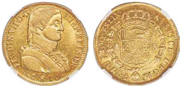
31273 Ferdinand VII gold 8 Escudos 1810 So-FJ AU55 NGC , Santiago mint, KM72, Onza-1346. An offering that could easily be mistaken for a Mint State example, its surfaces alight with glowing golden brilliance and its design expressed to satisfying clarity. Only close examination reveals a hint of wear to the higher points, and accordingly we feel that few specimens could offer such an abundance of appeal at this level. Reserve: $1,000