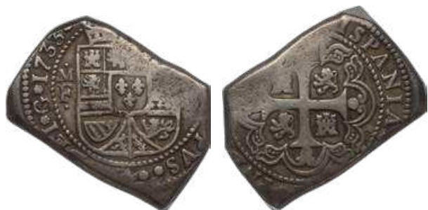
31926 Philip V Klippe Cob 8 Reales 1733 Mo-MF VF30 NGC , Mexico City mint, KM48. 26.90gm. Despite being struck on a highly irregular flan, this issue exhibits a strong and, considering the shape of the flan, well-centered strike with both date and assayer's initials fully visible. Though weakness is clearly detectable on the highpoints, together with even wear, the protected regions of the fields contain remnants of die polish lines and a subtle champagne hue. Starting Bid: $500