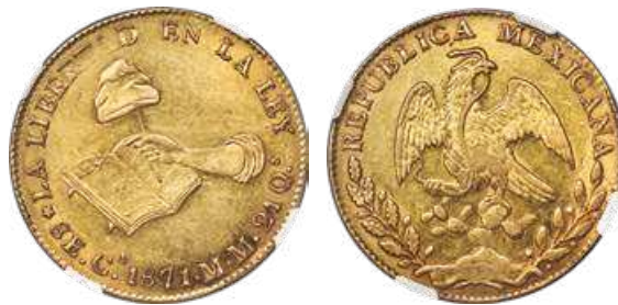
31994 Republic gold 8 Escudos 1871/61 CA-MM UNC Details (Cleaned) NGC , Chihuahua mint, KM383.1, Fr-67. A remarkably attractive original example of this overdate, with pleasing golden color throughout and a light toning that hangs onto the peripheries. Starting Bid: $500