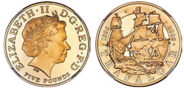
31733 Elizabeth II gold Proof "Battle of Trafalgar" 5 Pounds 2005 PR69 Ultra Cameo NGC, KM1053b. Struck in commemoration of the Battle of Trafalgar. AGW 1.1771 oz. From the George Hans Cook Collection Starting Bid: $750