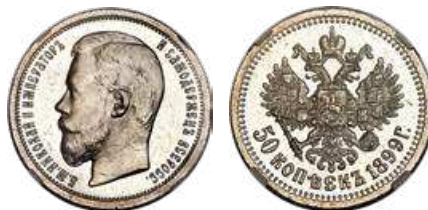
32160 Nicholas II Proof 50 Kopecks 1899-ЭБ PR63 NGC, St. Petersburg mint, KM-Y58.2, Bit-76. Fully captivating with only 4 examples of this date-assayer combination appearing in the NGC census, perfect satin frosting atop the devices and creating a mildly cameo contrast against the fields. Starting Bid: $1,500