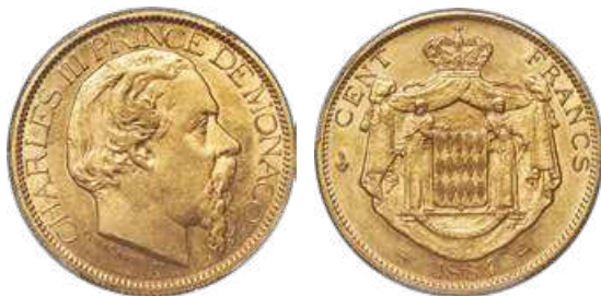
32007 Charles III gold 100 Francs 1884-A MS62 PCGS , Paris mint, KM99, Gad-MC122. A silken example that displays admirable visual allure for the assigned grade, owed primarily to the lack of any larger instances of handling. AGW 0.9334 oz. Starting Bid: $600