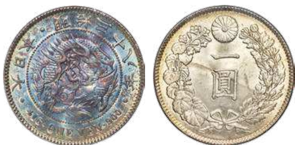
31912 Meiji Yen Year 18 (1885) MS64 PCGS , KM-YA25.2, JNDA 01-10. Colorfully toned by way of flaring intermingled hues of lilac, blue, and green on the obverse, making for a dramatic display of the iconic Meiji dragon design. The reverse glows with a more subtle yet luxurious display of soft argent luster, transforming to a uniform honeyed coloration at the legends. Starting Bid: $450