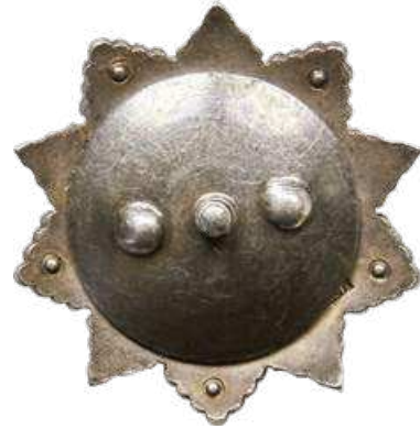
32184 USSR silver Order of Kutuzov Second Class Breast Star ND (Instituted 1943) XF , Barac-1017, M&S-pg. 105 (R3). Type 2, Screwback. This order was established by decree of the Supreme Soviet in 1942. Most of this order were given for heroic acts during World War II. Obv. The base is a ten-pointed star. The second piece is a five-pointed star with a circular central area containing an image of Mikhail Kutuzov surrounded by white enamel. Rev. A silver screwpost rests in the center, with the mintmark "Monetny Dvor" at twelve o'clock. The serial #2392 is engraved at approximately seven o'clock. Starting Bid: $1,250