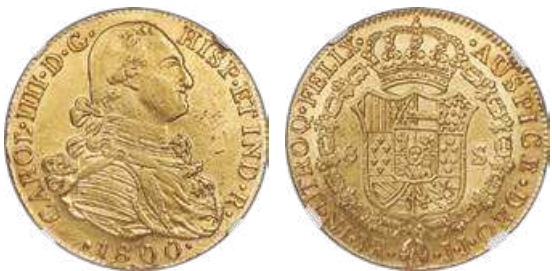
31317 Charles IV gold 8 Escudos 1800 NR-JJ AU Details (Whizzed, Edge Filed) NGC, Nuevo Reino mint, KM62.1. Well struck with bold devices. Starting Bid: $400