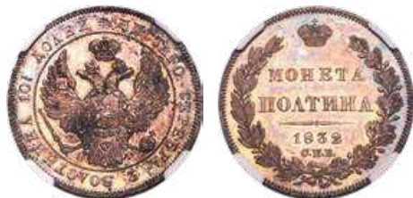
32137 Nicholas I Poltina (1/2 Rouble) 1832 СПБ-НГ MS63 NGC, St. Petersburg mint, KM-C167.1, Bit-236 (R1). Fully prooflike fields. Mottled gray and russet patina, with sharply struck details and a noticeable prooflike appearance. We note that NGC has certified one example of this type as “MSPL” and there seems to be no reason that this piece should not have been certified “Prooflike.” An extreme condition rarity and the finest piece certified by NGC. Starting Bid: $2,000