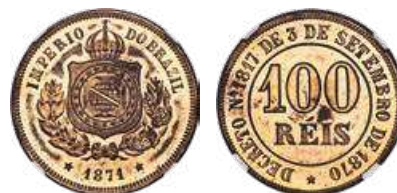
31116 Pedro II bronze Pattern 100 Reis 1871 MS65 Red and Brown NGC , KM-Pn145, Bentes-E42.05. A glowing specimen presenting ample, sharp detail over well-kept surfaces, primarily red in color and darkening only in a pattern that borders the central crowned shield and wreath, resulting in a pleasing framing effect. This example represents the finest that has been seen by NGC, and given its scarcity it is difficult to imagine that this position will be contested any time soon. From the Dresden Collection Starting Bid: $400