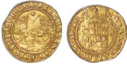
32224 Ferdinand & Isabella (1476-1504) gold 2 Excelentes ND (from 1497) AU58 PCGS , Seville mint, Fr-129, Cay-2933. Excellent surfaces, a slightly wavy flan and light rose-gold tone give this piece strong eye appeal. Starting Bid: $500