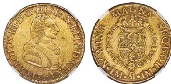
32073 Charles III gold 8 Escudos 1761 LM-JM XF45 NGC , Lima mint, KM68. Original toning with luster in the legends, light surface marks on the obverse. The very scarce first bust type for Charles III. Ex. Benito Collection Reserve: $3,600