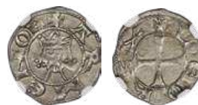
31014 Cilician Armeria. Levon I (1198-1219) Denier ND (c. 1208) XF Details (Environmental Damage) NGC, Sis mint, CCS-134, Bed-12. 0.86gm. + ARMENOR, crowned head facing / +LEO REX, cross pattée. An extremely rare Armenian issue, of a particular type supposedly absent from the auction record for two decades. Clearly struck in concordance with the Antiochene rather than the Armenian standard, it has been supposed that this type was produced by Levon in anticipation of his capture of Antioch, at which he had nearly succeeded in 1203. Very bold and precise for this series, with a strong portrait of Levon and only mild ghosting of the reverse cross; surfaces of a uniform matte gunmetal color with evidence of lightly altered surfaces, yet still bearing sharp die-polish lines. Starting Bid: $750