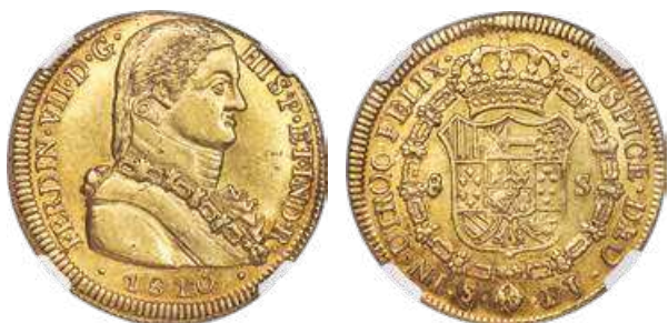
31274 Ferdinand VII gold 8 Escudos 1810 So-FJ AU55 NGC , Santiago mint, KM72. Inverted mintmark. Bright luster underlying a light honey-gold chroma with hints of rose-gold developing along the peripheries. Starting Bid: $750