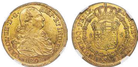
31319 Charles IV gold 8 Escudos 1808 P-JF MS61 NGC, Popayan mint, KM66.2. With legend "CAROL IIII." Boldly struck, the surfaces exhibiting significant golden luster and hints of rose-gold tone. Starting Bid: $750