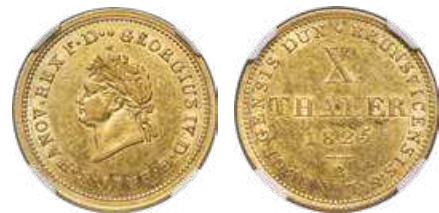
31501 Hannover. George IV of England gold 10 Taler 1825-B AU53 NGC, Hannover mint, KM133. A delightful Anglo-German type, well-preserved with abundant lemon-gold luster and a clearly bold strike. Light wear has changed the tone of the highpoints somewhat, but this minor evidence of circulation has not obscured significant detail nor impacted the strong eye appeal. Starting Bid: $500