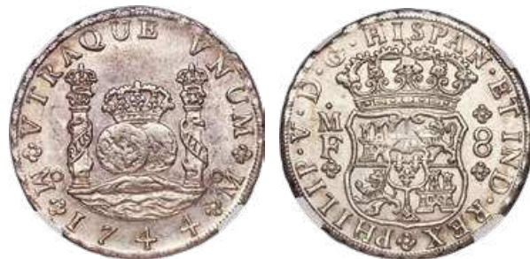
31928 Philip V 8 Reales 1744 Mo-MF MS62 NGC , Mexico City mint, KM103. An unusually satiny specimen with a good strike and unmistakable, choice eye-appeal. Starting Bid: $750