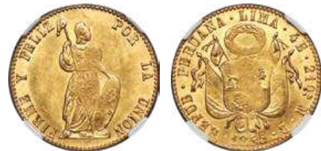
32080 Republic gold 4 Escudos 1855 LIMA-MB MS63+ NGC , Lima mint, KM150.4. Strong mint bloom and satiny luster define the surfaces of this handsome coin. Starting Bid: $750