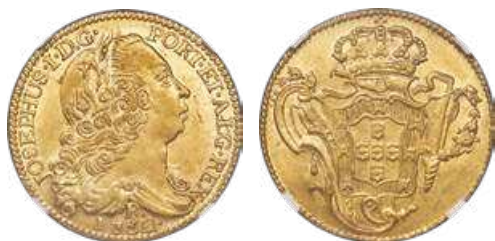
31090 Jose I gold 6400 Reis 1752-R AU55 NGC , Rio de Janeiro mint, KM172.2, LMB-420. Struck to an even depth with good centering and clear detail visible throughout both obverse and reverse. From the Santa Cruz Collection Starting Bid: $400