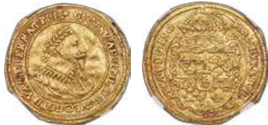
31498 Erfurt. Gustav II Adolph of Sweden gold Ducat 1632 AU50 NGC, KM54, Fr-923. Small bust type. Struck during the Swedish occupation of Erfurt. A very rare issue, the flan of which is a little wavy, lightly toned in the recesses. Starting Bid: $2,500