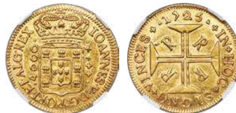
31070 João V gold 4000 Reis 1725-R AU58 NGC , Rio de Janeiro mint, KM102. A well-struck example with bold devices and mild luster emanating from the fields. From the Dresden Collection Starting Bid: $750