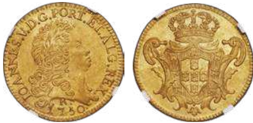
31076 João V gold 6400 Reis 1750-R UNC Details (Saltwater Damage) NGC , Rio de Janeiro mint, KM149, LMB-225. An appealing selection exhibiting a full strike and no wear, with a clear matte appearance where the surfaces' luster was muted by saltwater over time. We note a small scratch to the right of the King's bust, though this proves inconsequential to the eye appeal of this exciting satiny offering. From the patina on the coin we believe this selection may have been recovered from the Clive of India shipwreck. Starting Bid: $700