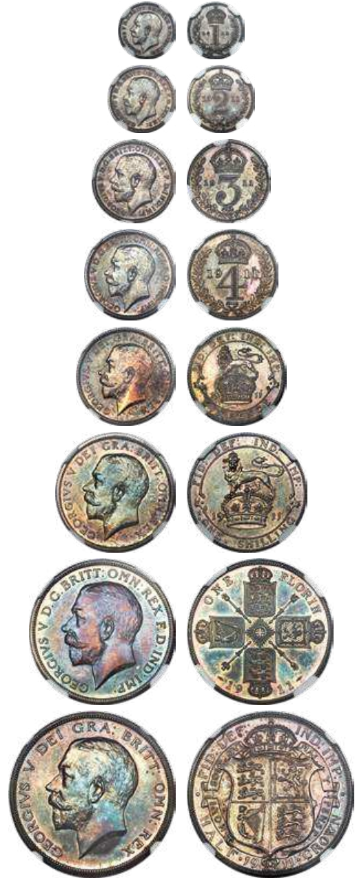
31701 George V 8-Piece Certified silver Proof Set 1911 NGC,