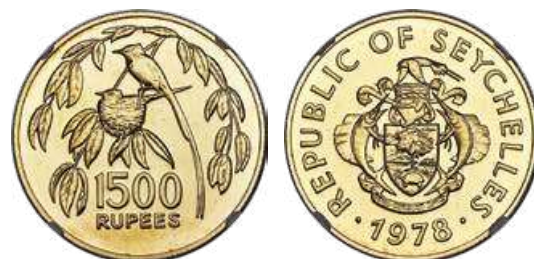
32199 Republic gold 1500 Rupees 1978 MS67 NGC, KM41. A gem strike with virtually perfect watery golden surfaces. AGW 0.9675 oz. Starting Bid: $600