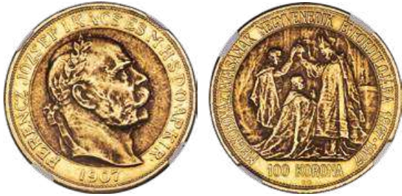
31759 Franz Joseph I gold 100 Korona 1907-KB AU58 NGC , Kremnitz mint, KM490. An attractive commemorative struck for the anniversary of Franz Joseph's coronation, the dual finish featuring a reflective outer edge set against matte centers. Lightly toned with minimal wear. Starting Bid: $1,000