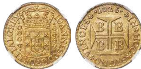
31071 João V gold 4000 Reis 1726-B AU58 NGC , Bahia mint, KM106, LMB-72. Precisely struck, with an as-minted texturing in the fields that leaves the recessed areas with a satiny sheen. From the Santa Cruz Collection Starting Bid: $450