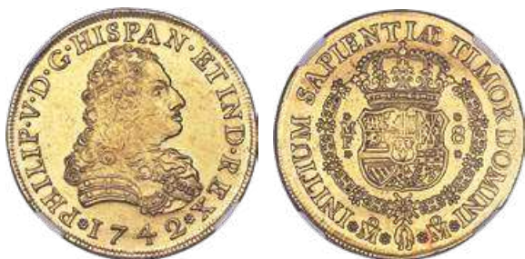
31940 Philip V gold 8 Escudos 1742 Mo-MF AU Details (Reverse Cleaned) NGC, Mexico City mint, KM148, Fr-8. Bright golden mint luster with slight softness in the center of the obverse. Minor hairlines and a few slight contact marks. We feel that minor hairlines do not always denote that a coin has been cleaned. The overall appearance is quite pleasing. Reserve: $4,000