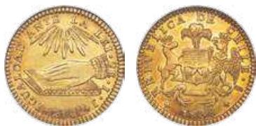
31282 Republic gold 2 Escudos 1838 So-IJ AU58 NGC , Santiago mint, KM97. Strong mint luster and an attractive old apricot toning. A handsome example of this scarce two-year type. Starting Bid: $600