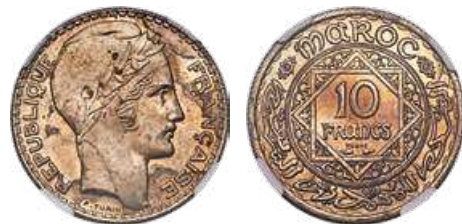
32011 French Protectorate copper-nickel Essai 10 Francs ND (AH 1346 / 1927) MS63 NGC , KM-E14 (in nickel), Lec-248 (same; Very Rare). Obv. Laureate head right. Rev. Value in doubled square within circle. The strike is bold and the surfaces display full mint luster. Some light spots (similar to water spots) are visible on the obverse and a few small marks are noted. Starting Bid: $400