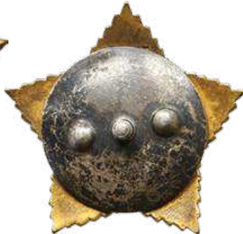
32183 USSR gold & silver Order of Alexander Suvorov Second Class Breast Star ND (Instituted 1942) XF , Barac-1004, M&S-pg. 90 (R4). Type 2, Screwback. Awarded to commanders of corps, divisions, and brigades, their deputies and chiefs of staff. Obv. A five-pointed, rayed, star made of gold, with a silver medallion in the center with a portrait of Alexander Suvorov facing left. The Russian words for Alexander Suvorov circle the portrait. Rev. The hole in the center of the reverse has three spokes of gold connecting at the center with a silver screwpost. The mintmark "Monetny Dvor" is stamped at the top of the star. Engraved #962 on reverse. Starting Bid: $2,250