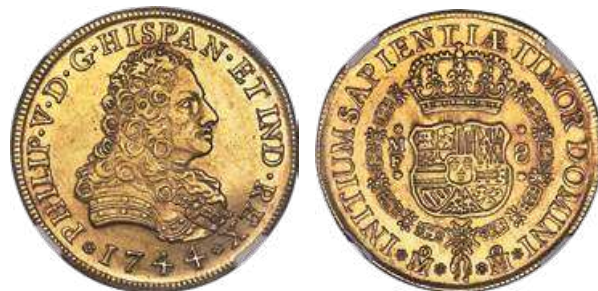
31942 Philip V gold 8 Escudos 1744 Mo-MF AU Details (Cleaned) NGC, Mexico City mint, KM148, Fr-8. Lustrous surfaces with a nice strike. Light hairlines are noted with only minor imperfections. Reserve: $3,600