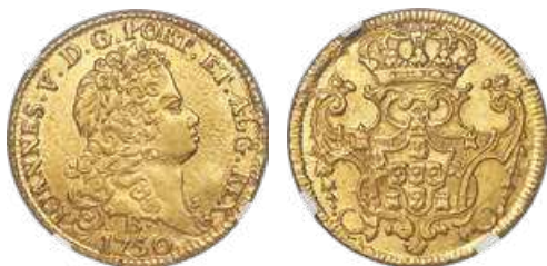
31077 João V gold 6400 Reis 1750-B AU58 NGC , Bahia mint, KM151. The coin exhibits very light circulation wear on the high points, a strong, well-defined strike with mellow saffron luster and sun-gold surfaces. From the Dresden Collection Starting Bid: $1,250