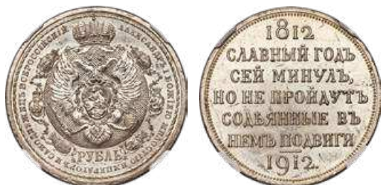
32166 Nicholas II “War of 1812” Rouble 1912-ЭБ MS62 NGC, St. Petersburg mint. KM-Y68, Bit-334. Full, bright, mint luster with a touch of golden patina. Well struck on the occasion of the centennial of Napoleon’s defeat during his failed invasion of Russia in 1812. Starting Bid: $750