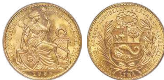
32089 Republic gold 100 Soles 1955 MS64 PCGS , Lima mint, KM231. A near-gem example with a lively whirlpool luster and a deeply aurous cast of magnificent intensity. The details are crisply struck, having razor sharp edges, which on the whole lends an adventurous atmosphere to the artistic designs. Starting Bid: $750