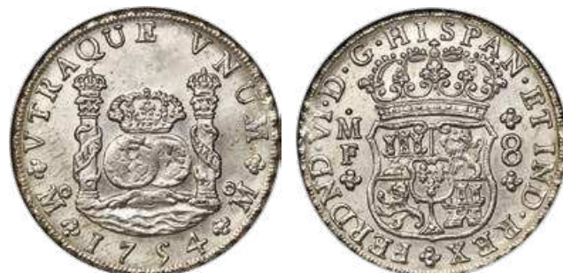
31945 Ferdinand VI 8 Reales 1754 Mo-MF MS63 NGC , Mexico City mint, KM104.1. Silken surfaces serve as a potent backdrop for the bold devices in this wholly choice offering, which reveals not only exceedingly little handling but an enticing wintry appearance. Tied for second-highest certified by NGC. Starting Bid: $1,000