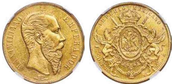
31990 Maximilian gold 20 Pesos 1866-Mo AU58 NGC , Mexico City mint, KM389. A strong example with vibrant luster and a bold, attractive strike. Nearly uncirculated with just the tiniest bit of circulation wear evident and a few but minimal contact marks. Starting Bid: $1,250