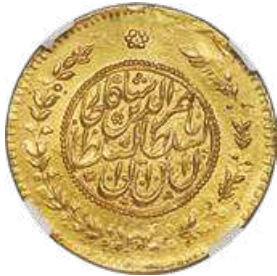
31832 Qajar. Nasir al-Din Shah gold Medallic 10 Toman AH 1209 (Error for AH 1290 / 1873/4) AU Details (Mount Removed) NGC, No mint, KMX-MV17, Fr-Unl., A-Unl., ICV-Unl., Poole-Unl. 36mm. 26.79gm. An intriguing and absolutely gorgeous presentation issue, listed by the Standard Catalog of World Coins "Unusual" volume as a non-denominated Medal of Valor, which is nonetheless noted to have often circulated alongside regular coinage. A true testament to the beauty and elegance of Qajar metal-work and engraving, containing all of the trademarks so appealing from the numismatic series, on a distinctively milled planchet. Only the second example to come to auction in the last 20 years, and likely among the finest, with light friction confined to only the highest portions of the design. Starting Bid: $4,000