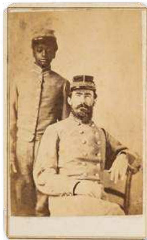
Carte de Visite of a Confederate Captain with a Slave in Uniform standing behind him.