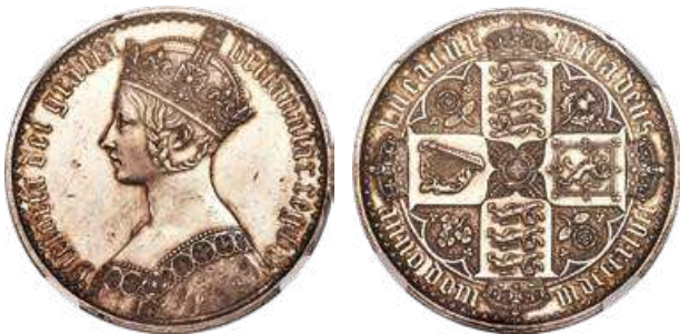
31674 Victoria Proof "Gothic" Crown 1847 PR Details (Reverse Rim Damage) NGC, KM744, S-3883, ESC-2577. Plain edge. The far rarer of the two 1847 Gothic Crown types, its edge plain and its fabric pure silver. It has seen some handling; the rim bears a few dents (the most notable at 7 o'clock on the reverse which has led to its details designation), the surfaces with hairlines and contact marks. Besides these attributes, however, the piece is starkly attractive and its engraving heralded as perhaps the most beautiful on any British Crown. The centers are a faintly lustrous argent, toned to a deeper gold at the peripheries, every detail sharp and fully defined. For the collector concerned with obtaining an example of the rare plain edge Gothic Crown at a reasonable price, this may be your chance. Starting Bid: $750