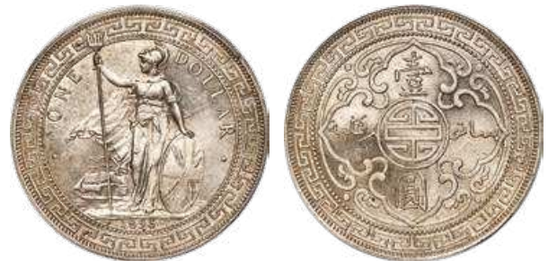
31690 Victoria Trade Dollar 1895-B MS63+ PCGS, Bombay mint, KM-T5, Prid-2. Rendered in appealing sharp relief, an ever-popular type with abundant silky luster across the planchet and only light contact marks in line with its choice plus grade. Starting Bid: $750