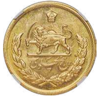
31833 Muhammad Reza Pahlavi gold 5 Pahlavi MS 2536 (1977) MS66 NGC, KM1202, Fr-99. A resplendent gem showing almost none of the weakness frequently seen over the lion's torso. Given the stellar preservation and sharp strike, a standout example of the type, one that ties for second-highest seen by NGC to-date. Starting Bid: $700