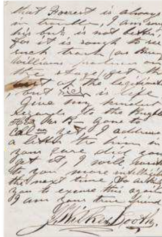
John Wilkes Booth Autograph Letter Signed with transmittal envelope.