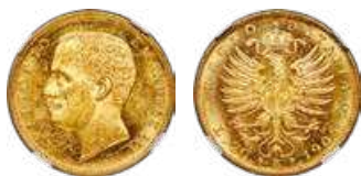
31900 Vittorio Emanuele III gold 20 Lire 1905-R MS62 NGC, Rome mint, KM37.1, Fr-24. A Mint State coin with prooflike surfaces and a strong golden chroma. Although there are quite a few friction marks, they are generally unobtrusive and do not significantly detract from the coin's overall eye appeal. Starting Bid: $400