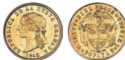
31326 Nueva Granada gold 10 Pesos 1858-POPAYAN MS61 NGC , Popayan mint, KM122.2, Fr-86. A nice clean strike without significant surface abrasions normally seen on lower Mint State grade specimens. Solid luster and a light rose-gold tone developing. Starting Bid: $500