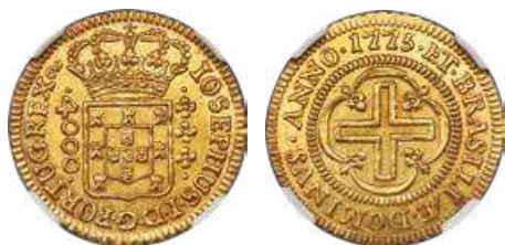
31089 Jose I gold "Large Crown - IOSEPHUS" 4000 Reis 1775-(L) MS62 NGC , Lisbon mint, KM171.1, LMB-298. Seemingly struck with lightly rusted dies, creating a micro-texturing in the fields that proves attractive when considered alongside the bright luster and scattered reddish tones that enhance the legends of this near-choice selection. From the Santa Cruz Collection Starting Bid: $400