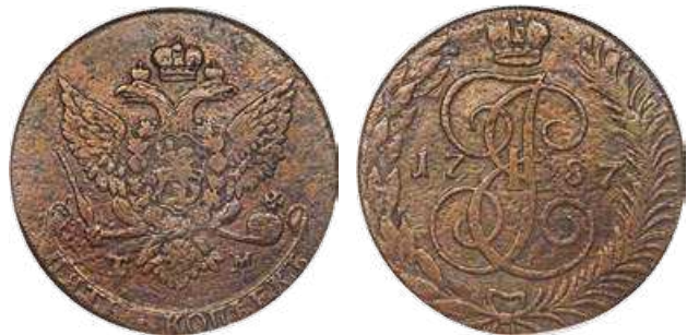
32125 Catherine II 5 Kopecks 1787-TM XF Details (Tooled) PCGS , Tauric mint, KM-C59.4, Bit-855 (R3), Petrov 40 Roubles. Reticulated edge. A bit weakly struck with the noted tooling remaining clear, though even with these imperfections this remains a quite rare type, with 5 Kopecks from this mint seldom offered in any condition. Starting Bid: $500