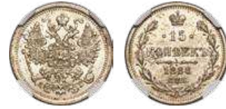
32154 Alexander III 15 Kopecks 1888 СПб-АГ MS63 NGC, St. Petersburg mint, KM-Y21a.2, Bit-121 (R). Obv. Crowned Imperial eagle with orb and scepter. Rev. Crowned date and value within wreath. Light gold and russet patina over fully lustrous surfaces. The strike is bold and only a very few light marks are noted. A rare issue in Mint State. Starting Bid: $400