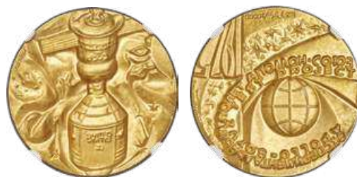
32187 USSR gold "Apollo-Soyuz" 1 Ounce Medal 1975 MS69 NGC, KM-Unl. 32mm. No. 03754/10000. By I. Postol. Plain edge. A silky and virtually flawless example of the type, struck to commemorate the Apollo-Soyuz test project between the United States and Soviet Union. The medal displays both English and Cyrillic text, as well as boldly-defined, raised design motifs. Though NGC does not provide records for the type, we know of no example that has certified finer to-date. Sold with case of issue. Starting Bid: $750