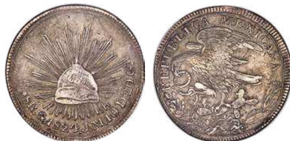
31972 Republic "Hookneck" 8 Reales 1824 Go-JM XF45 NGC, Guanajuato mint, KM-A376.1. Medal Axis. A charming example of this iconic "hookneck" eagle type displaying comparatively light and even wear over dolphin-gray fields with just a tinge of russet color. For reference, we sold another XF45 example for $1527 in our April 2016 Chicago sale. Starting Bid: $400