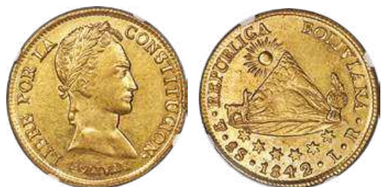
31051 Republic gold 8 Scudos 1842 PTS-LR MS61 NGC , Potosi mint, KM108.2. Tied for second highest certified by either NGC or PCGS, this outstanding Mint State offering has still been conservatively graded; besides some light hairlines and mild striking softness to centers, its quality is excellent and appears near choice. The rich lemon-gold planchet has been boldly impressed resulting in razor-sharp detail, the planchet abundantly lustrous and eye-catching, every aspect impressive for the type. Starting Bid: $1,500