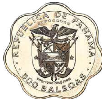
32055 Republic gold "Owl Butterfly" 500 Balboas 1983-FM MS67 NGC , Franklin mint, KM96. Struck in 12 karat gold on a scalloped planchet. The scarcer MS version of this large type, more commonly encountered in Proof. Near perfect, exhibiting considerable brightness. AGW 0.5977 oz. Reserve: $2,000