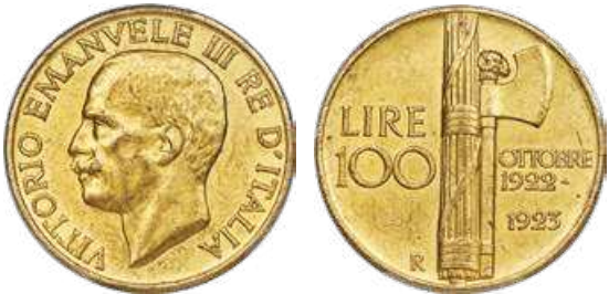
31907 Vittorio Emanuele III gold 100 Lire 1923-R MS61 Matte PCGS, Rome mint, KM65. A one-year type, introduced to commemorate the first anniversary of the Fascist Regime in Italy. Well-expressed detailing throughout, with soft, satiny surfaces. Starting Bid: $750