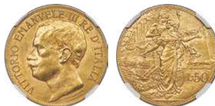
31904 Vittorio Emanuele III gold "Kingdom Anniversary" 50 Lire 1911-R MS61 NGC, Rome mint, KM54, Fr-25. This handsome one-year type displays light toning over considerable mint luster. Only 2,000 pieces of this interesting allegorical type were struck. Starting Bid: $400