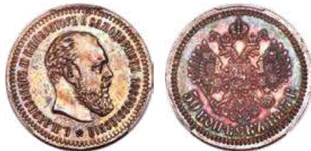
32156 Alexander III 50 Kopecks 1887-АГ AU58 PCGS, St. Petersburg mint, KM-Y45, Bit-80 (R). Mottled blue, gold, and gray toning over deeply mirrored fields. The strike is sharp with only the slightest hint of rubbing on the high points. Close inspection is needed as this example has characteristics of a Proof striking. Starting Bid: $500