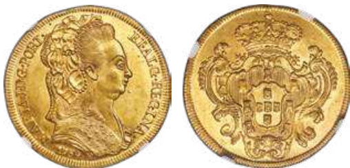
31103 Maria I gold 6400 Reis 1789-R MS64 NGC , Rio de Janeiro mint, KM226.1, LMB-527. Bejeweled headdress type. Visually and technically unrivaled for the type, the well struck-up designs bordered by sharp rims containing surfaces of an exceptionally lustrous character. Currently unchallenged at the near-gem level, with no examples across either PCGS or NGC certifying above MS64. From the Santa Cruz Collection Starting Bid: $750