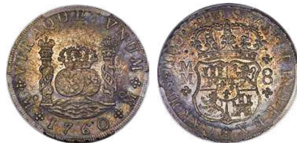
31952 Charles III 8 Reales 1760 Mo-MM MS62 PCGS , Mexico City mint, KM105, Cal-884. An inspiring representative offering overlapping metallic tones throughout fields demonstrating unmistakable glassy luster. The overall result is an impression of immense eye appeal and originality. Starting Bid: $750