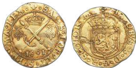
32197 James VI (I) gold Sword & Scepter 1601 XF (Altered Surfaces), Edinburgh mint, Eighth coinage, KM20, S-5460. Crowned arms / Crossed sword and scepter dividing thistles, with crown above and date below. A well-struck example exhibiting light wear and rose-gold toning around the legends and devices. Starting Bid: $500