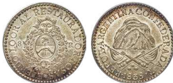
31012 La Rioja. Provincial 8 Reales 1838-R MS60 PCGS, La Rioja mint, KM8. Sparkling luster underlies light toning, noted especially along the upper border area. A handsome example of this type that is rarely offered with a Mint State designation. Starting Bid: $500