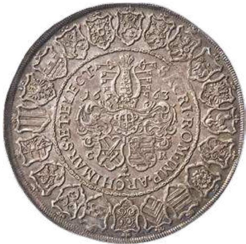
31532 Saxony. Johann Georg II 2 Taler 1663-CR AU53 NGC, KM504, Dav-LS404. 58.24 gm. An impressive large-size Double Taler produced to an exceptionally high standard and toned to a smoky steel-gray. The planchet shows some evidence of irregularity pre-striking, leaving an uneven surface in the obverse fields; however this only texturizes the empty space and splits the residual luster into appealing facets. Despite its grade, this piece is nearly as-made with slight highpoint flatness diagnostic of striking weakness as opposed to wear. Commanding incredible eye appeal, a piece worthy of in-hand inspection for a true appreciation of its quality. Starting Bid: $750