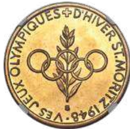
32320 Confederation gold “5th Winter Olympics - St. Moritz” Medal 1948-B MS65 NGC, Bern mint, KM-Unl. 33mm. 27gm. By E. Wiederkehr. Obv. Male kneeling right holding torch. Rev. Olympic rings, olive branch behind. A sharply-defined example displaying bright, unimpeded golden luster. Sold with case of issue. From the Allen Moretti Swiss Collection Starting Bid: $550