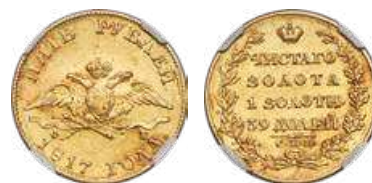
32129 Alexander I gold 5 Roubles 1817 СПБ-ФГ AU50 NGC , St. Petersburg mint, KM-C132, Bit-18. Obv. Crowned double-headed eagle with wings down and date and value in the legend. Rev. Crowned four-line inscription in wreath. Faint traces of mint luster with noticeable rubbing on the high points. Light contact marks are noted for the sake of completeness only. Starting Bid: $500