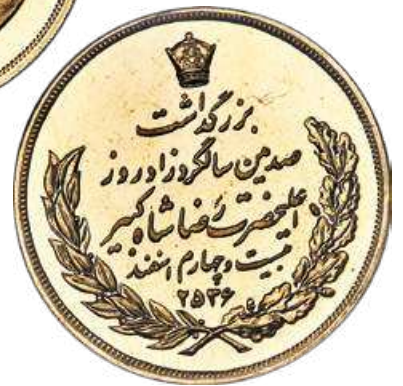
31834 Muhammad Reza Pahlavi gold 10 Pahlavi MS 2536 (1977) MS66 NGC, KM1212. Struck to commemorate the 100th anniversary of the birth of Reza Shah, this immense gold issue features the conjoined busts of the Shah and his father. Glossy, somewhat prooflike surfaces of lemon-gold color absolutely saturated in mint luster, a lofty premium gem. AGW 2.3541 oz. Starting Bid: $1,500