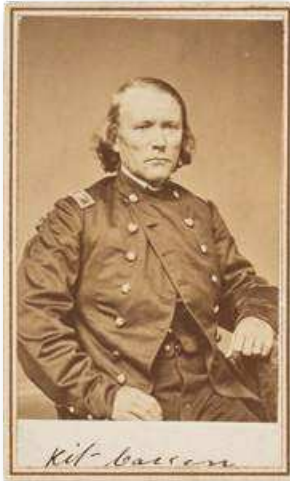
Christopher "Kit" Carson Signed Carte de Visite. In excellent condition.