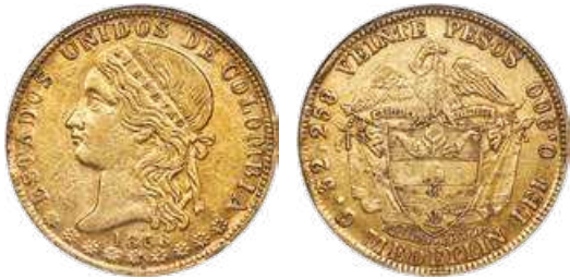
31329 Estados Unidos gold 20 Pesos 1868-MEDELLIN AU50 NGC , Medellin mint, KM142.2. An example demonstrating well defined details and scattered light friction marks as is typically seen on this type. Starting Bid: $500