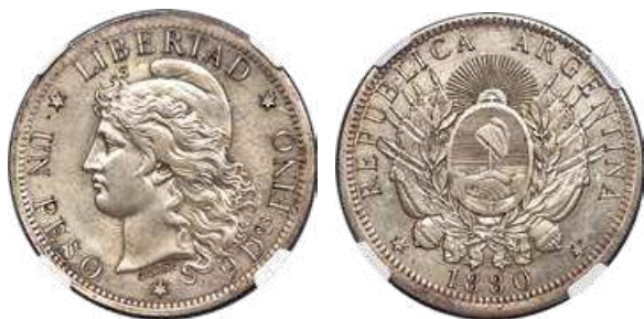
31010 Republic silver Unofficial Restrike Pattern Peso 1880 MS63 NGC, KM-Pn20, Janson-31. A rich silver patina dresses the surfaces of this Pattern issue, creating a glossy appeal that proves quite attractive in hand. Starting Bid: $350