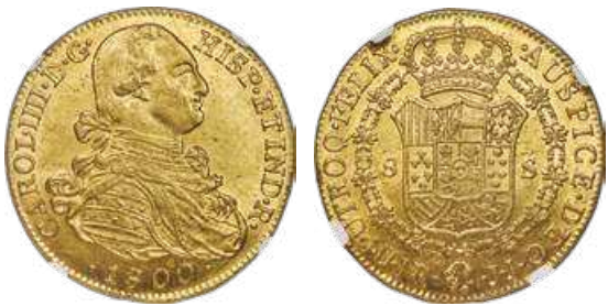
31316 Charles IV gold 8 Escudos 1800/799 NR-JJ MS62+ NGC, Nuevo Reino mint, KM62.1. Shimmering luster and an excellent strike define this scarce and attractive overdate. Highly desirable. Starting Bid: $900