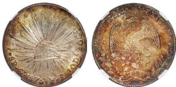
31991 Republic 8 Reales 1875/6 Go-FR MS66 NGC , Guanajuato mint, KM377.8, DP-Go55. A spectacular gem with unbeatable color across both sides, showing vibrant, copper-peach tone at the centers and flares of cerulean at the peripheries. Lightly reflective, with near-pristine fields and a strong overdate to boot. Starting Bid: $600