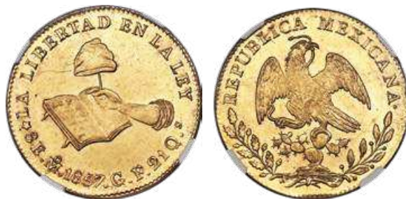
31981 Republic gold 8 Escudos 1857 Mo-GF UNC Details (Obverse Scratched) NGC , Mexico City mint, KM383.9. Rarely encountered at the uncirculated level, nearly entirely free of the type’s chronic central softness of strike, and watery to the extreme. Starting Bid: $500