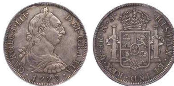
31953 Charles III 8 Reales 1772 Mo-FM AU53 PCGS , Mexico City mint, KM106.1. A nicely toned example that is lustrous and well struck, and with the assayer's initials inverted. Starting Bid: $500