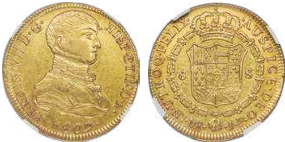
32077 Ferdinand VII gold 8 Escudos 1809 LM-JP AU53 NGC , Lima mint, KM107. An imaginary bust type for Ferdinand VII, struck at Lima between 1808 and 1811 before proper dies with the king's effigy had been received. Remarkably clean surfaces with a bright, underlying golden luster and tangerine tones along the edges. Starting Bid: $750