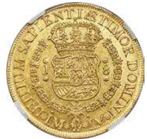
32067 Ferdinand VI gold 8 Escudos 1752 LM-J AU58 NGC , Lima mint, KM50. Luster emanates from the fields of this bright example with a lemon-gold aura, the devices strong and sharp, absolutely deserving of the assigned grade designation. A truly handsome piece with a very appealing finish and strike. Reserve: $4,500