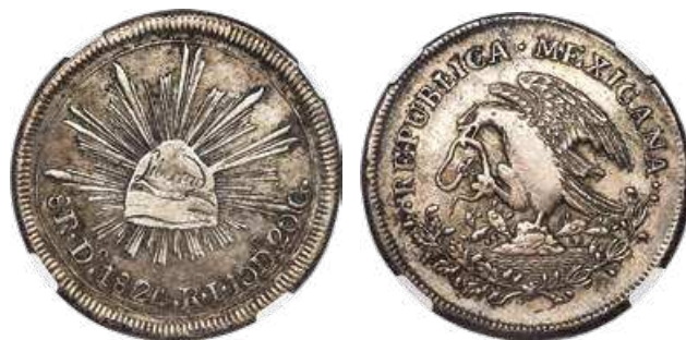
31973 Republic "Hookneck" 8 Reales 1824 Do-RL XF40 NGC, Durango mint, KM376.1. Defiant snake variety. Wear on the high points with considerable amounts of Libertad present. A very scarce issue. Starting Bid: $400