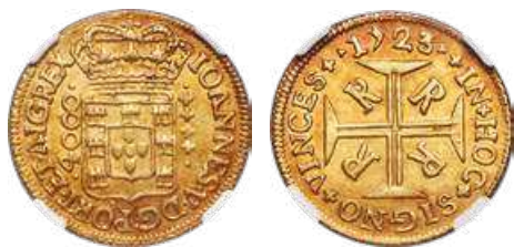
31067 João V gold 4000 Reis 1723-R AU58 NGC , Rio de Janeiro mint, KM102. A wonderfully toned example with deep tinges of rose throughout the protected areas and especially along the peripheries, boldly struck with just a touch of wear on the highpoints. A choice and attractive coin. From the Dresden Collection Starting Bid: $750