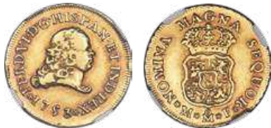
31947 Ferdinand VI gold 2 Escudos 1753 Mo-MF VF35 NGC , Mexico City mint, KM126.2, Cal-163, Fr-10. Quite attractive for the grade with decent detail remaining throughout and no distracting flaws worthy of mention. An affordable and wholesome representative of this rare issue, with this and the ex-Eliasberg example being the sole specimens currently listed in the census of NGC. Ex. Rudman Collection Starting Bid: $600