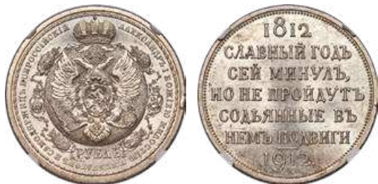
32165 Nicholas II “War of 1812” Rouble 1912-ЭБ MS63 NGC, St. Petersburg mint, KM-Y68, Bit-334. Obv. Crowned arms and value. Rev. Five-line inscription with date 1812-1912. Brilliant white, with a slight hint of golden patina. The strike is strong and a few light marks define the grade. Starting Bid: $1,250