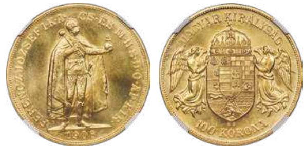
31763 Franz Joseph I gold Restrike 100 Korona 1908-KB MS66 NGC , Kremnitz mint, KM491. A lovely example with a vibrant luster and warm, glassy surfaces. AGW 0.9802 oz. Starting Bid: $600