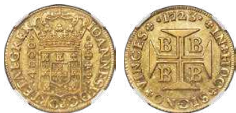
31068 João V gold 4000 Reis 1723-B AU58 NGC , Bahia mint, KM106, LMB-69. A specimen on the absolute cusp of uncirculated condition, revealing significant mint brilliance within the protected areas and devices virtually unaffected by wear. From the Santa Cruz Collection Starting Bid: $500