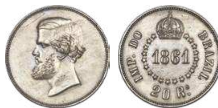
31115 Pedro II plated copper Pattern 20 Reis 1861 UNC (cleaned) , KM-Pn90var (in copper), LMB-048Avar (same). 27.5mm. 9.82gm. A fully detailed, uncirculated example of this elusive Pattern issue, rarely seen on the market. We have encountered no other plated specimens such as this one, and we note that this specific variety is unlisted in the Standard Catalog of World Coins as well as in Bentes and Livro Das Moedas Do Brasil . From the Dresden Collection Starting Bid: $200