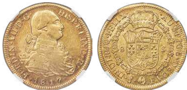
31278 Ferdinand VII gold 8 Escudos 1817/8 So-FJ AU53 NGC , Santiago mint, KM78. A handsome example with deep apricot peripheral toning and vibrant underlying luster. Starting Bid: $600