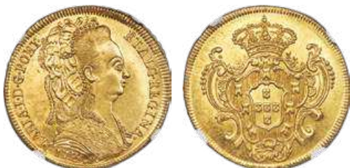
31104 Maria I gold 6400 Reis 1795-R MS63 NGC , Rio de Janeiro mint, KM226.1. A truly handsome piece with a nice, strong strike of Maria, bright mint luster, and some sparkling reflectivity in the protected areas. From the Dresden Collection Starting Bid: $600