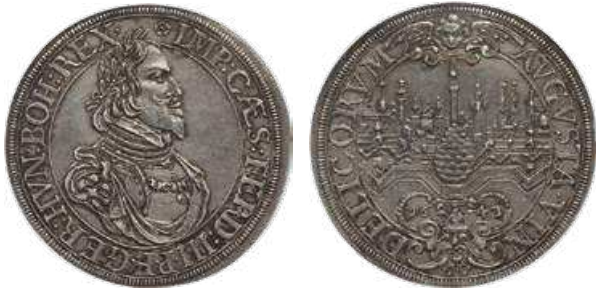
33826 Augsburg. Free City Taler 1643 MS62 NGC, KM77, Dav-5039. With the titles of Ferdinand III. Showcasing a slightly subdued slate-gray patina that appears brightened by soft luminosity when rotated in hand, charcoal highlights sharpening the legends and giving an overall strong visual allure. Starting Bid: $400