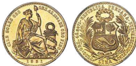
32088 Republic gold 100 Soles 1951 MS66 Prooflike NGC , Lima mint, KM231. Sparkling mint luster cascades along the highly reflective surfaces of this magnificent gem example, the devices of which exhibit a lightly matte appearance overlying an excellent, bold strike. Though the type is not particularly scarce, the condition is absolutely exceptional making this a "conditional rarity." Starting Bid: $1,250