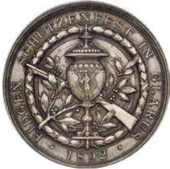
32319 Confederation silver Matte “Glarus Shooting Festival” Medal 1892 MS62 NGC, Richter-807c (RR). 45mm. By Franz Hornberg. Struck in a very low mintage of 50. A pleasing example of this scarce type struck in an ultra-high-relief matte finish, lagoon blue tone displayed at the peripheries. Sold with case of issue. From the Allen Moretti Swiss Collection Starting Bid: $400