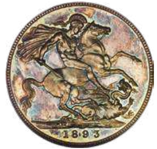
31676 Victoria Proof Crown 1893 PR65 Cameo PCGS, KM783, S-3937, ESC-2594. LVI edge. A blue gem, marked by shimmering glassy fields displaying contrasting pale gold tone in an even ring bordering the obverse rims, a notable degree of frost over the struck features resulting in a clear cameo contrast. Though we have seen higher grade examples, few can match the engaging appearance of this veritable jewel! Starting Bid: $2,500