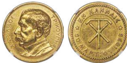
31741 Charilaos Trikoupis gold Medal 1896 AU Details (Cleaned) NGC, By Wyon. 32mm. 29.09gm. Commemorating the death in Cannes of former Prime Minister Charilaos Trikoupis. ΧΑΡΙΛΑΟΣ ΤΡΙΚΟΥΠΗΣ, bust of Charilaos Trikoupis left / EN ΚΑΝΝΑΙΣ 30 ΜΑΡΤΙΟΥ 1896, monogram. Light handling marks but strong luster remaining. A common medal in bronze, rare in gold and silver. Starting Bid: $500