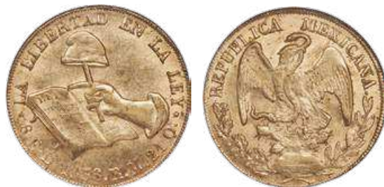
31979 Republic gold 8 Escudos 1838/6 Do-RM MS62 NGC , Durango mint, KM383.3. A bold piece exhibiting vibrant luster in the fields and a pleasing sun-gold patina, as well as a clear overdate. Starting Bid: $750