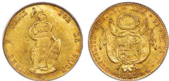
32082 Republic gold 8 Escudos 1853 LIMA-MB AU55 PCGS , Lima mint, KM148.4. Abundant rose blush along the peripheries and around the devices highlight the designs. We note a small lamination flaw on the edge of the reverse between 1 and 2 o'clock. Starting Bid: $400