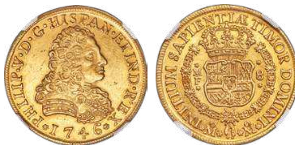
31943 Philip V gold 8 Escudos 1746 Mo-MF AU58 NGC , Mexico City mint, KM148, Fr-8. An attractive near-mint example, with bright golden mint luster and barely noticeable softness in Philip's hair. Pleasing eye-appeal, with only minuscule marks. Reserve: $3,500