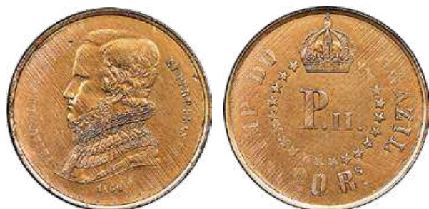
33417 Pedro II nickel-bronze Pattern 20 Reis 1860 MS62 NGC , KM-Pn88, Bentes-E47.02 (listed in copper). A rare Pattern with a bust of Pedro II, similar to the portrait used on the issued gold 10000 and 20000 Reis. Champagne-toned and displaying prominent flan striations, as made. From the Dresden Collection Starting Bid: $200