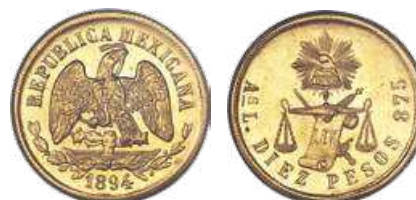
31997 Republic gold 10 Pesos 1894 As-L MS62 PCGS , Alamos mint, KM413. Highly lustrous and displaying detail struck to alluring sharpness, this Mint State representative enjoys the distinction of being the only example of the date and mint certified by PCGS to-date. Starting Bid: $600