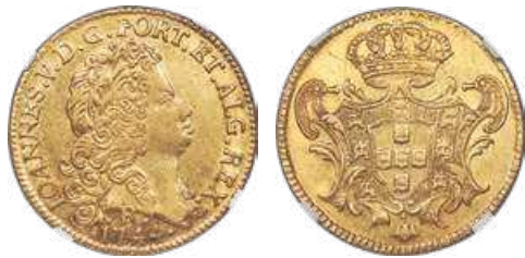
31075 João V gold 6400 Reis 1744-R AU53 NGC , Rio de Janeiro mint, KM149. A lightly circulated example with subdued lemon-gold chroma over satiny luster. From the Dresden Collection Starting Bid: $500