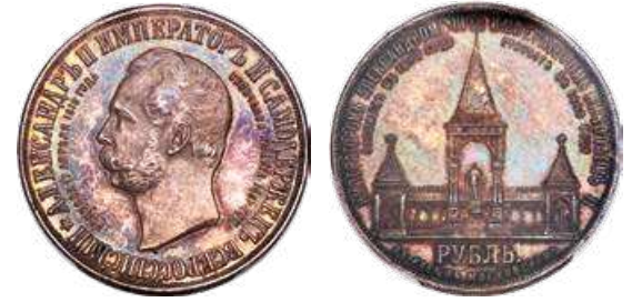
32163 Nicholas II “Alexander II Memorial” Rouble 1898-AFMS62 PCGS, St. Petersburg mint, KM-Y61, Bit-323 (R). Mintage: 5,000. Obv. Head of Alexander II left. Rev. The Alexander II Memorial, with value below. The fields are deeply prooflike, with nicely defined details. Blue, gold, and gray toning graces both sides, with minor marks. Starting Bid: $1,500