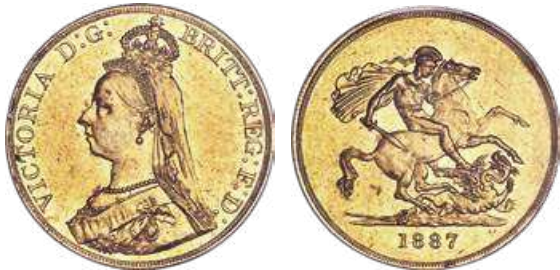
31687 Victoria gold 5 Pounds 1887 AU55 PCGS, KM769, S-3864. Well-struck and only lightly circulated, the first of just two currency 5 Pound types issued during Victoria's long reign. Starting Bid: $600