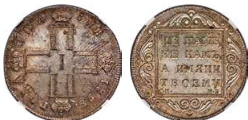
32127 Paul I Poltina (1/2 Rouble) 1798 CM-МБ MS63 NGC , St. Petersburg mint, KM-C99.1a, Bit-48. Obv. Cruciform crowned Imperial monogram with the date. Rev. Four-line legend in garished tablet. Shimmering, brilliant mint luster, with a touch of light russet patina. The strike is sharp and the surfaces display only a few light contact marks. Rare in this choice condition. Ex. Soedermann Collection Starting Bid: $1,750