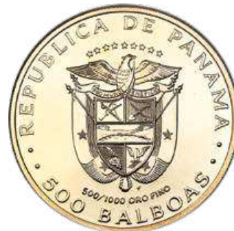
32054 Republic gold "Sailfish" 500 Balboas 1981-FM MS68 Deep Prooflike NGC , Franklin mint, KM75. Sailfish design. Mintage: 41 pieces. A "Special Uncirculated" strike with watery reflectivity and nearly unsurpassable golden surfaces. AGW 0.5977 oz. Reserve: $2,000