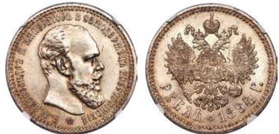
32157 Alexander III Rouble 1894-АГ MS63 NGC, St. Petersburg mint, KM-Y46, Bit-78. Both sides are fully lustrous, with the obverse displaying a touch of golden patina and the reverse a bright white luster. The surfaces show minor marks with superb eye-appeal. Starting Bid: $500