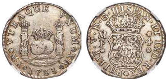
31925 Philip V 4 Reales 1733 MX-MF VF Details (Cleaned) NGC , Mexico City mint, KM94. An early milled type offering a clear and bold strike with medium gray fields and and light toning beginning to set in. Starting Bid: $500