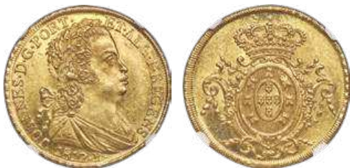
31113 João Prince Regent gold 6400 Reis 1812/1-R MS63+ NGC , Rio de Janeiro mint, KM236.1. A sunny, bright luster radiates from the fields of this choice example, the color of which is an attractive lemon-gold From the Dresden Collection Starting Bid: $500