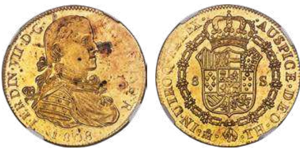
31963 Ferdinand VII gold 8 Escudos 1808 Mo-TH MS63 NGC , Mexico City mint, KM160, Fr-47. No apparent wear, with full orange-golden luster and reflective fields. The reverse is fully bright with no significant flaws, while the obverse has scattered staining and a few small spots. The legends for both obverse and reverse shows areas of soft strike. Scarce in this grade. Starting Bid: $1,500