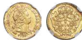
31056 João V gold 800 Reis 1729/7 AU Details (Bent) NGC , Minas Gerais mint, cf. KM120 (unlisted overdate), LMB-258var (same). Exhibiting somewhat of a matte finish, this seemingly unpublished overdate shows very minimal signs of handling for the grade, and the bend noted on the holder is at the very edge from 10 to 11 o'clock. From the Dresden Collection Starting Bid: $400