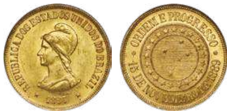
31140 Republic gold 20000 Reis 1897 MS62 NGC , Rio de Janeiro mint, KM497. The fields shimmer with golden mint luster. Starting Bid: $500