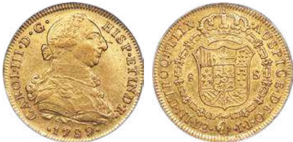
32075 Charles IV gold 8 Escudos 1789 LM-IJ XF45 PCGS , Lima mint, KM92. Enchanting luminosity and a lemon-gold chroma are especially notable on this pleasing example. The portrait of Charles is boldly struck and exhibits light, even wear, while the fields have a minimum of the expected surface marks. Starting Bid: $500