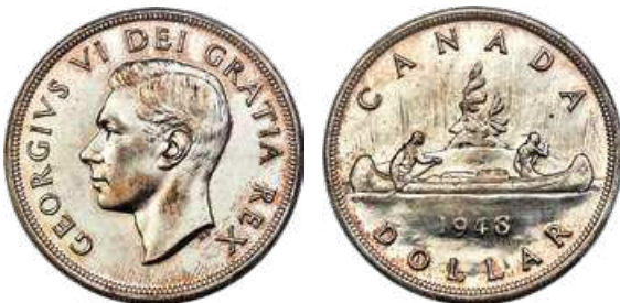
31197 George VI Dollar 1948 MS63 PCGS, Royal Canadian mint, KM46. A scarce key date example within the George VI series. Impressively preserved, displaying a fine argent patina dressed over the fields, light peach tone gracing the peripheries. Starting Bid: $750