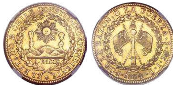
31285 Republic gold 8 Escudos 1834 So-IJ AU55 NGC , Santiago mint, KM84. An appealing example with light toning and considerable mint luster. Quite scarce in this pleasing quality. Ex. Caballero de las Yndias Starting Bid: $900