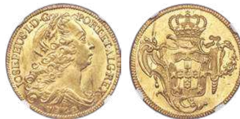
31092 Jose I gold 6400 Reis 1762-R MS61 NGC , Rio de Janeiro mint, KM172.2. A brightly lustrous coin with a handsome strike and attractive sunny-gold chroma. From the Dresden Collection Starting Bid: $750