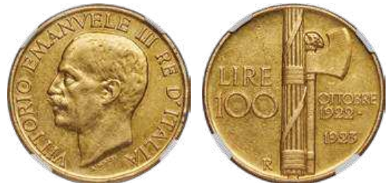
31910 Vittorio Emanuele III gold 100 Lire 1923-R AU Details (Mount Removed) NGC, Rome mint, KM65, Fr-32. An historically important one-year type exhibiting a bright gold patina enhanced by an attractive underlying luster. A highly collectible type. From the Allen Moretti Swiss Collection Starting Bid: $500