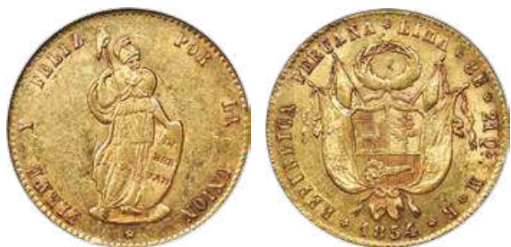
32083 Republic gold 8 Escudos 1854 LIMA-MB AU55 NGC , Lima mint, KM148.4. A lovely example having a sparkly golden luster, light apricot toning around the devices and legends, and a sunny-gold hue. We note for clarity a tiny lamination flaw on the right edge of the shield, but otherwise the coin lacks the flan flaws typically found on this issue. Starting Bid: $500