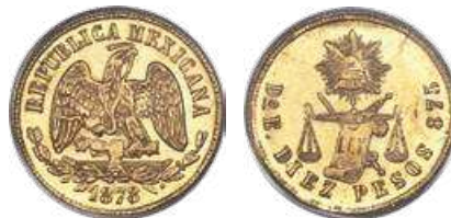
31996 Republic gold 10 Pesos 1878 Do-E AU58 PCGS , Durango mint, KM413.3. Mintage: 582. Reportedly the second rarest assayer for this mint, and the first example we have offered in the last decade, the present piece is positively beaming with mint radiance and fine die polish in the fields. Starting Bid: $400