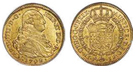
31311 Charles IV gold 4 Escudos 1792 P-JF AU50 PCGS , Popayan mint, KM61.2. A pleasing example with a handsome overall appeal, subdued luster and a hint of tone showing around the devices. Starting Bid: $500