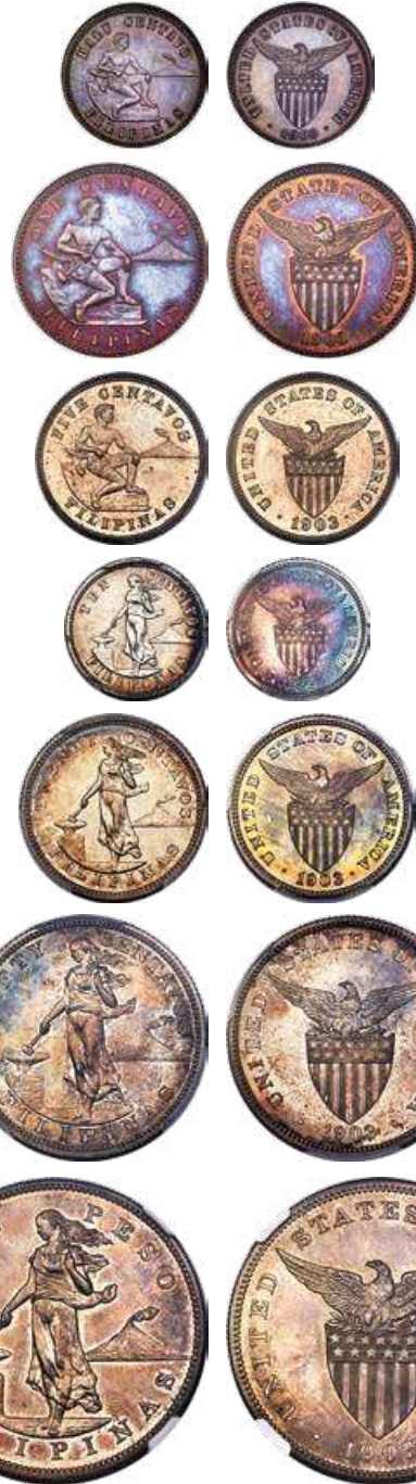
32106 USA Administration 7-Piece Certified Proof Set 1903 ,