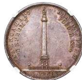
32139 Nicholas I “Alexander I Column Commemorative” Rouble 1834 AU53 NGC, St Petersburg mint, KM-C169, Bit-894 (R). Notably bold, with minor marks in-line with the designation, but an overall very pleasing appearance bolstered by even gray color. Starting Bid: $500