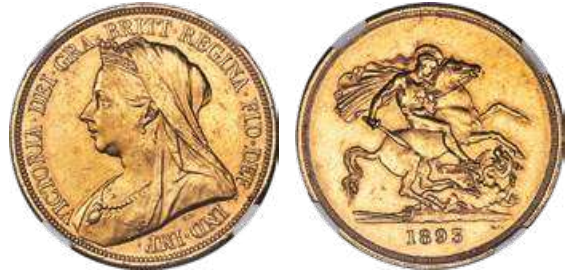
31688 Victoria gold 5 Pounds 1893 AU55 NGC, KM787, S-3872. Gently toned, with a subtle amber glow over both the obverse and reverse surfaces. Despite circulation a near-fullness of detail persists, leaving ample eye appeal for the assigned grade when considered alongside the relatively bright luster expressed in the fields. A highly collected, one-year issue that presents the older, veiled portrait of the Queen. Starting Bid: $1,000