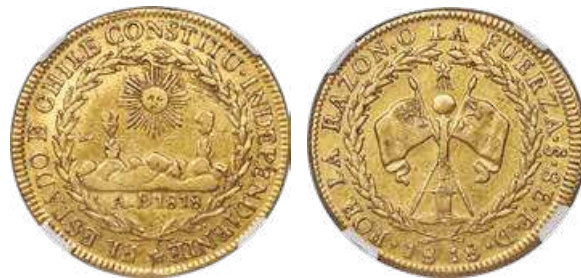
31284 Republic gold 8 Escudos 1818 So-FD XF45 NGC , Santiago mint, KM84, Fr-33. 'CONSTITU' variety. An ever-popular type coin, and the first date within the series. A small planchet flaw noted on the obverse to the right of the sun mention for accuracy. Starting Bid: $800