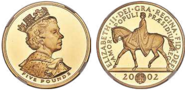
31729 Elizabeth II gold Proof "Golden Jubilee" 5 Pounds 2002 PR69 Ultra Cameo NGC, KM1024b. Mintage: 500. Commemorating Elizabeth's Golden Jubilee. AGW 1.1771 oz. From the George Hans Cook Collection Starting Bid: $750