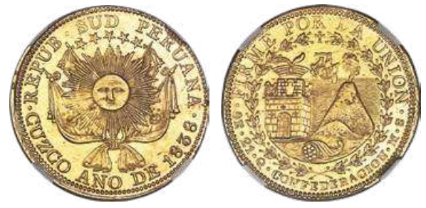
32093 South Peru. Republic gold 8 Escudos 1838 CUZCO-MS AU58 NGC , Cuzco mint, KM171. A lovely piece with a bold surface and excellent details. Bright luster emanates from the fields and the lemon-gold patina sparkles with underlying reflectivity. Starting Bid: $1,500