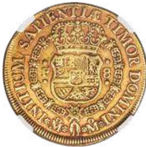
31937 Philip V gold 8 Escudos 1733 Mo-F XF45 NGC , Mexico City mint, KM148, Fr-8. Struck during the second year of the Mexico City mint's transition from hammered to milled coinage, and a rare emission. The strike is bold, with orange golden toning deepening around the legends. The overall appearance is superb and only tiny marks are noted. Reserve: $9,000