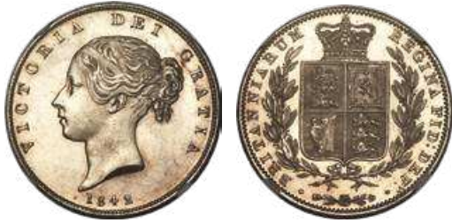
31670 Victoria 1/2 Crown 1842 MS65 NGC, KM740, S-3888. A blast white example displaying ample luster over glassy, opulent fields through which projects a boldly-rendered and frosty portrayal of a young Queen Victoria, the reverse struck to equally delightful quality and technical precision. An all-around elite gem, confirmed by the specimen's number one position in the NGC census. Ex. Law Collection Starting Bid: $1,000