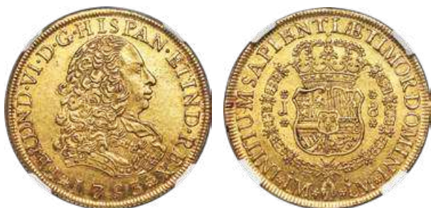
32069 Ferdinand VI gold 8 Escudos 1753 LM-J AU55 NGC , Lima mint, KM50, Fr-16. A handsome coin with a lemon-gold luster and very subdued toning throughout. The portrait of Ferdinand is exceptionally bold and pleasing, with only very light evidence of handling for the grade. Reserve: $3,300