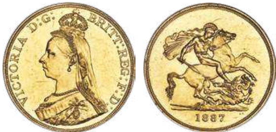
31685 Victoria gold 5 Pounds 1887 MS62 NGC, KM769, S-3864. Glossy reflectivity graces the obverse field of this large-size lemon-gold offering, its reverse exhibiting a more matte luster. Victoria's portrait has been splendidly rendered in admirable relief, minor contact marks to her cheek but nothing consequential. Intensely attractive for the grade, a charming 5 Pounds. Starting Bid: $1,000