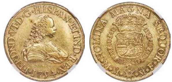
31948 Ferdinand VI gold 8 Escudos 1754 Mo-MF AU50 NGC , Mexico City mint, KM151, Onza-605. A bright and sunny example with a lemon-gold hue and much mint luster remaining, along with few of the contact marks one would expect for this grade. Overall quite a lovely piece. Starting Bid: $2,500