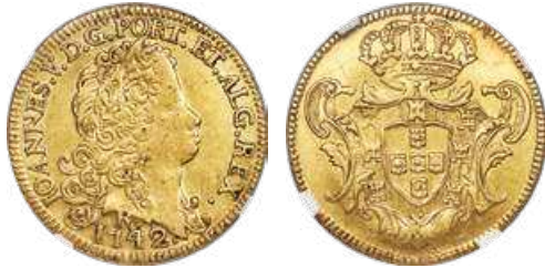
31074 João V gold 6400 Reis 1742-R AU Details (Test Cut) NGC , Rio de Janeiro mint, KM149. A collectible example with light, even wear on the highpoints and subdued luster remaining in the fields. From the Dresden Collection Starting Bid: $400