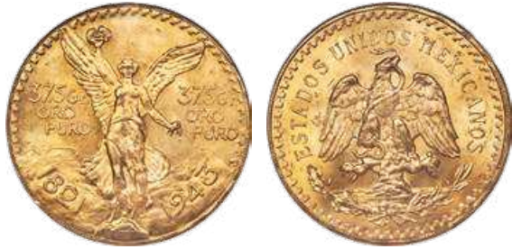
32005 Estados Unidos gold 50 Pesos 1943 MS66 NGC , Mexico City mint, KM482. AGW 1.2056 oz. Starting Bid: $700