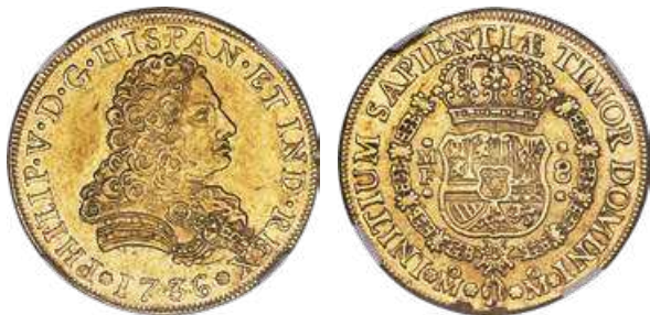
31939 Philip V gold 8 Escudos 1736 Mo-MF AU Details (Edge Damage) NGC, Mexico City mint, KM148. Fr-8. Abundant mint luster, with sharp details. There are two noticeable edge dings on the reverse edge between six and seven o'clock. Reserve: $4,000