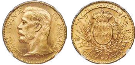
32009 Albert I gold 100 Francs 1904-A MS63 NGC , Paris mint, KM105. Satiny and fully choice, with only a light graze left of Albert's bust precluding an even higher grade designation. AGW 0.9334 oz. Starting Bid: $600