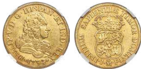
32231 Philip V gold 4 Escudos 1734 M-JF XF Details (Cleaned) NGC , Madrid mint, KM360. A lightly toned example of this rare issue, lightly cleaned but still with good eye-appeal and some luster remaining. Starting Bid: $750