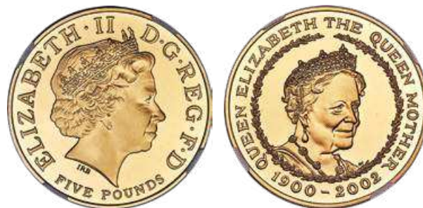
31727 Elizabeth II gold Proof “Queen Mother” 5 Pounds 2002 PR69 Ultra Cameo NGC, KM1035b. Struck in honor of the Queen mother. AGW 1.1771 oz. From the George Hans Cook Collection Starting Bid: $750