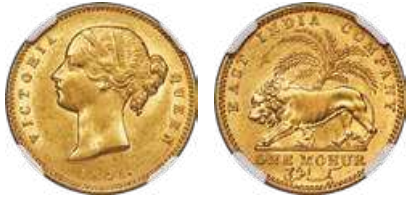
31807 British India. Victoria gold Mohur 1841-(c) (1850/1) MS62 NGC , Calcutta mint, KM462.3, S&W-3.7. Type A Bust, Type I Reverse. Divided Legend variety, with "W.W." and plain 4 (Large Date). A coin that immediately expresses eye appeal above that generally seen for its assigned grade, the fields radiant and unaffected by any larger instances of handling. As a relic of British colonialism, and due to its alluring imagery, this type remains popular with collectors, particularly so in better states of preservation such as this. Starting Bid: $2,500