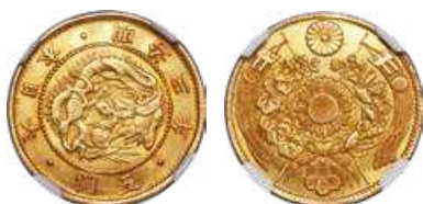
31913 Meiji gold 5 Yen Year 3 (1870) MS63 NGC , Osaka mint, KM-Y11, Fr-47. A beautifully styled selection with rich, amber-toned surfaces that beam with original luster and fields that are essentially free of any perceivable imperfections. Very attractive in this choice Mint State quality. Starting Bid: $750