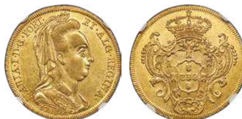
31102 Maria I gold 6400 Reis 1788-R AU58 NGC , Rio de Janeiro mint, KM218.1, LMB-525. Veiled bust type. A crisp example edging on Mint State condition. From the Santa Cruz Collection Starting Bid: $400