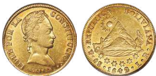
31052 Republic gold 8 Scudos 1842 PTS-LR AU55 NGC , Potosi mint, KM108.2. A fine example with minimal wear for the grade and a hint of rose toning. Starting Bid: $600