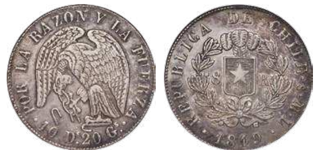
31281 Republic 8 Reales 1849 So-ML AU55 NGC , Santiago mint, KM96.2. Nicely toned with residual luster. Starting Bid: $400