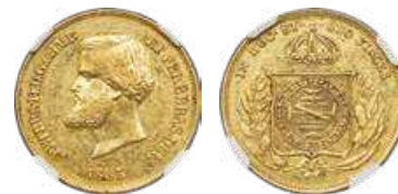
31126 Pedro II gold 10000 Reis 1863 AU53 NGC , Rio de Janeiro mint, KM467, LMB-651. An appealing type representative with significant residual luster and only mild wear to Pedro’s hair and beard. According to Livro Das Moedas Do Brasil , the second-highest valued date in the long-running series spanning from 1853 to 1889, exceeded in value only by its 1859-dated counterpart. Starting Bid: $450