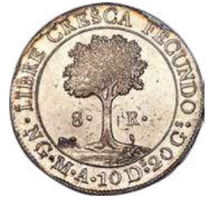
31744 Central American Republic 8 Reales 1842/37 NG-MA AU58 PCGS , Guatemala City mint, KM4. Sharply defined, with predominantly white surfaces revealing ample amounts of mint luster remaining. Short of crossing into Mint State territory one could not find a more detailed or better quality representative of the type. Starting Bid: $500