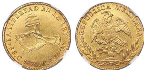
31993 Republic gold 8 Escudos 1870 C-CE AU55 NGC , Culiacan mint, KM383.2. Lustrous and well-defined, with a general appearance that borders quite close to uncirculated. Starting Bid: $600