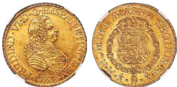
31951 Ferdinand VI gold 8 Escudos 1758 Mo-MM AU55 NGC , Mexico City mint, KM152. Considerable original luster, with a touch of orange patina and slight reflectivity around the peripheries. The few contact marks are tiny and barely noticeable. A very elusive, conditionally rare issue. Reserve: $5,400