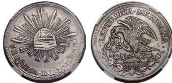
31971 Republic "Hookneck" 8 Reales 1824 Do-RL XF45 NGC, Durango mint, KM376.1. Defiant snake variety. Wholesome and nicely detailed for the issue, with few handling marks noticeable save for a short scratch on the obverse at 10 o'clock. Quite scarce and much in demand in this pleasant quality. Starting Bid: $500