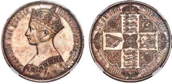
31673 Victoria Proof "Gothic" Crown 1847 PR58 NGC, KM744, S-3883. UN DECIMO edge. Lightly handled, with some minor edge knocks, hairlines and minor rub to Victoria's portrait. Attractive in all other regards, likely Britain's most beloved Crown and immensely popular in any grade. Starting Bid: $1,000