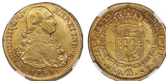
31314 Charles IV gold 8 Escudos 1791 P-SF VF Details (Obverse Scratched) NGC , Popayan, KM62.2. The surfaces display a moderate degree of wear and a few light handling marks, but nice underlying luster remains. Starting Bid: $500