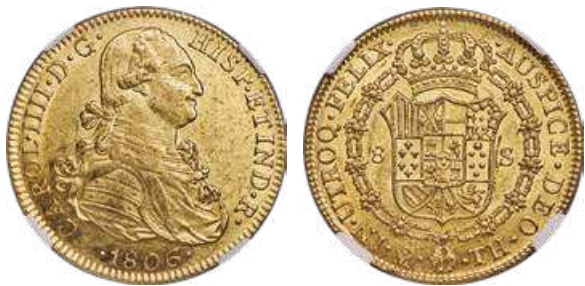
31961 Charles IV gold 8 Escudos 1806 Mo-TH AU58 NGC , Mexico City mint, KM159. Well struck with shimmering luster, especially notable on the reverse. Starting Bid: $500