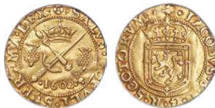
32198 James VI (I) gold Sword & Scepter 1602 XF45 PCGS, Edinburgh mint, KM20, S-5460. Obv. Crowned coat-of-arms. Rev. Sword and scepter crossed in saltire; crown above, thistle to left and right, date below. Minor areas of weakness in the legends, with most of the design and legend well struck with some remaining luster. A very popular type. Starting Bid: $750