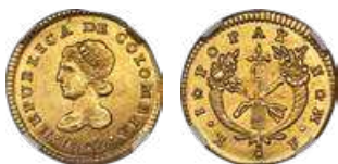
31322 Republic gold Escudo 1824 POPAYAN-FM MS63 NGC , Popayan mint, KM81.2. A well struck and lustrous example. Narrow and wide dates with at least five varieties of numeral and letter placements are known. Starting Bid: $400