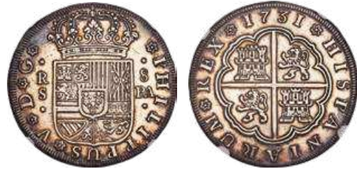
32229 Philip V 8 Reales 1731 S-PA XF Details (Surface Hairlines) NGC , Seville mint, KM357, Cal-942. The assayer's initials "PA" are horizontal on the coin. This is the only date of the rare "horizontal PA" type and one of only two pieces certified by NGC. Sharply struck, with light contact marks. Cleaned in the past, this example has toned nicely around the peripheries. Starting Bid: $500