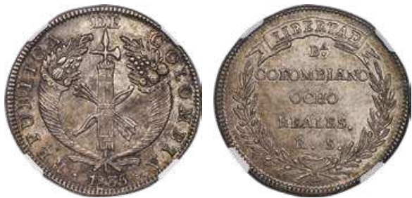
31321 Republic 8 Reales 1835 BA-RS MS63 NGC , Bogota mint, KM89. Handsome toning with shimmering luster underneath. A bold and well struck example with a strong reverse legend. Elusive in Mint State. Starting Bid: $500