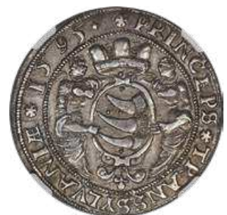
32323 Sigismund Bathyory Taler 1595 AU55 NGC, Dav-8804, Resch-198. Obv. Armored half-length portrait of Sigismund right, holding scepter. Rev. Crowned arms with supporters and date in legend. A laudable example of this sought-after type, which finds itself contested whenever encountered in better states of preservation. Steel-toned and well-defined with an attractive lightening atop the higher points. Sigismund (1572-1613) Prince of Transylvania and of the Holy Roman Empire, was an eager fighter of the Turks but not everyone in noble Transylvania wished to pursue this route. He won and, in the year this coin was struck, engaged in a wholesale revenge against those who opposed him, having them all executed. Starting Bid: $1,500