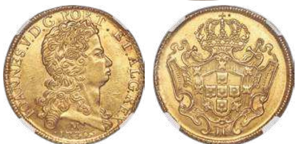
31083 João V gold 12800 Reis 1732-M MS61 NGC , Minas Gerais mint, KM139. A lovely bold strike with an orange-gold chroma and hints of rose-gold tone over satiny mint luster. From the Dresden Collection Starting Bid: $2,500