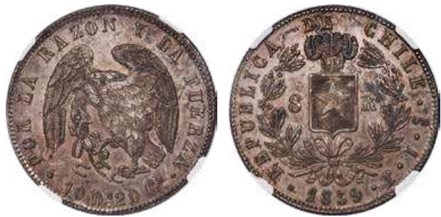
31280 Republic 8 Reales 1839 So-IJ AU55 NGC , Santiago mint, KM96.1. A deeply toned example with shimmering underlying luster and great eye-appeal. Starting Bid: $600