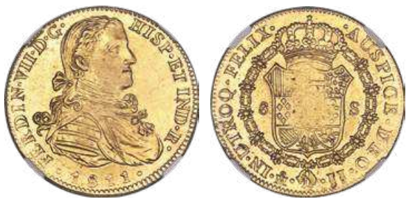
31964 Ferdinand VII gold 8 Escudos 1811 Mo-JJ AU58 NGC , Mexico City mint, KM160. A scarce type and grade, nicely toned with mint luster in the legends, and just the slightest doubling along the bust. Reserve: $2,000