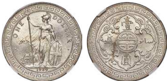
31705 George V Trade Dollar 1930-B MS65 NGC, Bombay mint, KM-T5. Though this date ranks as one of the more available ones in the series, this does not remain so at the gem level, at which point there appears a fairly steep drop in numbers certified by NGC and PCGS. This offering, then, with its impressive brilliance and smoothly flowing luster, cannot simply be ignored. Starting Bid: $350