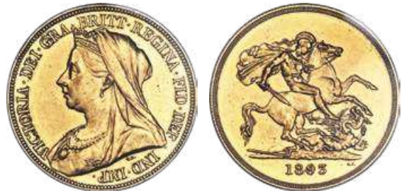
31689 Victoria gold 5 Pounds 1893 Genuine (Cleaned) PCGS, KM787, S-3872. Though PCGS did not assign a conditional grade with these earlier "Genuine" holder types, we feel that an AU grade is appropriate given the only minute wear to the higher points of the design. Boldly struck, with admirable remnant luster displayed in the fields, particularly so on the reverse surrounding the iconic St. George & Dragon motif. Starting Bid: $750