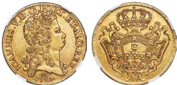
31082 João V gold 12800 Reis 1731-M AU53 NGC , Minas Gerais mint, KM139. A lovely coin with a striking portrait of João V accented by a deep tone within and around the design. Only light wear for the grade, and with minimal handling marks in the fields. Overall a quite pleasing piece that should warrant strong interest. From the Dresden Collection Starting Bid: $1,000