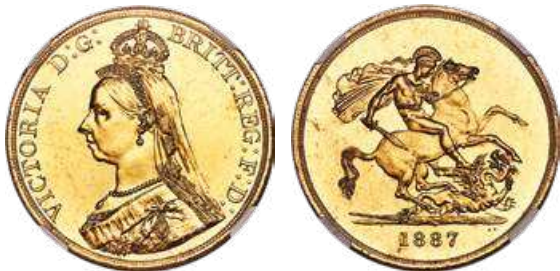
31686 Victoria gold 5 Pounds 1887 UNC Details (Cleaned) NGC, KM769, S-3864. Cleaned resulting in hairlines, and with a few edge bumps, otherwise a lustrous piece with some hints of deep red tone and especially sharp devices. Especially appealing for the type. Starting Bid: $700