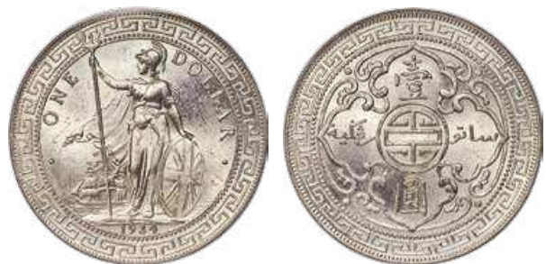
31706 George V Trade Dollar 1934-B MS64+ PCGS, Bombay mint, KM-T5, Prid-29. A better date, its surfaces fully white and lustrous with sharp striking detail. Almost at the gem level grade, and a conditional rarity thus. Starting Bid: $1,000