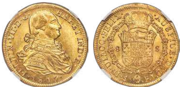
31276 Ferdinand VII gold 8 Escudos 1817/8 So-FJ MS63 NGC , Santiago mint, KM78. A lovely coin which exhibits full mint brilliance and a handsome lemony-gold coloration. Starting Bid: $1,000