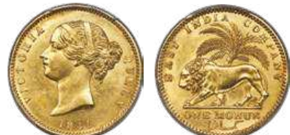
31808 British India. Victoria gold Mohur 1841-(c) (1850/1) MS62 PCGS , Calcutta mint, KM462.1, Prid-22, S&W-3.7. Type A Bust, Type I Reverse. Divided Legend variety, with "W.W." and plain 4 (Large Date). Incredibly bold in all facets of the design, especially intricate detailing in the leaves of the plan, the lion's mane, and Victoria's hair. Endowed with a trademark lemon-gold luster, and among the finest we have offered. From the Hamilton Collection of British India Coins Starting Bid: $2,500