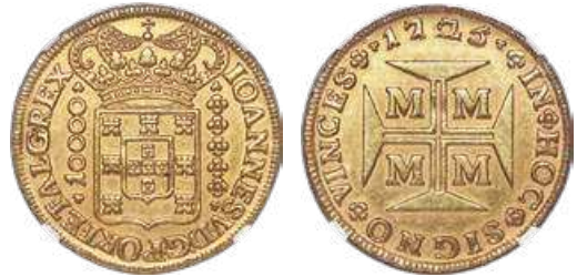
31079 João V gold 10000 Reis 1725-M AU58 NGC , Minas Gerais mint, KM116, Fr-34, LMB-245. This selection truly has everything working in its favor, including a well-placed, evenly-centered strike, sharp detail, and a lovely silky texturing in the fields that contrasts with the glossier higher points of the design. Utterly charming, we would challenge anybody to find a significantly more appealing example at a similar grade level. Starting Bid: $1,000