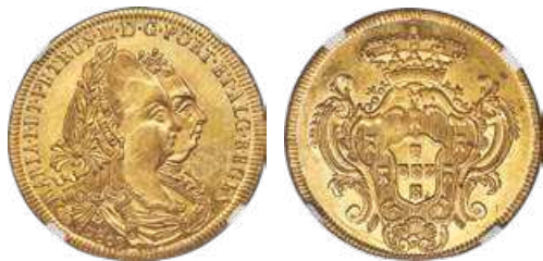
31096 Maria I & Pedro III gold 6400 Reis 1780-B MS62 NGC , Bahia mint, KM199.1, LMB-485. This near-choice representative offers a distinctive golden luminescence with scattered instances of planchet adjustment and die polish that should not be mistaken for handling. From the Santa Cruz Collection Starting Bid: $450