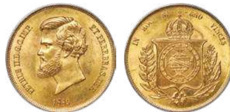
31127 Pedro II gold 20000 Reis 1889 MS64+ PCGS , Rio de Janeiro mint, KM468. A pleasing example of this often heavily marked type exhibiting a sparkling cartwheel luster and an eye-catching golden color. From the final year of the Brazilian Empire. Starting Bid: $750