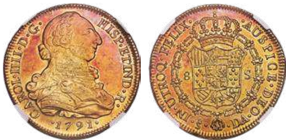
31266 Charles IV gold 8 Escudos 1791 So-DA MS62 NGC , Santiago mint, KM54. With CAROL III. Largely toned on the obverse with coppery-red hues, mint luster remaining in the fields, and a bold strike with few signs of handling. A nice and attractive example. Starting Bid: $750