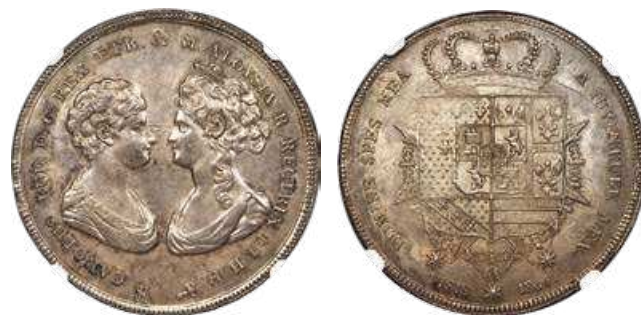
31892 Tuscany. Carlo Ludovico & Maria Louisa Francescone (10 Lire) 1806 MS62 NGC , KM-C50.2, Dav-152. A steel-toned representative with underlying blue throughout the surfaces and darker toning accents accentuating and enhancing the devices. Starting Bid: $400