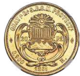
31747 Republic gold 20 Pesos 1869-R AU55 NGC , KM194. A boldly struck large gold coin with pleasing, slightly matte amber tones over vibrant underlying luster. Significant mirroring exists within the fields, especially beneath the legends and around the devices. Starting Bid: $500