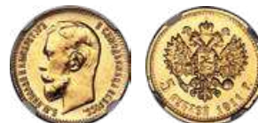
32167 Nicholas II gold 5 Roubles 1911-ЭБ MS63 NGC, St. Petersburg mint, KM-Y62, Bit-37 (R). Obv. Bust of Nicholas II left. Rev. Crowned Imperial eagle with date and value below. The final and key date for the type, struck to an original mintage of 100,000 pieces—an already low figure—though very few survived the melting pot at all, let alone in choice condition. On the whole, this particular specimen retains much mint brightness to the surfaces with only a few scattered tiny marks, none of which prove singularly distracting. Reserve: $5,000