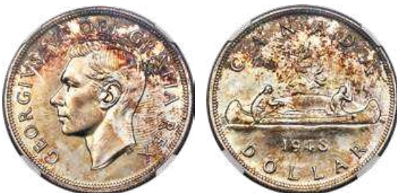
31196 George VI Dollar 1948 MS63 NGC, Royal Canadian mint, KM46. A fully choice offering of this key date, presenting variegated blue and amber color over lustrous and semi-reflective surfaces. An ideal target for the collector of date rarities within the Canadian, and Dollar, series. Starting Bid: $750