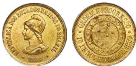
31142 Republic gold 20000 Reis 1898 MS62 NGC , Rio de Janeiro mint, KM 497. Strong mint bloom and a scarce date with a low mintage. Starting Bid: $500