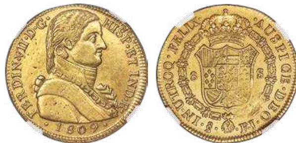
31272 Ferdinand VII gold 8 Escudos 1809 So-FJ AU Details (Obverse Repaired) NGC , Santiago mint, KM72. Exhibits a bold strike with clear details. Starting Bid: $500