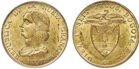
31328 Nueva Granada gold 16 Pesos 1847 BOGOTA-RS MS61 PCGS , Bogota mint, KM94.1. Flashy mint bloom and a strong lemony-gold chroma characterize this desirable type, scarcely ever found in Mint State. Starting Bid: $500