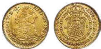
31310 Charles IV gold 2 Escudos 1790 NR-JJ AU55 PCGS , Nuevo Reino mint, KM51.1. Sparkling peripheral luster noted especially on the reverse. Starting Bid: $500