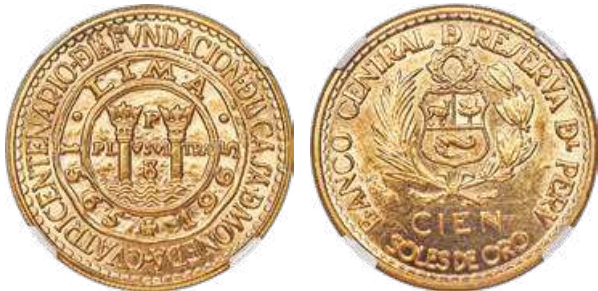
32091 Republic gold 100 Soles 1965 MS64 NGC , Lima mint, KM243. A fine example exhibiting a vibrant, satiny luster that spins in the fields when the coin is tilted in the light, and a sparkling gold coloration. AGW 1.3543 oz. Starting Bid: $700