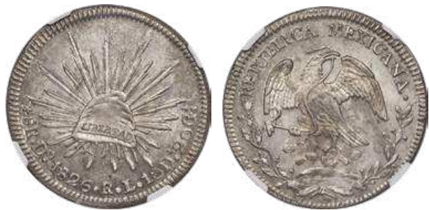
31974 Republic 8 Reales 1826 Do-RL MS62 NGC , Durango mint, KM377.4, DP-Do03. Strong, vibrant luster glows from a nicely toned background exhibiting strong die polishing marks, alongside a good, bold strike. Starting Bid: $400