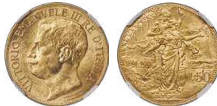
31902 Vittorio Emanuele III gold "Kingdom Anniversary" 50 Lire 1911-R MS62 NGC, Rome mint, KM54. A boldly struck coin with bright fields and cartwheel luster, and a few light contact marks. The designs are neoclassical and commemorate the 50th anniversary of the unification of Italy and the founding of the Kingdom. Starting Bid: $500