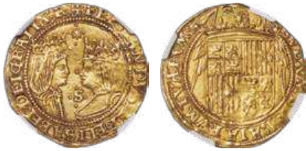
32225 Ferdinand & Isabella (1476-1516) gold 2 Excelentes ND (from 1497)-S AU55 NGC , Seville mint, Fr-129, Cay-2933. Boldly struck with handsome toning surrounding the designs, excellent metal and good luster. Starting Bid: $450