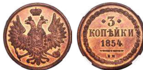
32131 Nicholas I 3 Kopecks 1854-BM MS65 Red and Brown NGC , Warsaw mint, KM-C151.3, Bit-859, Parchimowicz-1109e. Obv. Crowned Imperial eagle with orb and scepter. Rev. Date and value in wreath. Boldly struck, with considerable original golden mint luster. A splendid gem example - the finest certified by either NGC or PCGS. Starting Bid: $1,000