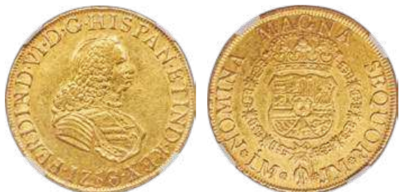
32070 Ferdinand VI gold 8 Escudos 1758/7 LM-JM XF45 NGC , Lima mint, KM59.2, Onza-588. A sparkling example, lustrous and attractive for the assigned grade with the added academic interest of a legible overdate. Well-detailed despite circulation, and a desirable example of this scarcer type. Reserve: $1,600