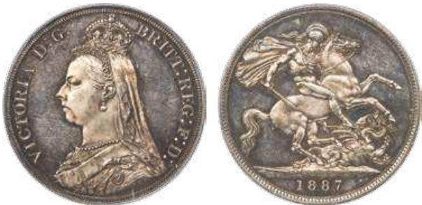
31675 Victoria Proof Crown 1887 PR63 Cameo PCGS, KM765, S-3921. Mintage: 1,084. Obv. Crowned and veiled bust of Victoria left. Rev. St. George on horseback, slaying dragon. Frosted devices with gold and gray toning. Light marks, and faint hairlines, consistent with the grade. Starting Bid: $750