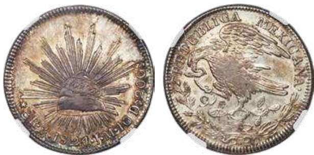
31969 Republic "Hookneck" 8 Reales 1824 Mo-JM AU58 NGC, Mexico City mint, KM-A376.2, DP-Mo03. Snake in tight loop. Abundant luster remains, with light rubbing on the cap and the eagle's breast, although the cap has a bold Libertad. Gold and russet toning is seen on both sides with traces of blue around the peripheries. Starting Bid: $600