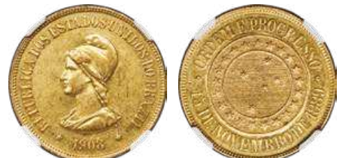
31145 Republic gold 20000 Reis 1908 AU55 NGC , Rio de Janeiro mint, KM497, LMB-727. Mintage: 6,001. Gently circulated with luminous brilliance bordering the struck design. Starting Bid: $450