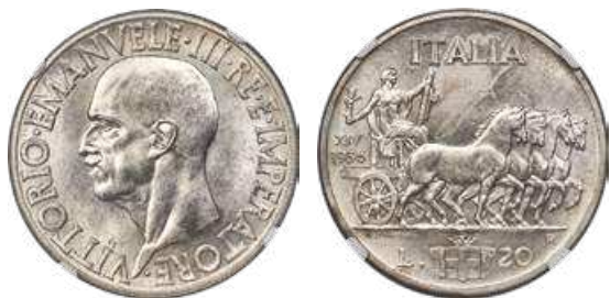
31899 Vittorio Emanuele III 20 Lire 1936-R MS62 NGC, Rome mint, KM81. White argent luster cascades over the surfaces of this near-choice example with only a small degree of silver patina seen on the reverse. The type was struck to commemorate Italian victory and occupation in Ethiopia and represents one of several examples of the great artistry employed in the Italian coinage of this period. Starting Bid: $400