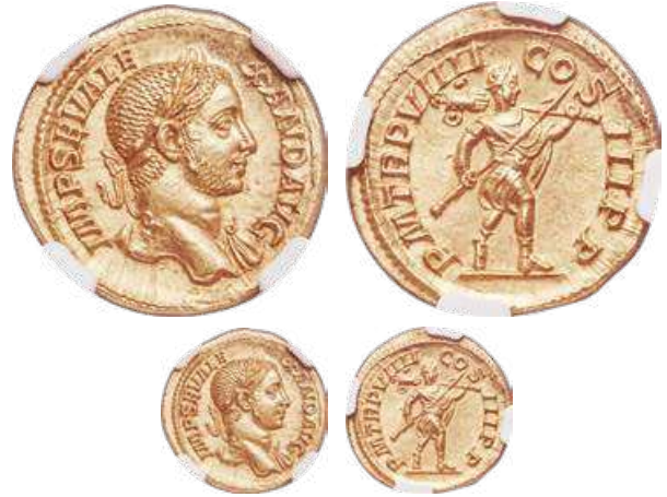
30293 Severus Alexander (AD 222-235). AV aureus (20mm, 6.64 gm, 7h). NGC Choice MS★ 5/5 - 5/5, Fine Style. Rome, AD 230. IMP SEV ALE-XAND AVG, laureate bust of Severus Alexander right, drapery on left shoulder / P M TR P VIII-CO-S-III P P, emperor as Romulus, radiate, wearing tunic and sagum (military cloak), walking right, transverse spear in right hand, trophy in left over shoulder. RIC IV.II 103. Calicó 3121. Perfectly struck from fresh, artistic dies on a gleaming flan. Starting Bid: $4,000