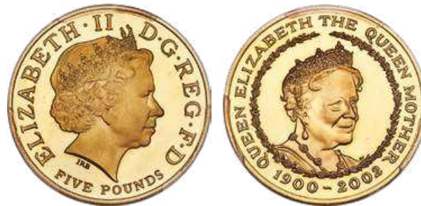
31728 Elizabeth II gold Proof “Queen Mother” 5 Pounds 2002 PR65 Deep Cameo PCGS, KM1035b, S-4556. Struck in honor of the Queen mother. AGW 1.1775 oz. Starting Bid: $750