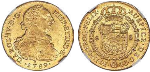
32074 Charles IV gold 8 Escudos 1789 LM-IJ AU55 NGC , Lima mint, KM92. Brightly lustrous surfaces with a lemon-yellow tone and substantial luster remaining. Starting Bid: $600