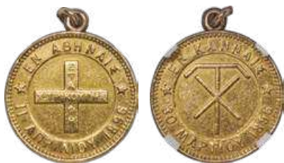
31740 Charilaos Trikoupis gold Medal 1896 XF45 NGC, By Wyon. 25mm. 16.84gm. Commemorating the death in Cannes of former Prime Minister Charilaos Trikoupis. EN ΑΘΗΝΑΙΣ 11 ΑΠΡΙΛΙΟΥ 1896, cross inscribed ΕΤΑ-ΦΗ Χ. ΤΡΙΚΟΥΠΗΣ / EN ΚΑΝΝΑΙΣ 30 ΜΑΡΤΙΟΥ 1896, monogram. Light rose-gold toning around the devices and along the peripheries. Looped for suspension. Starting Bid: $500