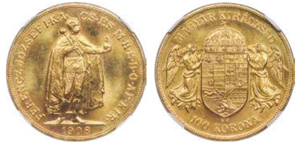
31762 Franz Joseph I gold Restrike 100 Korona 1908-KB MS67 NGC , Kremnitz mint, KM491. A nearly flawless example exhibiting prooflike fields and an orange-gold luster. AGW 0.9802 oz. Starting Bid: $600