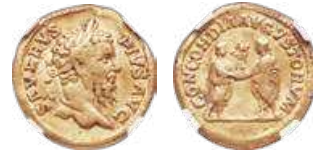
30292 Septimius Severus (AD 193-211). AV aureus (19mm, 6.42 gm, 11h). NGC Fine 4/5 - 1/5, ex-mount, bent. Rome, AD 209. SEVERVS-PIVS AVG, laureate head of Septimius Severus right / CONCORDIA AVGVSTORVM, Caracalla and Geta, each laureate and togate, standing vis-à-vis, jointly holding in right hands Victory standing left on globe. RIC IV.I 255. Calicó 2435a. Starting Bid: $500