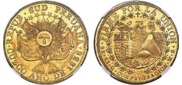
32094 South Peru. Republic gold 8 Escudos 1838 CUZCO-MS AU Details (Obverse Damage) NGC , Cuzco mint, KM171. An unusual rub in the field beneath the draped flags on the obverse necessitated the Details designation, but still a lovely piece with strong luster and mirroring in the fields, and a golden chroma exhibiting hues of tangerine. Starting Bid: $1,250