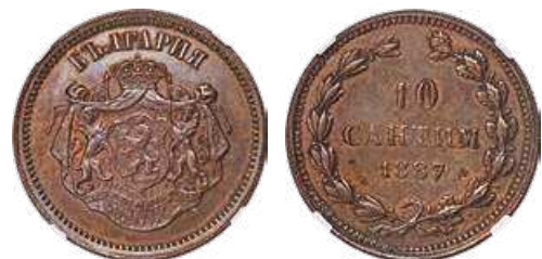
31146 Ferdinand I copper Pattern 10 Santim 1887-AB MS62 Brown NGC , KM-E3. Mintage: 8. A rich chocolate brown with just a hint of mint red within the recesses around the devices. An appealing strike and of extreme rarity. Starting Bid: $500