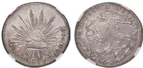
31970 Republic "Hookneck" 8 Reales 1824 Mo-JM AU53 NGC, Mexico City mint, KM-A376.2. A nicely toned hookneck which exhibits a strongly radiant central luster. Starting Bid: $500