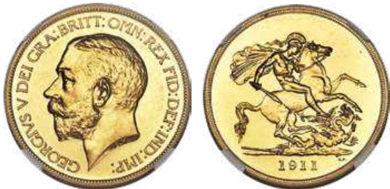
31700 George V gold Proof 5 Pounds 1911 PR62 NGC, KM822, S-3994. Near choice, entirely without wear and with solely scattered wisps holding it back from a higher certified grade. An immensely popular type in an impressive level of preservation. Starting Bid: $2,000