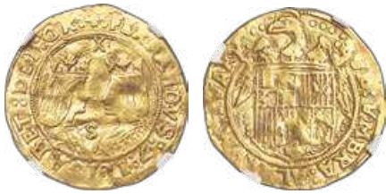
32226 Ferdinand & Isabella gold 2 Excelentes ND (1476-1516)-S XF40 NGC , Seville mint, Cay-2926. 6.93gm. Variety with X in the fields above the monarchs. An offering displaying relatively clear devices, the flan slightly crinkly. Starting Bid: $500