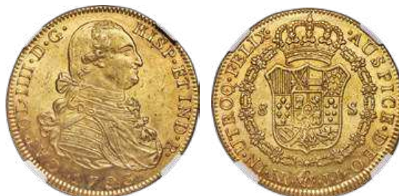
31315 Charles IV gold 8 Escudos 1793 NR-JJ MS63 NGC , Nuevo Reino mint, KM62.1, Fr-51. Undeniably attractive as a Mint State representative of the type, in choice condition at that, with glistening golden surfaces and devices expressing details in their as-struck glory. Lightly toned with a soft expression of amber seen at the peripheries. Tied for finest-graded by NGC to-date. Starting Bid: $1,250