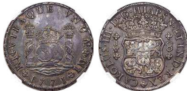
32071 Charles III 8 Reales 1771 LM-JM VF Details (Stained) NGC , Lima mint, KM64.2, cf. Calbeto-356 (this error not noted), Cal-849, Cay-11988. Variety with one dot over mintmark, and HIASPN spelling error. An iconic and very rare engraver's error of which only a handful of specimens are thought to exist and which come heavily coveted in all grades. Despite the noted staining, which leaves a darkened obsidian color, we note that a VF Details (Polished) example hammered for $2100 in the Goldbergs' 2015 Auction 85. Starting Bid: $500