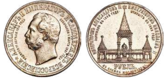
32164 Nicholas II “Alexander II Memorial” Rouble 1898-AF UNC Details (Cleaned) PCGS, St. Petersburg mint, KM-Y61, Bit-323 (R). Mintage: 5,000. Bright white, with full luster over deeply mirrored surfaces free of singularly distracting marks. Starting Bid: $1,000