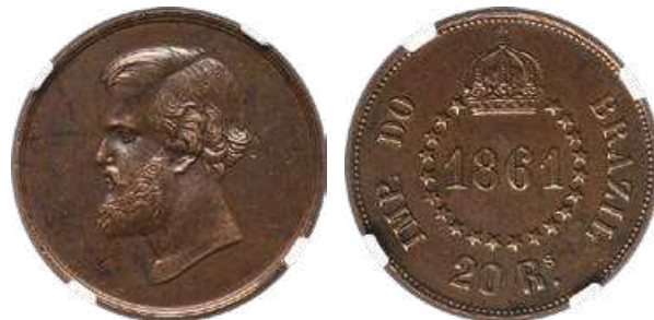
33418 Pedro II copper Pattern 20 Reis 1861 AU55 Brown NGC , KM-Pn90, Bentes-E47.03, LMB-E048A. Deep chocolate tones reside over surfaces clear of any significant handling, any wear quite minimal and the detailing resultingly sharp. A scarcer type, rarely encountered. From the Dresden Collection Starting Bid: $200