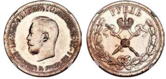
32162 Nicholas II “Coronation” Rouble 1896-AFMS64 NGC, St. Petersburg mint, KM-Y60, Bit-322. Obv. Head of Nicholas II left. Rev. Crowned orb, sword, and scepter with wreath of oak and laurel leaves, with value above. Nicely struck for the issue, with bright silvery luster. A hint of golden patina is visible, with only a few minor marks. The appearance is exemplary. From the Allen Moretti Swiss Collection Starting Bid: $750