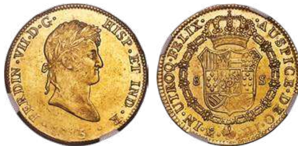
31965 Ferdinand VII gold 8 Escudos 1815/4 Mo-HJ MS62 NGC , Mexico City mint, KM161, Cal-54. Golden mint luster with moderate marks. The date is softly struck, as is the legend in the same spot on the reverse. Even with the weakly struck date, the 5/4 is quite sharp. A very rare Mint State example of this elusive overdate/assayer combination, and, by far, the finest certified example. Reserve: $3,300