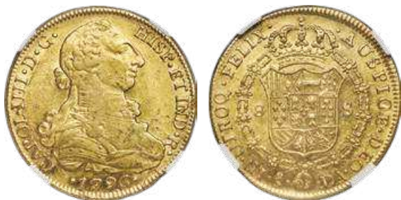
31267 Charles IV gold 8 Escudos 1796 So-DA AU55 NGC , Santiago mint, KM54. Strong luster evident in the fields, especially noticeable on the reverse, and a bright lemon-gold color. A few scattered contact marks evident on the obverse noted for accuracy. Starting Bid: $700