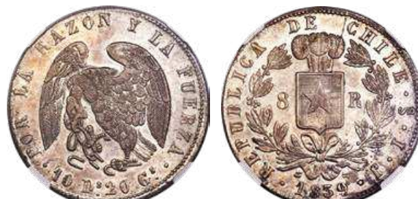
31279 Republic 8 Reales 1839 So-IJ AU58 NGC , Santiago mint, KM96.1. A most attractively toned example of this popular type, especially scarce in an impressive near Mint State grade such as this. Underlying mint luster remains along with pleasing argent surfaces. A die crack along the middle of the reverse is noted for completeness. Starting Bid: $700