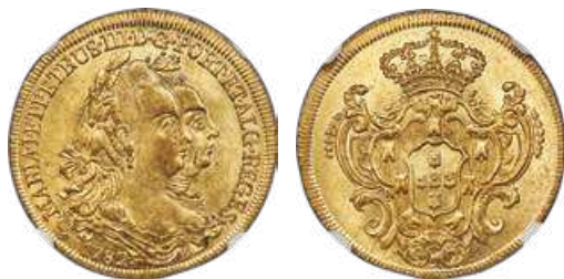
31098 Maria I & Pedro III gold 6400 Reis 1782-R MS62+ NGC , Rio de Janeiro mint, KM199.2, LMB-464. Brilliant yellow-gold with only a single thin graze across Pedro's cheek precluding a choice grade. From the Santa Cruz Collection Starting Bid: $500