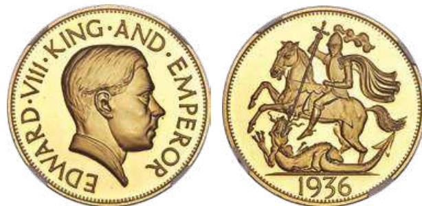
31708 Edward VIII gold Proof Fantasy Crown 1936-Dated (1972) PR66 Ultra Cameo NGC, Pobjoy mint, KMX-M4a var., FM-16b. Type II (gold). Struck featuring Edward facing right, correct for the monarchical tradition of facing the opposite way to one’s predecessor, but incorrect numismatically (Edward choosing to face the same way as his father as he preferred his left side). A premium gem Proof, a perfect cameo achieved through Edward’s fantasy portrait and the mirror fields behind. Starting Bid: $750