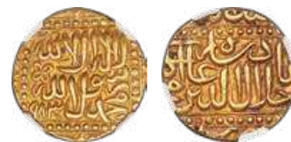
31764 Mughal Empire. Akbar (AH 963-1014 / AD 1556-1605) gold Mohur AH 983 (AD 1575/6) AU55 NGC , Agra mint, KM108.1, Hull-1205. Showcasing a trademark bold relief to the calligraphy so desirable for Akbar's coinage, a bright-dark contrast between fields and devices adding an additional layer to the coin's aesthetic appeal. Starting Bid: $500