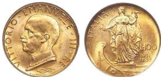
31911 Vittorio Emanuele III gold 100 Lire Anno IX (1931)-R MS66 NGC , Rome mint, KM72, Pag-646. A fully brilliant, gem example, with superb eye-appeal and surfaces revealing only tiny, barely noticeable marks. No examples have been certified finer than this pleasing specimen. Starting Bid: $600