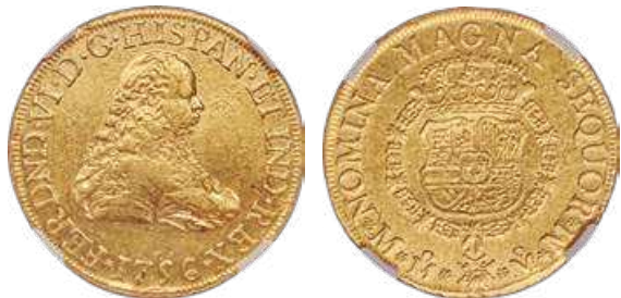
31950 Ferdinand VI gold 8 Escudos 1756 Mo-MM XF Details (Bent) NGC, Mexico City mint, KM151, Fr-17. An offering that retains good detail for its assigned grade, the noted bend quite mild and even difficult to detect. Reserve: $1,500