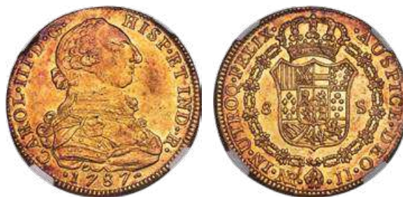
31312 Charles IV gold 8 Escudos 1787 NR-JJ MS61 NGC , Nuevo Reino mint, KM50.1a. A lovely Mint State example with a lustrous orange-gold chroma and deep coppery-red tones throughout. Starting Bid: $400