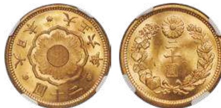
31914 Taisho gold 20 Yen Year 6 (1917) MS64 NGC , Osaka mint, KM-Y40.2, Fr-53. An appealing selection with satiny cartwheel luster that cascades from the surfaces and minimal instances of contact on either side. Starting Bid: $750