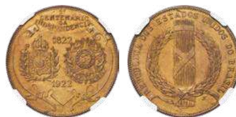
31128 Republic copper alloy Pattern 2000 Reis 1922 MS64 Brown NGC , Bentes-58.01, LMB-E240. Struck for the 100th anniversary of Brazil’s independence. Pleasingly toned, displaying satiny surfaces free of any significant handling. From the Dresden Collection Starting Bid: $250