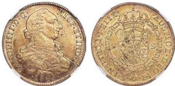
31269 Charles IV gold 8 Escudos 1803 So-FJ AU55 NGC , Santiago mint, KM54, Fr-23. Exhibiting only light circulation wear and benefitting from a well-centered and uniform strike, this bronze-toned specimen is a candidate as worthy as any for a type-collector seeking clear detail and good eye appeal at a more affordable price point. Starting Bid: $450