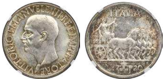
31898 Vittorio Emanuele III 20 Lire 1936-R MS63+ NGC, Rome mint, KM81. Lightly iridescent tones inhabit the peripheries, while the centers sparkle with cascading goldenrod luster. A highly flashy piece with abundant eye-appeal. Starting Bid: $700