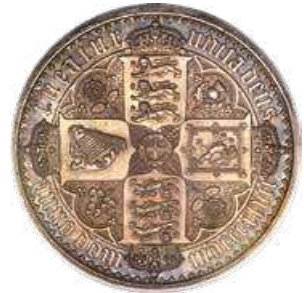
31672 Victoria Proof "Gothic" Crown 1847 PR63 PCGS, KM744, S-3883. UN DECIMO edge. A superlative specimen of Britain's most beloved Crown, evenly toned to a slate-gray with exceptionally crisp striking detail. Victoria's portrait is entirely without wear, as are the reverse cruciform of shields. Only scattered hairlines define the grade and prevent this piece from reaching an even loftier technical certification. Fully choice and appealing. Starting Bid: $2,500