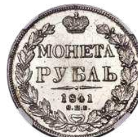
32140 Nicholas I Rouble 1841 СПБ-НГ MS65 NGC, St. Petersburg mint, KM-C168.1, Bit-192. Obv. Crowned Imperial eagle in beaded circle. Rev. Crowned date and value within wreath. Full mint brilliance, with a hint of golden patina and surfaces displaying only a very few insignificant marks. Minor die striations, as struck, are noted, and the overall strike is bold. One of the nicer examples one might see. Starting Bid: $750