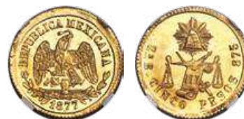
31995 Republic gold 5 Pesos 1877 Zs-S/A MS65 NGC , Zacatecas mint, KM412.7. A gem example of this date and denomination combination with brilliant mint luster, a superb sharp strike, and nice strong borders. This excellent specimen will appeal to both the connoisseur and the generalist collector. Starting Bid: $500