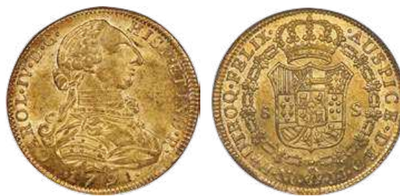
31313 Charles IV gold 8 Escudos 1791 NR-JJ MS62 NGC , Nuevo Reino mint, KM62.1. Strong detail, impressive golden luster, and a light overall tone. Starting Bid: $1,000