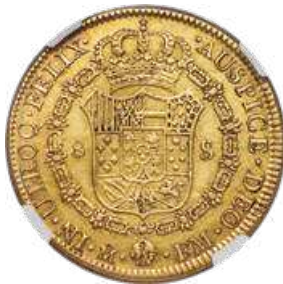
31956 Charles III gold 8 Escudos 1772 Mo-FM AU53 NGC , Mexico City mint, KM156.1. Bright luster radiates from the central designs, a light mirroring noted along the peripheries beneath the legends. Starting Bid: $750