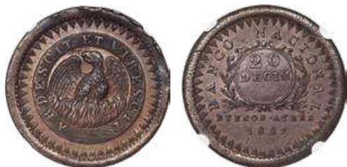
31011 Buenos Aires. Republic 20 Decimos 1827 MS62 Brown NGC, KM5. This laudable copper issue exhibits a condition much beyond that normally seen for the type, which usually encompasses significant wear, damage, or both. It is a testament to its quality that this is the only representative of the issue certified by NGC at all, only a single other example seen by PCGS. The struck detail is pleasingly bold, with light cocoa fields surrounded by more deeply toned devices and rims. Starting Bid: $750