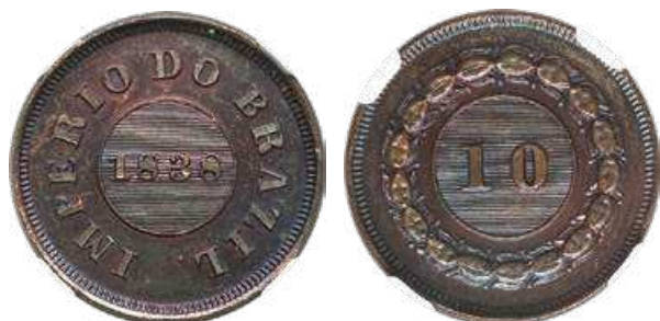
33416 Pedro II copper Pattern 10 Reis 1838 MS63 Brown NGC , KM-Pn51, LMB-E033A, Bentes-E49.08. An offering that is as attractive as it is scarce, displaying electric tones of magenta and blue over scintillating fields, all details clear and expressed to Proof-like precision. From the Dresden Collection Starting Bid: $300