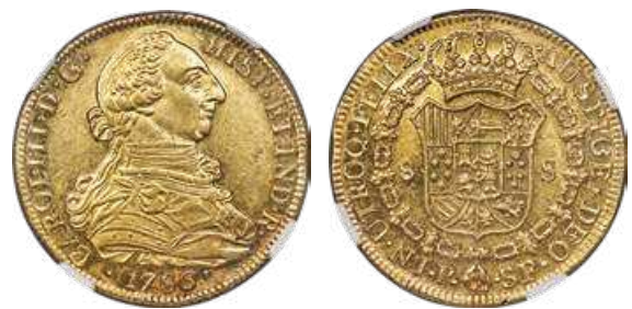
31308 Charles III gold 8 Escudos 1786 P-SF MS61 NGC , Popayan mint, KM50.2a. A lovely example exhibiting a hint of wateriness along the peripheries and sunny golden surfaces. The overall strike is well detailed and quite bold, and unusual for the issue, lacking any weak spots. Starting Bid: $750