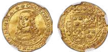
31499 Erfurt. Christina of Sweden gold Ducat 1645 AU Details (Cleaned) NGC, KM88, Fr-929, AAJ-37. 3.41gm. ++CHRISTINA: D: G: SVEC: GOTH: VAND: REGINA •, three quarters bust of Christina wearing crown / • PR • FINL • DVX • ET HON • ET CAREL • DOM • IN, crowned quadripartite shield. A notoriously difficult type to procure without signs of mounting or use in jewelry, still incredibly alluring despite the noted cleaning, which for its part appears light and contained to the obverse fields, leaving much of peripheral elements and reverse design quite original. One of the nicest examples of the issue we have handled. Starting Bid: $1,500