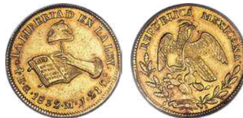
31978 Republic gold 4 Escudos 1832 Go-MJ AU53 PCGS , Guanajuato mint, KM381.4, Fr-83. Lustrous and bold, this emission exhibits better than average detail for the grade, aesthetically enhanced by surfaces expressing deep honeyed tones. Starting Bid: $500