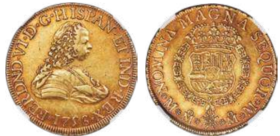
31949 Ferdinand VI gold 8 Escudos 1756 Mo-MM XF45 NGC , Mexico City mint, KM151, Fr-17. A nice strike for this scarce issue with slight toning over lightly marked surfaces. Reserve: $2,700