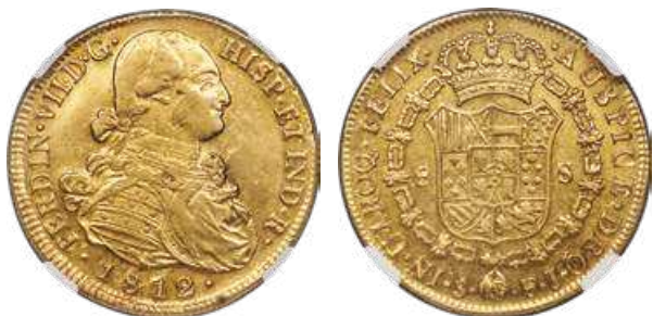
31275 Ferdinand VII gold 8 Escudos 1812 So-FJ AU50 NGC , Santiago mint, KM78. A bright and sunny example with a few light contact marks and plenty of luster remaining. Starting Bid: $500