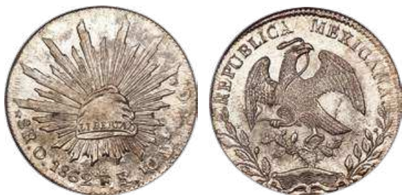
31975 Republic 8 Reales 1862 O-FR MS66 NGC , Oaxaca mint, KM377.11, DP-Oa07. An absolutely elite level of certification for the type that is entirely unmatched at either NGC or PCGS—and a tier seldom achieved by any of the emissions of the Cap and Rays series—every detail painstakingly picked out by thick flow lines and blazing frosty white luster. An absolute must for the condition-sensitive collector of Mexican coinage. Starting Bid: $500