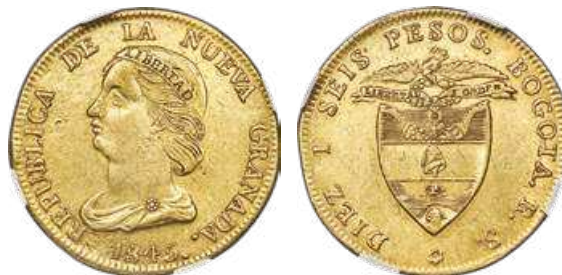
31327 Nueva Granada gold 16 Pesos 1845 BOGOTA-RS AU58 NGC , Bogota mint, KM94.1, Fr-74. Brass-gold with well-defined devices and sharp legends bordering the central features. A lovely example of the type, highly collectible in near-mint condition. Starting Bid: $400