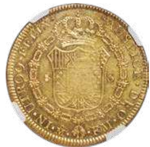
31960 Charles IV gold 8 Escudos 1790 Mo-FM AU53 NGC , Mexico City mint, KM157. Sparkling mint luster illumines the peripheries and other protected areas throughout the design. A good overall strike with just a touch of softness in the centers, and only light evidence of handling. Starting Bid: $500