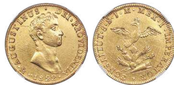
31967 Augustin I Iturbide gold 8 Escudos 1822 Mo-JM AU Details (Harshly Cleaned) NGC , Mexico City mint, KM313.1, Onza-1778. Unfortunately cleaned on the heavier side, with large hairlines visible across the surfaces. However, this type remains highly popular, resulting in accordingly high prices and rendering this example a more affordable opportunity for the type collector. Relatively well-struck for the issue, and exhibiting clear legends bordering the edges. Starting Bid: $1,000