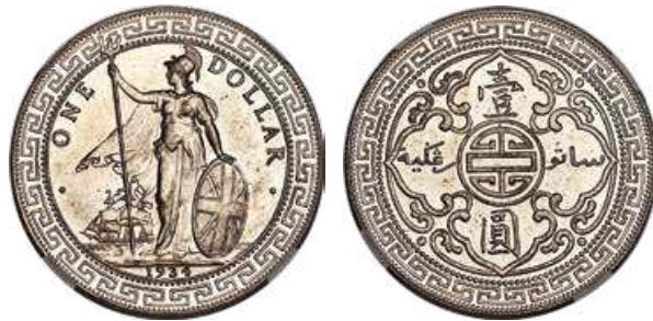
31707 George V Trade Dollar 1934-B MS64 NGC, Bombay mint, KM-T5. A significantly better date in the series displaying flashy argent luster, undiminished by any singular instances of handling, a faint silver patina adding a hint of contrast. Starting Bid: $750