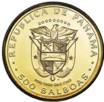
32053 Republic gold Prooflike 500 Balboas 1979-FM PL66 PCGS , Franklin mint, KM62. An attractive, large prooflike example featuring the Golden Jaguar. AGW 1.2066 oz. Reserve: $1,500