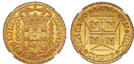
31080 João V gold 10000 Reis 1726-M MS60 NGC , Minas Gerais mint, KM116, Fr-34. A lightly toned example with bold, nicely struck features and good underlying mint luster. An unusual feature of this and other issues from Minas Gerais is the way in which the numbers and letters were cut, with interesting embellishments. Note here especially the way the number 2 in the date has been engraved. From the Dresden Collection Starting Bid: $1,250