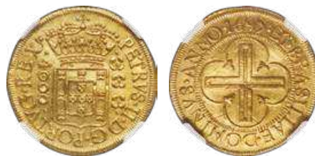
31054 Pedro II gold 4000 Reis 1697-(B) AU Details (Bent) NGC , Bahia mint, KM89, LMB-24. A less-circulated specimen of this earlier type showing a modest bend in the flan that proves of only minor consequence to eye appeal. The selection benefits from a sound strike, with ample luster evident in the recessed areas. From the Santa Cruz Collection Starting Bid: $400