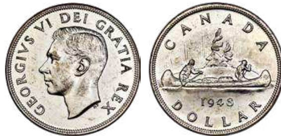
31199 George VI Dollar 1948 MS62 PCGS, Royal Canadian mint, KM46. A scarce date in the George VI series, this example demonstrates beaming argent luster with only light grazes in the fields precluding higher certification. Starting Bid: $600