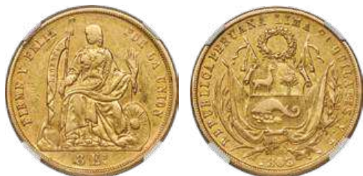
32085 Republic gold 8 Escudos 1863/2 LIMA-YB XF Details (Obverse Cleaned) NGC , Lima mint, KM183, Fr-68. A clear type representative exhibiting a somewhat soft strike and light handling. Starting Bid: $500