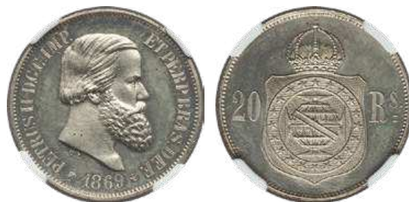
33420 Pedro II copper-nickel Pattern 20 Reis 1869 MS63 NGC , KM-Pn135, Bentes-E48.03, LMB-E054. A highly visually appealing selection of this elusive Brazilian pattern illustrating deep argent tones that cloak the devices alongside scintillating fields revealing only minimal evidence of handling. From the Dresden Collection Starting Bid: $150