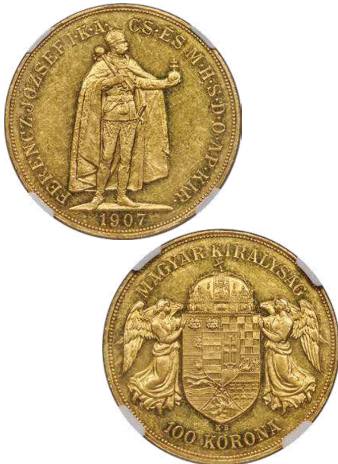
31760 Franz Joseph I gold 100 Korona 1907-KB AU58 NGC , Kremnitz mint, KM491. The coin exhibits a lovely lemon-gold chroma with a minimum of light friction marks often found on this issue. Starting Bid: $2,000