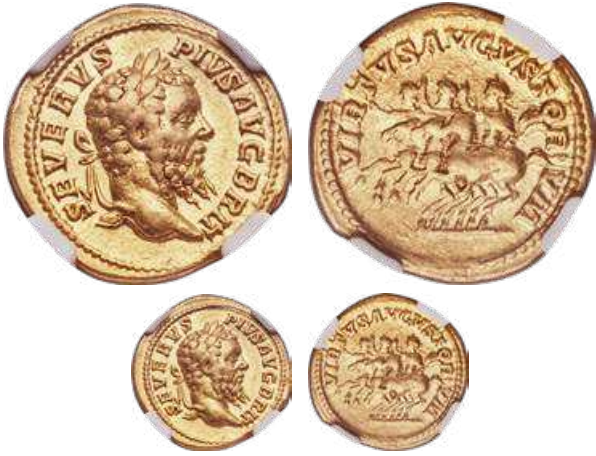
30291 Septimius Severus (AD 193-211). AV aureus (21mm, 7.37 gm, 1h). NGC VF 5/5 - 3/5. Rome, ca. AD 210-211. SEVERVS-PIVS AVG BRIT, laureate head of Septimius Severus right / VIRTVS AVGVSTORVM, Septimius, Caracalla and Geta, on horses prancing left, each raising right hand. Calicó 2577 (this coin). RIC IV.I - Cohen -

Ex Morris Collection (Heritage 3071, 6-7 January 2019), lot 32151; Numismatica Ars Classica K (30 March 2000), lot 1911.