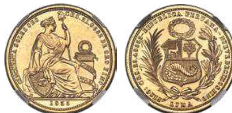
32087 Republic gold 50 Soles 1955 MS66 NGC , Lima mint, KM230. Mintage: 1,898. The single finest of this very low mintage date for the type, with the next finest being an MS64. Glassy and nearly prooflike in the fields, and an absolute must for the connoisseur of Peruvian gold. Starting Bid: $400