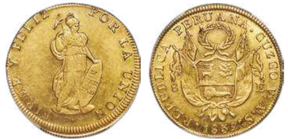
32081 Republic gold 8 Escudos 1832 CUZCO-VoARSH AU53 PCGS , Cuzco mint, KM148.2. Light even wear over softly toned surfaces with bright, flashy luster. Starting Bid: $500