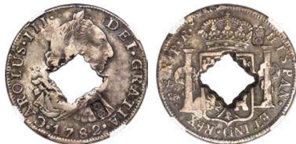
31742 British Occupation Countermarked 9 Livres ND (1811) VF35 NGC, KM24, Prid-2, Lec-19. Displaying square crenelated hole with crowned G countermarks (XF) on both obverse and reverse of a Bolivian Charles III 1782 PTS-PR 8 Reales (cf. KM106). A very rare issue on this host coin. Included is the original French information tag, probably from over 100 years ago. Starting Bid: $500