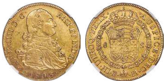
31050 Charles IV gold 8 Escudos 1803 PTS-PJ AU55 NGC , Potosi mint, KM81. A notable example with strong original golden luster and very minimal evidence of handling. Starting Bid: $500