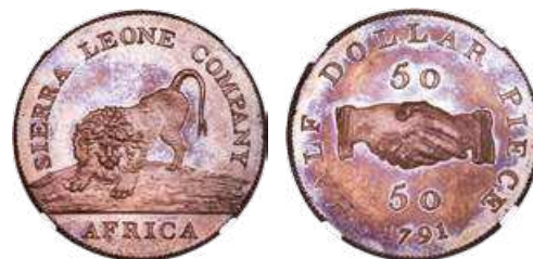
32200 British Colony. Sierra Leone Company copper Proof 50 Cents 1791 PR65 Brown NGC, KM5a, FT3b. Obv. Lion advancing left. Rev. Clasped hands dividing 50-50 with date below. Superbly struck, with only minute imperfections. Both sides display mirrored fields, with reddish-brown toning and hints of bluish patina on the reverse. Starting Bid: $500