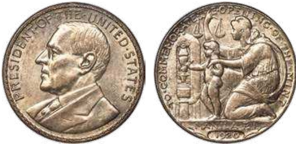
32105 USA Administration silver "Wilson" Dollar 1920 MS63 ANACS , HK-449. Struck on the opening of the Manila mint on July 16, 1920. The Wilson portrait resembles his likeness from the 1919 Assay Office medal. The reverse design is adapted from the 1882 Assay Office medal. A lustrous representative of the type displaying strong surface preservation alongside a notable degree of cartwheel luster. Starting Bid: $600