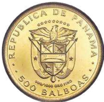
32052 Republic gold 500 Balboas 1975-FM PL64 PCGS , Franklin mint, KM42. Birth of Balboa commemorative. Excellent mirroring with a bright gold chroma. AGW 1.2066 oz. Reserve: $2,000