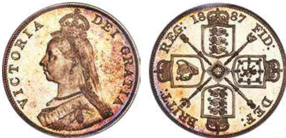
31671 Victoria Proof Double Florin 1887 PR65 Deep Cameo PCGS, KM763. Arabic 1 in date. An extraordinary piece - when one looks at the NGC and PCGS censuses for this type, the significance of its 'Deep Cameo' attribution is plainly obvious. 82 standard Proof examples have been certified between the two grading services; a further 48 have received 'cameo' designations, and just 9 have been considered at the lofty Deep Cameo level including the present offering. Victoria's jubilee portrait is covered in rich silver frost, the fields toned to seafoam green with considerable reflectivity - even the fine outlines of the reverse shields exhibit a matte texture in contrast to the mirrors behind. Its quality near unparalleled, a piece both produced to an enviable standard and subsequently preserved. Starting Bid: $750