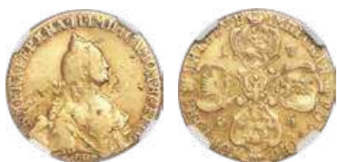
32126 Catherine II gold 5 Roubles 1766-СПБ VF Details (Obverse Tooled) NGC , St. Petersburg mint, KM-C78a. A very rare type, with numerous scratches and light tooling to the obverse in line with the grade, and the reverse far more original. Difficult to obtain in any condition, a popular Russian golden offering. Starting Bid: $500