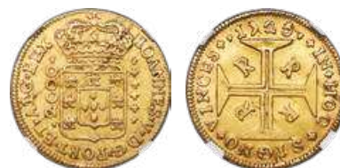
31057 João V gold 2000 Reis 1725-R XF Details (Cleaned) NGC , Rio de Janeiro mint, KM112, LMB-157, Gomes-95.02. Sharp features and superior for this scarce type. Ex. RLM Collection From the Dresden Collection Starting Bid: $500