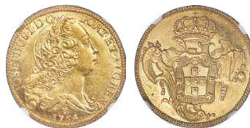
31093 Jose I gold 6400 Reis 1764-R AU58 NGC , Rio de Janeiro mint, KM172.2, LMB-432. Benefitting from a well-placed strike, this brightly lustrous representative demonstrates only soft, light handling along with bold rims bordering the planchet. From the Santa Cruz Collection Starting Bid: $400