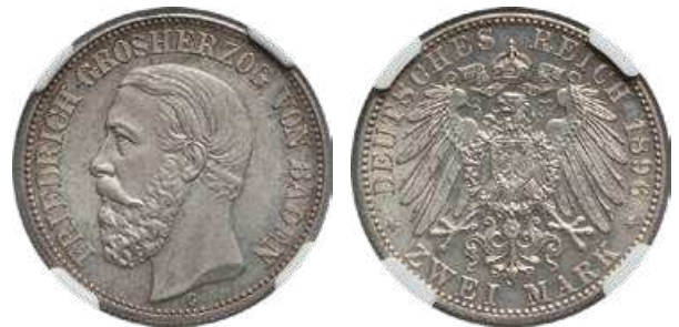
33831 Baden. Friedrich I 2 Mark 1896-G MS65 NGC, Stuttgart mint, KM269. A gem Mint State example lacking any soft of surface marks or nicks which are commonly seen on this issue. The obverse exhibits a lovely satiny sheen under a light tone of iridescent hues, while the reverse is more white with a tinge of champagne underneath which a shimmering luster pulsates. Starting Bid: $150