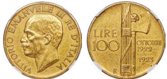
31909 Vittorio Emanuele III gold 100 Lire 1923-R AU55 Matte NGC, Rome mint, KM65. Bordering on mint condition with just a few light bag marks and a nice, bold strike. Starting Bid: $600