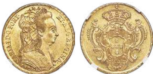
31105 Maria I gold 6400 Reis 1803-R MS62 NGC , Rio de Janeiro mint, KM226.1. A lovely piece with bright lemon-gold surfaces and stunning mint luster. From the Dresden Collection Starting Bid: $400