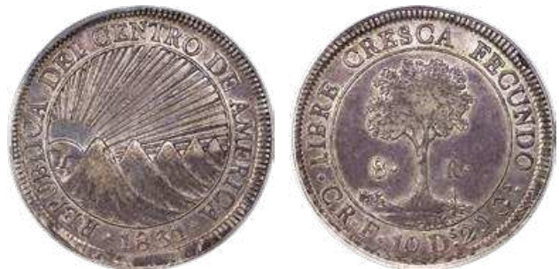
31332 Central American Republic 8 Reales 1831 CR-F XF45 PCGS , San Jose mint, KM22. A great rarity within the Central American Republican series and a type that is only available from a single year at that, a bit of highpoint rub admitted, but on the whole exceedingly appealing for the assigned grade. Besides being toned to a deep pewter, lighter silver accents brighten the features to reveal an outstanding sharpness that even AU examples frequently lack. Starting Bid: $750