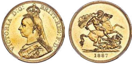
31684 Victoria gold 5 Pounds 1887 MS62+ NGC, KM769, S-3864. Practically a choice piece, superb silky luster glowing across the planchet and captivating the eye. Scattered contact marks define the grade, yet in all other respects a premium specimen for the type. Starting Bid: $1,000