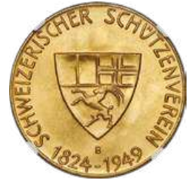
32321 Confederation gold “Graubünden - Chur Shooting Festival” Medal 1949-B MS67 NGC, Bern mint, Richter-857a. 33mm. Nearly as-struck, displaying brilliant cartwheeling golden luster and almost no handling. From the Allen Moretti Swiss Collection Starting Bid: $600