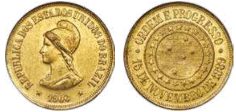
31143 Republic gold 20000 Reis 1900 MS61 NGC , Rio de Janeiro mint, KM497, Fr-124. Scarce in Mint State, the fields of this piece exhibit strong golden luster. Starting Bid: $500