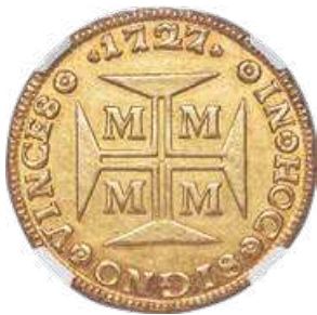
31085 João V gold 20000 Reis 1727-M MS61 NGC, Minas Gerais mint, KM117, LMB-251. An exceedingly scarce issue in Mint State, and an incredibly handsome piece. Strong underlying mint luster remains, and the attractive orange-gold of the metal is beset by an especially pleasing light rose tone. An imposing 18th-century offering which is likely to take a central position in any future owner's cabinet. Starting Bid: $3,000