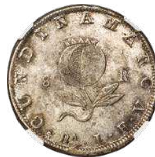
31320 Cundinamarca 8 Reales 1821 BA-JF MS61 NGC, Bogota mint, KM-C6. Toned surfaces with underlying mint brilliance and only slight striking weakness. As a type, rarely found in Mint State condition. This coin, therefore, represents an ideal target for the conditionally conscious collector. Starting Bid: $2,500