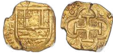
32228 Philip IV gold Cob 4 Escudos ND (1630-1647) S-R MS62 NGC , Seville mint, KM56.2, Fr-203. 13.54gm. A fine example with strongly stuck centers and a touch of light rose-gold tone in the fields and around the devices. Starting Bid: $750