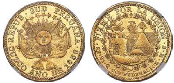
32095 South Peru. Republic gold 8 Escudos 1838 CUZCO-MS XF45 NGC , Cuzco mint, KM171, Fr-92. Beyond eye appealing for the assigned grade, the surfaces awash with shimmering golden luster, caressing bold devices struck to the highest level of precision. Only light rub exists at the higher points, resulting in a degree of detail that is truly remarkable to behold. Representing an ever-popular Latin American type, this example, with its stellar visual charm, cannot be ignored. Starting Bid: $1,000