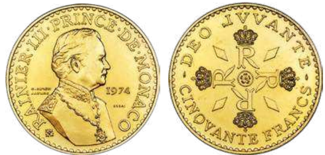
32010 Ranier III gold Specimen Essai 50 Francs 1974-(a) SP66 PCGS , Paris mint, KM-E67, Gad-162. A scarce gold Pattern of the 50 Francs Essai type, commemorating the 25th anniversary of Ranier III's reign. Well-struck and lightly handled, with a distinct reflectivity seen in the fields. Starting Bid: $750