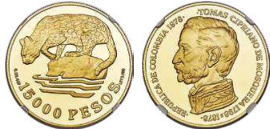
31331 Republic 3-Piece Certified gold & silver Conservation Proof Set 1978 NGC , 1) "Crocodile" 500 Pesos - PR69 Ultra Cameo, KM264 2) "Hummingbird" 750 Pesos - PR68 Ultra Cameo, KM265 3) gold "Ocelot" 15,000 Pesos - PR69 Ultra Cameo, KM266

A pristine conservation set marked by a near-pinnacle quality of preservation for every included issue. The gold 15,000 Pesos saw a mintage of only 148 examples. (Total: 3 coins) Starting Bid: $1,250