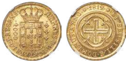
31110 João Prince Regent gold 4000 Reis 1812-(R) MS63 NGC , Rio de Janeiro mint, KM235.2. A superbly struck specimen with a bright lemon-gold chroma, satiny luster and light mirroring along the peripheries. From the Dresden Collection Starting Bid: $400