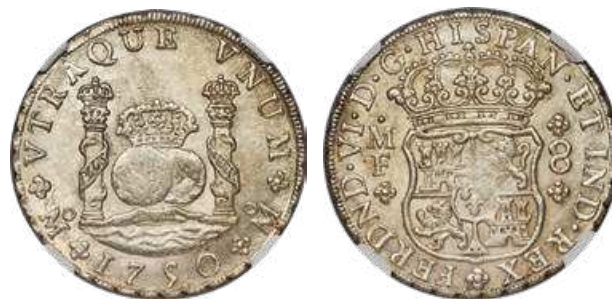
31944 Ferdinand VI 8 Reales 1750 Mo-MF MS63 NGC , Mexico City mint, KM104.1. Satiny and frosty, overlaid with a pleasing feather-light silver tone which conveys a unique charm to this desirable selection. NGC has seen only a single example finer. Starting Bid: $1,000