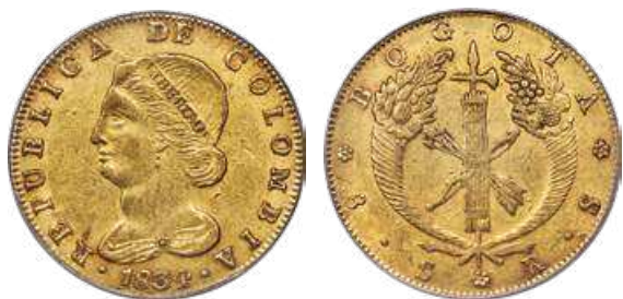
31324 Republic gold 8 Escudos 1834 BOGOTA-RS AU55 PCGS , Bogota mint, KM82.1. A handsome example exhibiting a robust luster with a medium golden chroma, minimal signs of handling evident, primarily noticeable in the centers but not detracting from the overall eye-appeal, the legends quite bold. Starting Bid: $500