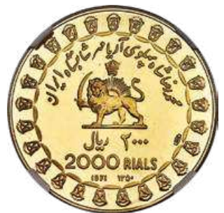
31835 Muhammad Reza Pahlavi gold Proof "2500th Anniversary of the Persian Empire" 2000 Rials SH 1350 (1971) PR66 Cameo NGC, Tehran mint, KM1192. Mintage: 9,805. Fully reflective and free of all but the most miniscule instances of handling. Starting Bid: $500