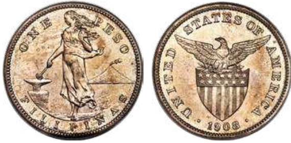
32104 USA Administration Proof Peso 1908 PR62 PCGS , Philadelphia mint, KM172, Allen-17.02. Proof-only and only 500 pieces struck. An attractive piece with light toning and a sharp, clean strike. Light luster emanates from the fields, and evidence of handling is slight with just a few wispy friction marks noted. Starting Bid: $350