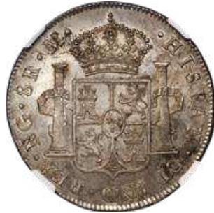
31743 Charles IV 8 Reales 1797/6 NG-M MS64 NGC , Guatemala City mint, KM53, Cal-Type 74. A superb near-gem example, this outstanding piece is fully struck with scattered light russet patina and highly reflective obverse fields. Tied with one other example for the finest certified by NGC and PCGS combined. Rare. Ex. Isabel de Trastamara Collection Starting Bid: $1,500