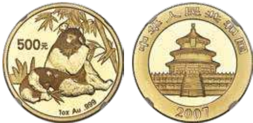
30331 People's Republic gold Panda 500 Yuan (1 oz) 2007 MS70 NGC, KM1713, PAN-423A. Glimmering with deeply prooflike fields and heavily frosted devices.

Estimate: $1,200-$1,400 Starting Bid: $600