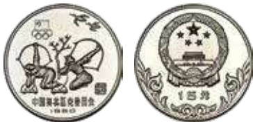
30173 People's Republic silver Proof Piefort "Archery" 15 Yuan 1980 PR69 Ultra Cameo NGC, KM-P11. Struck in a limited issue of only 1,000. The devices are highly frosted and contrast fully against the mirrorlike fields.

Estimate: $3,000-$3,500 Starting Bid: $1,500