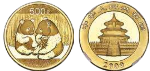
30334 People's Republic gold Panda 500 Yuan (1 oz) 2009 MS69 NGC, KM1872, PAN-498A. Graced with a deep cameo contrast and flawless features.

Estimate: $1,200-$1,400 Starting Bid: $600