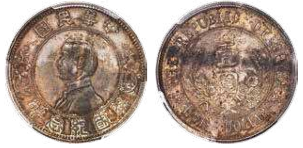
30139 Republic Sun Yat-sen "Memento" Dollar ND (1912) XF Details (Damage) PCGS, KM-Y319, L&M-42. Low Stars variety. Deeply toned and attractive despite the noted damage, which seems primarily confined to a form of moderate corrosion on the reverse.

1912年孫中山像開國紀念壹圓銀幣。AU55 PCGS。下五星版，非常受歡迎的系列。此枚充滿了深紫羅蘭色的木炭邊緣的豐富斑駁，正面和背面的細節銳利。出自：Anderson 舊藏。 Estimate: $1,000-$1,500 Starting Bid: $500