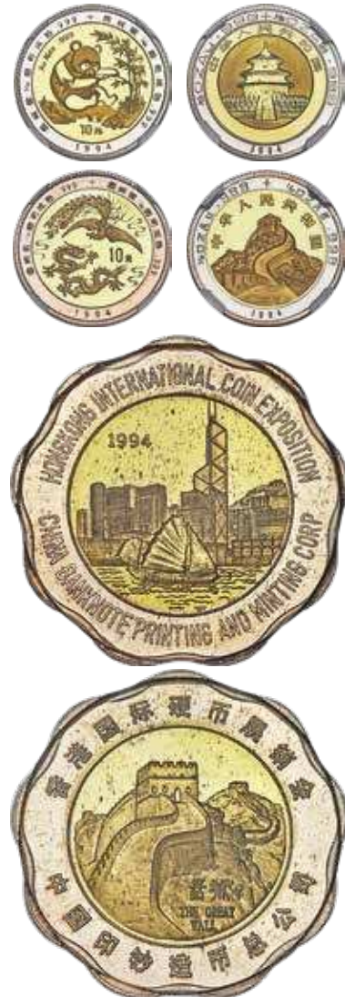
30184 People's Republic 3-Piece bi-metallic gold & silver Proof Set 1994,

1993年「毛澤東誕辰一百周年紀念」50元精製銀幣(5盎司)。PR68 Ultra Cameo NGC。發行量1,500枚。雄偉的一枚，為慶祝中華人民共和國始創人。附有原廠盒和證書編號1152。 Estimate: $800-$1,200 Starting Bid: $400