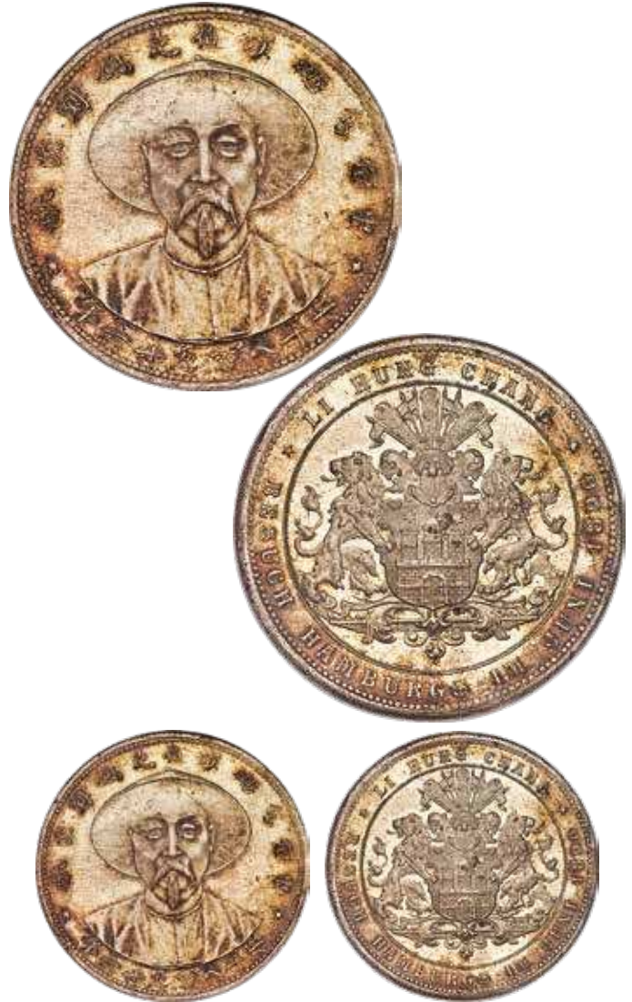
30058 Li Huang Chang silvered bronze Medal 1896 MS64 PCGS, L&M-935, Wurbach-5175. 40mm. A very rare German-produced medal produced to commemorate the visit of Chinese politician, general, diplomat, and Viceroy of the Chihli Province Li Huang Chang (Li Hongzhang) to Hamburg. Known for both his success in the suppression of the Taiping Rebellion and well as his failures in supporting Russia against the Japanese, he served as a pioneer of the Chinese military as well as leading its industrial modernization. Still fully watery with soft champagne backlight and mottled russet tone that collects around the characters, this example appears fully covetable and serves as an intriguing convergence between historical interest and aesthetic beauty.

1896年李鴻章訪問德國鍍金銅章。UNC Detail (Harshly Cleaned) PCGS。為紀念李鴻章訪問德國漢堡而鑄造。設計明亮，稀少的品種，具高度收藏價值，完整的鍍金完好無損。 Estimate: $900-$1,200 Starting Bid: $450