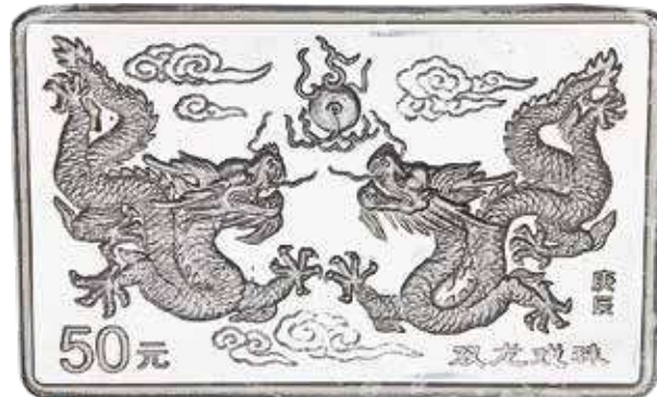
30225 People's Republic silver Proof "Year of the Dragon" 50 Yuan (5 oz) Bar 2000, KM1323. 50x80mm. Mintage: 1,888. A flashy and low-mintage silver bar with deep cameo contrasts and not a trace of haze. Comes sealed in the original mint vinyl and capsule with COA #1421.

2000年龍年生肖50元長方形精製銀幣(5盎司)。50x80毫米。發行量1,888枚。華麗低調，對比深峻分明。密封於原廠膠盒，附有原廠證書#1421。 Estimate: $900-$1,200 Starting Bid: $450