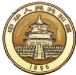
30299 People's Republic gold Proof Panda 100 Yuan (1 oz) 1995 PR68 Ultra Cameo NGC, KM726, PAN-242A. Mintage: 2,000. Deeply mirrored and exhibiting satiny devices, lending a superb "cameo" appearance. A superior example of this scarce date.

1995年熊貓100元精製金幣(1盎司)。PR68 Ultra Cameo NGC。發行量2,000枚。呈光滑鏡像，壓印深峻。圖案分明，極罕有。值得以高價投得。 Estimate: $4,000-$6,000 Starting Bid: $2,000