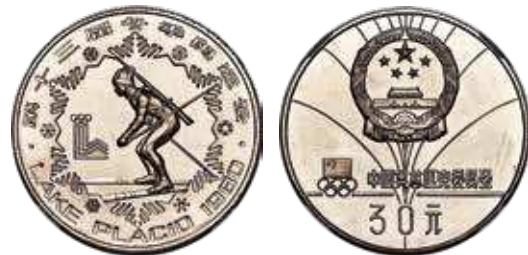
30175 People's Republic silver Proof Piefort "Biathlon" 30 Yuan 1980 PR68 Ultra Cameo NGC, KM-P17. Lake Placid Winter Olympics issue. Only 1,000 minted.

Estimate: $800-$1,200 Starting Bid: $400