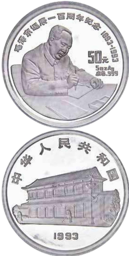
30183 People's Republic silver Proof "100th Anniversary of the Birth of Mao Zedong" 50 Yuan (5 oz) 1993 PR68 Ultra Cameo NGC, KM543, Cheng-pg. 133, 3. Mintage: 1,500. An imposing, large-size specimen celebrating the founder of the People's Republic, and accompanied by its case of issue and COA #1152.

1993年「毛澤東誕辰一百周年紀念」50元精製銀幣(5盎司)。PR68 Ultra Cameo NGC。發行量1,500枚。雄偉的一枚，為慶祝中華人民共和國始創人。附有原廠盒和證書編號1152。 Estimate: $800-$1,200 Starting Bid: $400