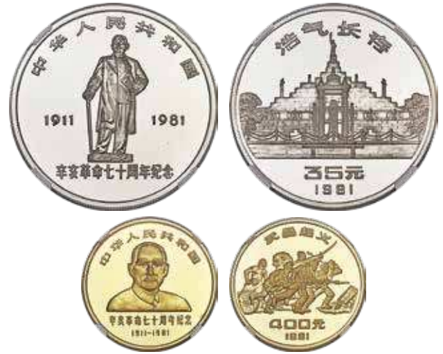
30178 People's Republic 2-Piece Certified gold & silver "1911 Xinhai Revolution" Yuan Proof Set 1981 Ultra Cameo NGC, 1) silver 35 Yuan - PR68, KM50. Mintage: 3,885 2) gold 400 Yuan - PR69, KM51. Mintage: 1,338. AGW 0.3939 oz.

Estimate: $4,000-$6,000 Starting Bid: $2,000