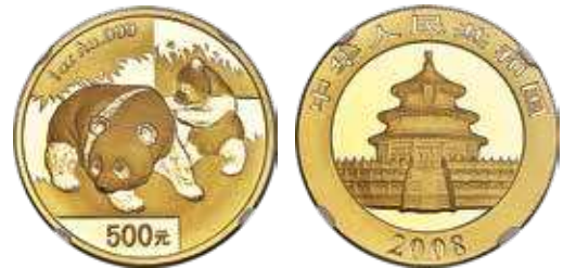
30333 People's Republic gold Panda 500 Yuan (1 oz) 2008 MS70 NGC, KM1821, PAN-485A. A piece that is in all respects flawless, splendid deep cameo contrasts existing between the fields and devices.

Estimate: $1,200-$1,400 Starting Bid: $600