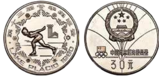
30174 People's Republic silver Proof Piefort "Speed Skating" 30 Yuan 1980 PR68 Ultra Cameo NGC, KM-P15. Lake Placid Winter Olympics issue. Only 1,000 minted.

Estimate: $800-$1,000 Starting Bid: $400