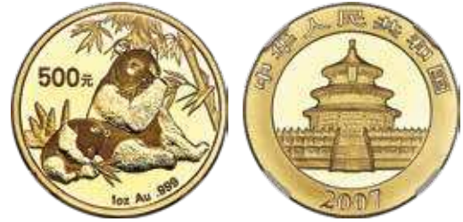
30332 People's Republic gold Panda 500 Yuan (1 oz) 2007 MS69 NGC, KM1713, PAN-423A. An ever-popular issue with prooflike, fully reflective fields and a visually appealing wide rim around the Temple of Heaven.

Estimate: $1,200-$1,400 Starting Bid: $600