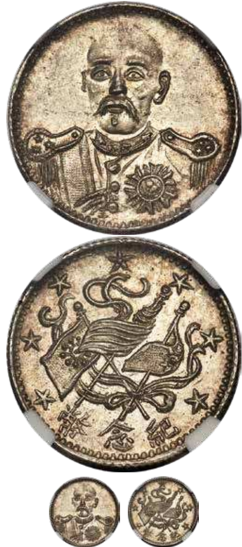
30128 Republic Feng Kuo-Chang silver Fantasy 10 Cents (10 Dollar silver Pattern) ND MS64 NGC, cf. KM-X680 (in gold), Kann-B94 (same). Interestingly described as a "10 Cents" on the holder, the type, in fact, appears to be identical to the Feng Kuo-Chang Fantasy $10 gold issue, rendering this indisputably rare issue a likely example of a silver pattern for this fantasy gold type. Well struck and lustrous, and without a doubt an intriguing addition to its future owner's cabinet, where it is certain to rank among the scarcest of coins, regardless of its surroundings.

Estimate: $5,000-$8,000 Starting Bid: $2,500