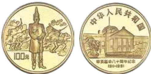
30179 People's Republic 2-Piece Certified gold and silver "1911 Revolution" Proof Set 1991 Deep Cameo PCGS, 1) silver 50 Yuan (5 oz) - PR67, KM382 2) gold 100 Yuan (1 oz) - PR69, KM384

A scarce type set with only 1,000 produced, both coins accompanied by their original certificates of authenticity (#610) and sold with case of issue. (Total: 2 coins)