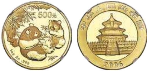
30330 People's Republic gold Panda 500 Yuan (1 oz) 2006 MS70 NGC, KM1657, PAN-405A. A piece which, simply put, could not be improved upon.

Estimate: $1,200-$1,400 Starting Bid: $600