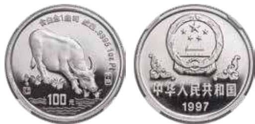
30224 People's Republic platinum Proof "Year of the Ox" 100 Yuan (1 oz) 1997 PR68 Ultra Cameo NGC, KM1008. Mintage: 300. An elusive Lunar Series platinum issue that celebrates the year of the ox. Very scarcely offered and highly collectible in this impressive grade. Sold with COA# 0288.

1997年牛年生肖100元精製鉑幣。PR68 Ultra Cameo NGC。發行量僅300枚。罕見的一枚生肖系列鉑幣，為慶祝農曆牛年而鑄造。珍罕而評分亮眼，連原裝證書0288號。 Estimate: $8,000-$10,000 Starting Bid: $4,000