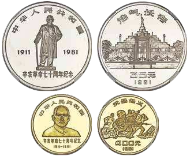
30177 People's Republic 2-Piece Certified gold & silver "1911 Xinhai Revolution" Yuan Proof Set 1981 Ultra Cameo NGC, 1) silver 35 Yuan - PR69, KM50. Mintage: 3,885. 2) gold 400 Yuan - PR70, KM51. Mintage: 1,338. AGW 0.3939 oz.

A truly flawless and enviable Revolution Anniversary set. Comes with the original case of issue. Very scarce. (Total: 2 coins)