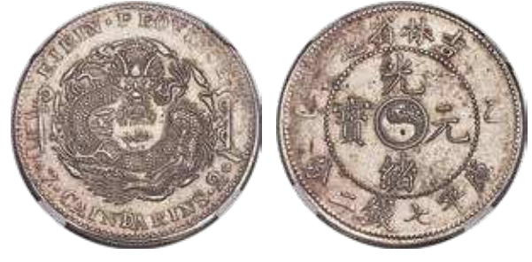
30094 Kirin. Kuang-hsü Dollar CD 1905 AU53 NGC, KM-Y183a.3, L&M-557. Rosettes variety. Although the luster on this example is subdued from its full Mint State condition, there is little actual wear apparent across the surfaces, which reveal a strong level of detail softened only in isolated areas by a lightness of strike. Very appealing, both for the type and the assigned grade.

Estimate: $1,000-$1,500 Starting Bid: $500