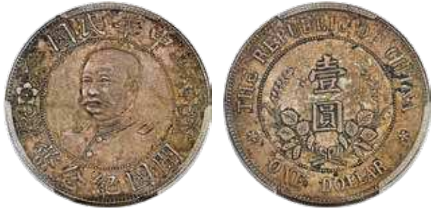
30136 Republic Li Yuan-hung Dollar ND (1912) XF Detail (Chop Mark) PCGS, KM-Y321, L&M-45. An immensely popular and naturally alluring type, gunmetal tone accentuated by rich russet patination and a minor degree of doubling visible in the legends.

1912年黎元洪像開國紀念壹圓銀幣。XF Detail (Chop Mark) PCGS。非常受歡迎的品種，豐富的赤褐色包漿，幣下方帶青銅色調，圖文下有輕微重影。 Estimate: $1,000-$1,500 Starting Bid: $500