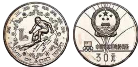
30176 People's Republic silver Proof Piefort "Alpine Skiing" 30 Yuan 1980 PR68 Ultra Cameo NGC, KM-P16. Lake Placid Winter Olympics issue. Only 1,000 minted.

Estimate: $800-$1,200 Starting Bid: $400