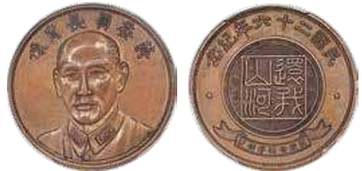
30114 Taiwan. Republic copper “Chiang Kai-shek” Medal ND (1937) MS63 Brown PCGS, L&M-968 var (copper). An exceptionally scarce medal displaying the bust of Chiang Kai-shek on the obverse with four Chinese characters within a geometric design on the reverse. Sharply struck and toned to a rich caramel brown. This is the first example we have offered, a fact indicative of how difficult this particular type is.

民國二十六年（1937）蔣介石紀念銅章。MS63 Brown PCGS。罕見的銅質紀念章。正面有蔣介石胸像，背面有幾何圖形設計，內有「還我山河」幣文。壓鑄深峻，覆濃厚的棕色包裝。海瑞得經手的首枚，可見此紀念章極難尋獲。