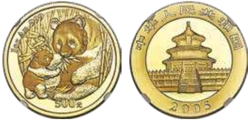
30329 People's Republic gold Panda 500 Yuan (1 oz) 2005 MS69 NGC, KM1582, PAN-388A. Shimmering with bright watery finish and not a mark to speak of.

2005年熊貓500元金幣(1盎司)。MS69 NGC。閃閃發光，明亮的水潤表面，完美的一枚。