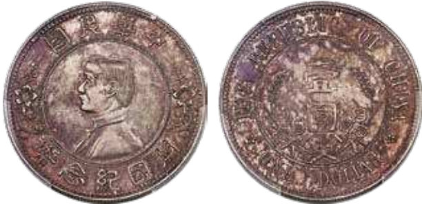
30138 Republic Sun Yat-sen "Memento" Dollar ND (1912) AU55 PCGS, KM-Y319, L&M-42. Low Stars variety. A scarcer variety of this ever-popular issue amongst collectors, further imbued with a rich mottled patination of charcoal edging on deep violet, and a perceivable sharpness to both the obverse and reverse legends. Ex. Anderson Collection

1912年孫中山像開國紀念壹圓銀幣。AU55 PCGS。下五星版，非常受歡迎的系列。此枚充滿了深紫羅蘭色的木炭邊緣的豐富斑駁，正面和背面的細節銳利。出自：Anderson 舊藏。 Estimate: $1,000-$1,500 Starting Bid: $500