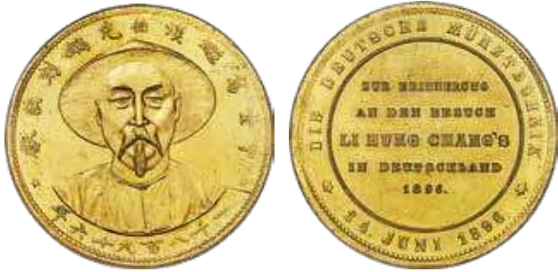
30057 Li Huang Chang gilt copper Medal ND (1896) UNC Detail (Harshly Cleaned) PCGS, L&M-934 var (gilt copper). Struck in commemoration of Li Hung Chang's visit to Hamburg. Cleaned, though with lighter hairlines than is often seen for this designation. Scarce and highly collectible with full gilding intact.

1896年李鴻章訪問德國鍍金銅章。UNC Detail (Harshly Cleaned) PCGS。為紀念李鴻章訪問德國漢堡而鑄造。設計明亮，稀少的品種，具高度收藏價值，完整的鍍金完好無損。 Estimate: $900-$1,200 Starting Bid: $450