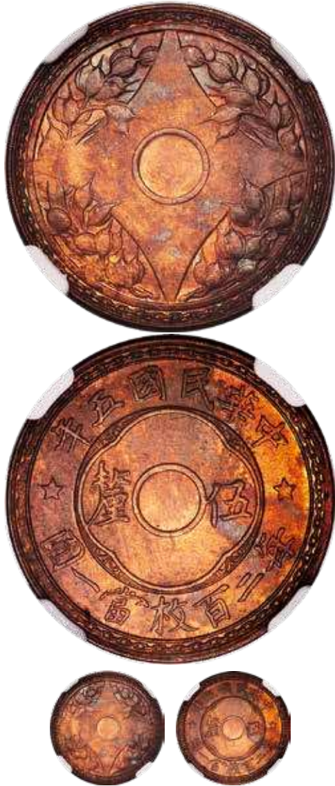
30127 Republic Mint Error - "Unpunched Hole" 1/2 Cent Year 5 (1916) MS63 Red and Brown NGC, KM-Y323 CL-MG50. A rare example of this early Republic type without the characteristic hole punched out of the middle. Lustrous and mostly red, with elements of steel and burgundy tone.

民國五年 (1916) 伍釐銅幣。錯體版未打孔。MS63 Red and Brown NGC。民國錢幣系列十分罕見的一枚，中央未有打孔。有光澤且多為紅色，具有鋼和酒紅色調。