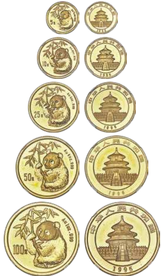
30300 People's Republic 5-Piece Certified gold Panda Yuan Set 1995 NGC,

1995年熊貓100元精製金幣(1盎司)。PR68 Ultra Cameo NGC。發行量2,000枚。呈光滑鏡像，壓印深峻。圖案分明，極罕有。值得以高價投得。 Estimate: $4,000-$6,000 Starting Bid: $2,000