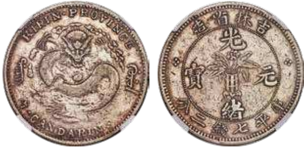
30093 Kirin. Kuang-hsü Dollar ND (1898) VF20 NGC, KM-Y183, L&M-509. This specimen displays a notable degree of residual luster despite its time in circulation, with a steely accenting tone emboldening the devices. A scarce type sought at all grade levels.

1898年吉林省造光緒元寶七錢二分銀幣。VF20 NGC。“士吉爾寶四點花版”，為吉林幣中第一大版。流通下餘光猶存，圖文帶有鋼色，此評分難得一見的一枚。