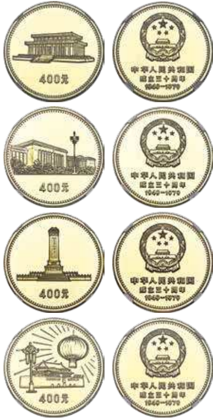
30172 People's Republic 4-Piece Certified gold "30th Anniversary of the People's Republic" 400 Yuan Proof Set 1979 NGC, 1) "Mao Memorial Hall" 400 Yuan - PR70 Cameo, KM6 2) "Hall of the People" 400 Yuan - PR70, KM7 3) "Heroes Monument" 400 Yuan - PR69, KM5 4) "Tiananmen Square" 400 Yuan - PR69, KM4

KM-PS1. A pristine set of commemorative issues, all perfectly or almost perfectly graded. Sold with case of issue and COA #21898. AGW 2.0 oz. (Total: 4 coins)