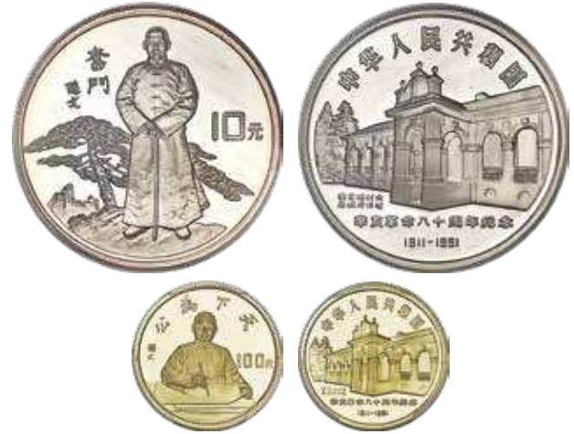
30180 People's Republic 2-Piece Certified gold & silver "1911 Revolution" Yuan Proof Set 1991 Deep Cameo PCGS, 1) silver 10 Yuan - PR68, KM383. Mintage: 2,500 2) gold 100 Yuan - PR69, KM384. Mintage: 1,000. AGW 0.999 oz.

稀有的一套，只發行1000枚，兩枚硬幣附有原裝盒及證書，編號為610。 Estimate: $4,000-$6,000 Starting Bid: $2,000