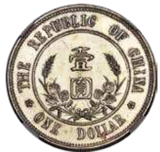
30137 Republic Sun Yat-sen "Lower 5-Pointed Stars" Dollar ND (1912) MS63 Prooflike NGC, KM-Y319, L&M-42. Low Stars variety. Gorgeous for the type, the lightly frosted devices of this choice specimen stand in stark contrast against fields demonstrating prooflike reflectivity. This comes as a likely consequence of having been struck with freshly polished dies, which have left the faintest of vertically-oriented die polish lines in the fields, a sign of both this piece's uniqueness and its full originality.

1912年孫中山像開國紀念壹圓銀幣“鏡面”。MS63 Prooflike NGC。下五星鏡面品相。壓印極精美，打印深峻，孫像的髮紋也清晰可見，輕度磨砂。明亮動人，極具歷史價值。非常獨特的一枚。 Estimate: $6,000-$8,000 Starting Bid: $3,000